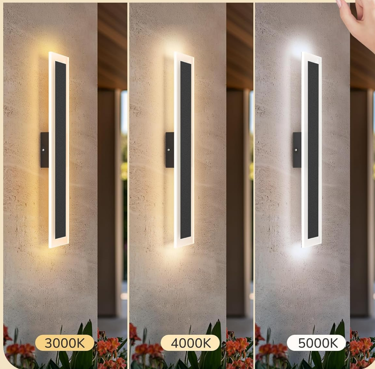
Image: Demonstrating the 3 CCT adjustable feature.