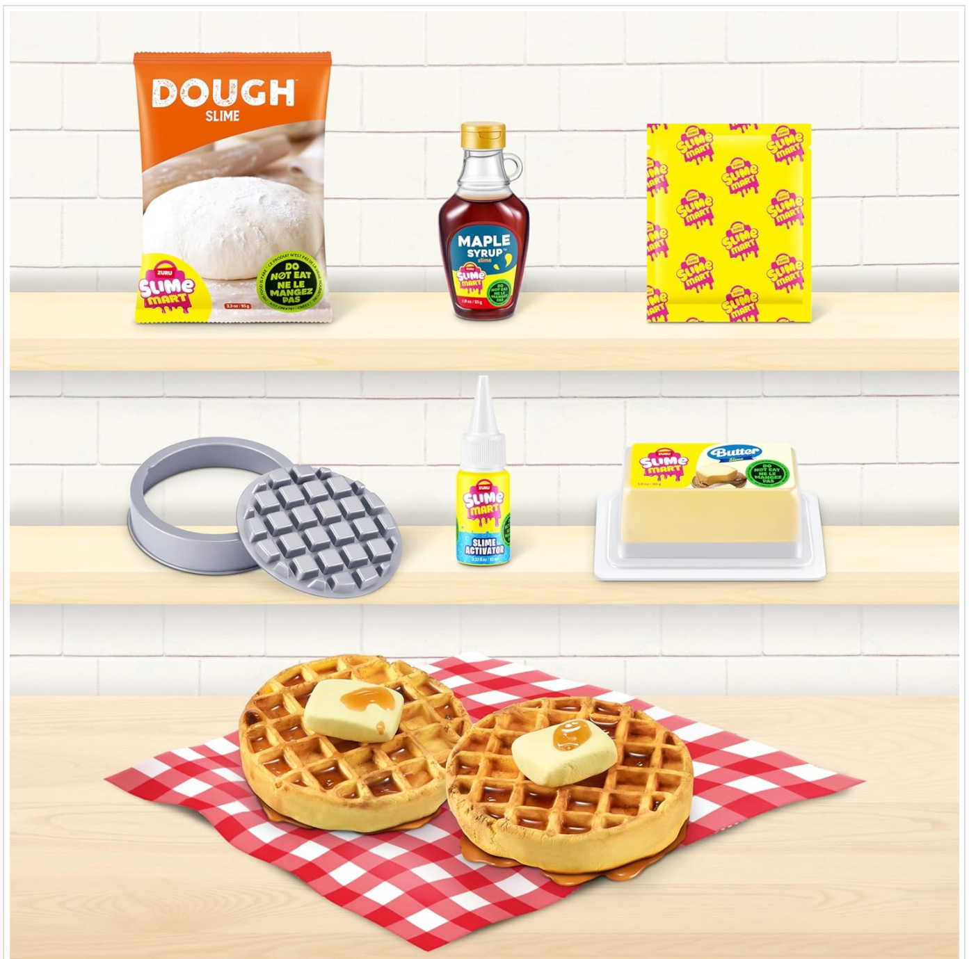
Image: Example of sensory play with the slime kit.