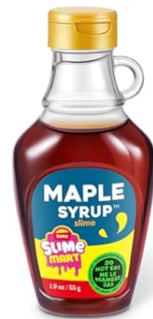
MAPLE SYRUP SLIME