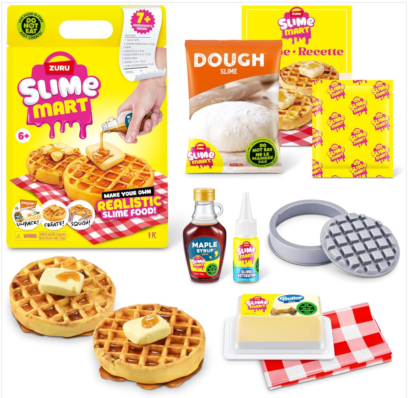
Image: ZURU Slime Mart Waffle Slime Kit packaging.