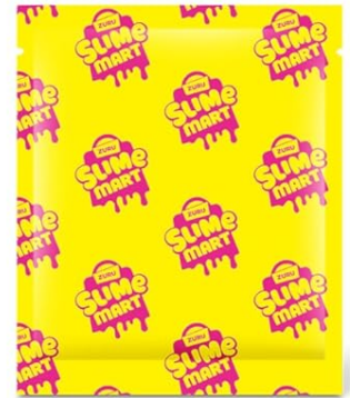
CHARRING POWDER + BRUSH