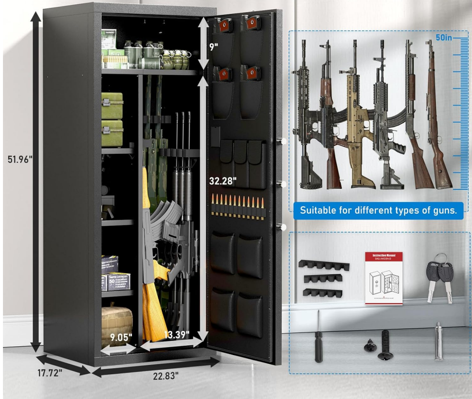
Figure 7: Large Capacity Storage Space