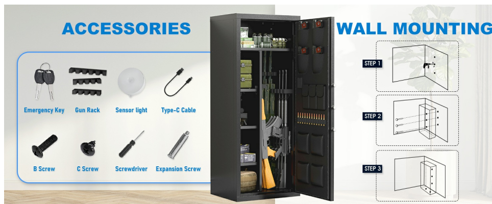
Figure 3: How to Assemble the Gun Safe