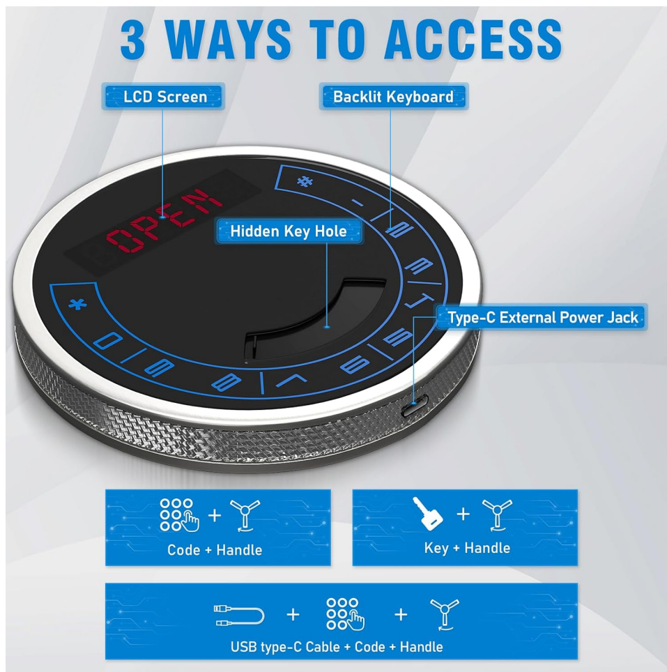
Figure 4: Three Ways to Access the Safe