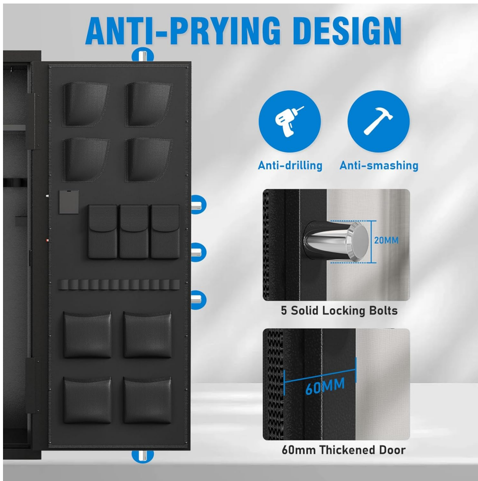
Figure 10: Anti-Prying Design