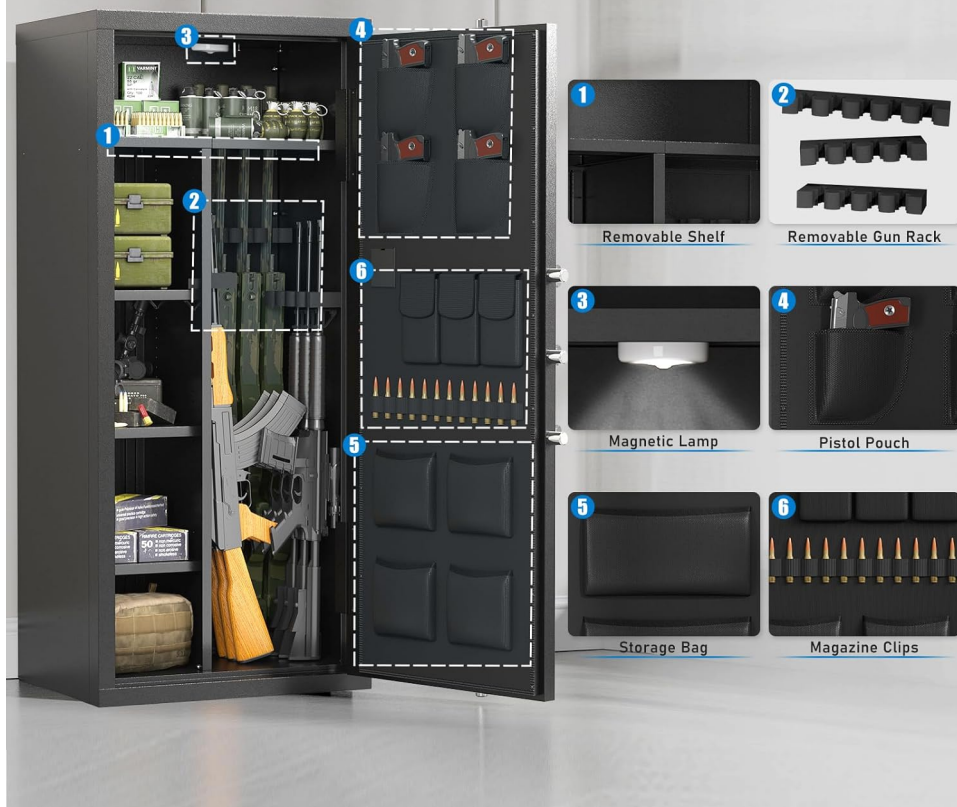
Figure 8: Product Details and Interior Layout