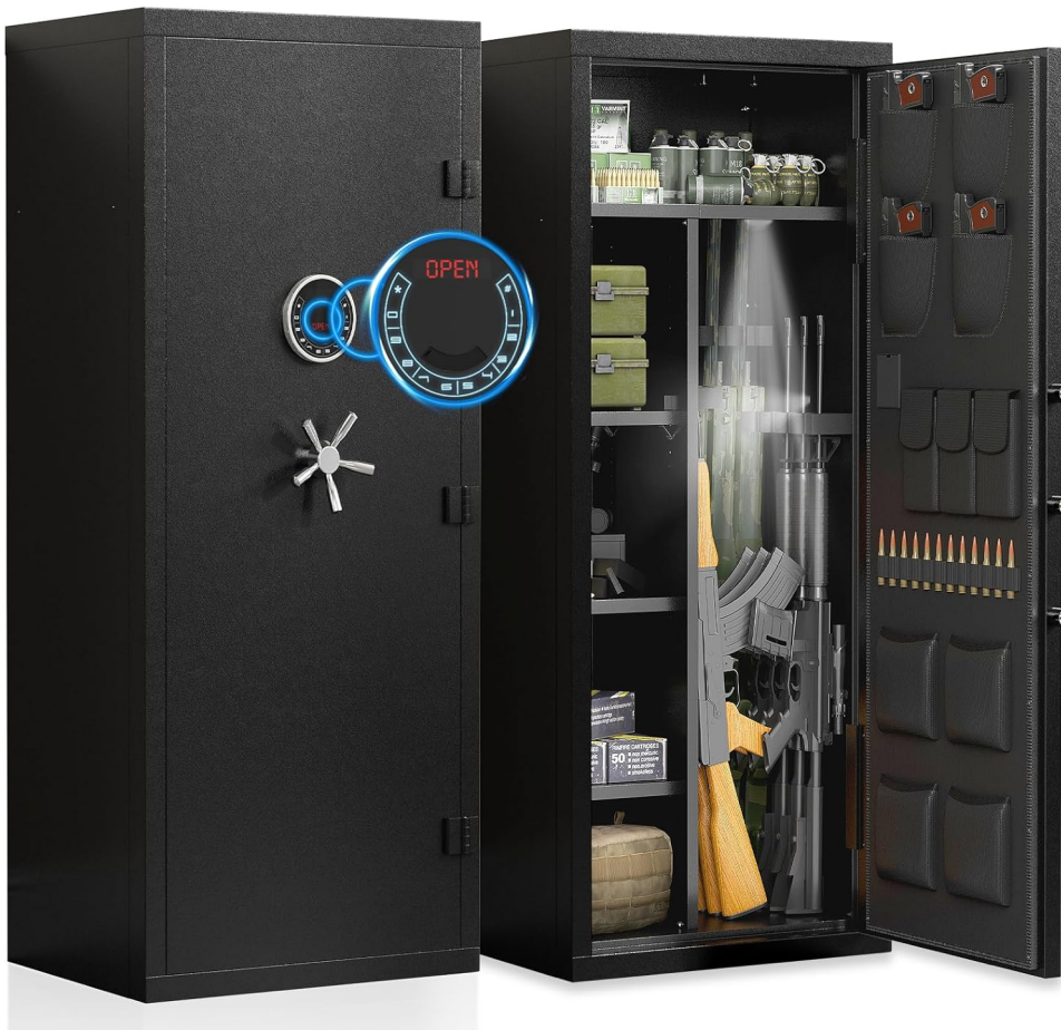
Figure 1: Riflevault 15-20 Digital Gun Safe

Thank you for choosing the Riflevault 15-20 Digital Gun Safe. This large, unassembled gun safe is designed to securely store rifles, pistols, and other valuables. It features a digital keypad, multiple unlocking methods, adjustable interior storage, and a dual alarm system for enhanced security. Please read this manual carefully before assembly and operation to ensure proper use and safety.