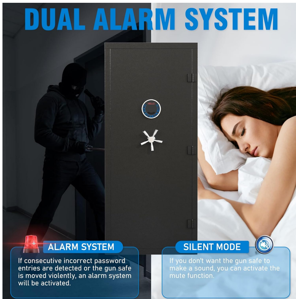
Figure 6: Dual Alarm System and Mute Function