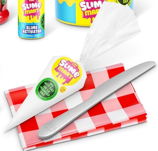
The ZURU Slime Mart Small Bag Slime Kit, featuring the packaging and a completed strawberry cake slime.