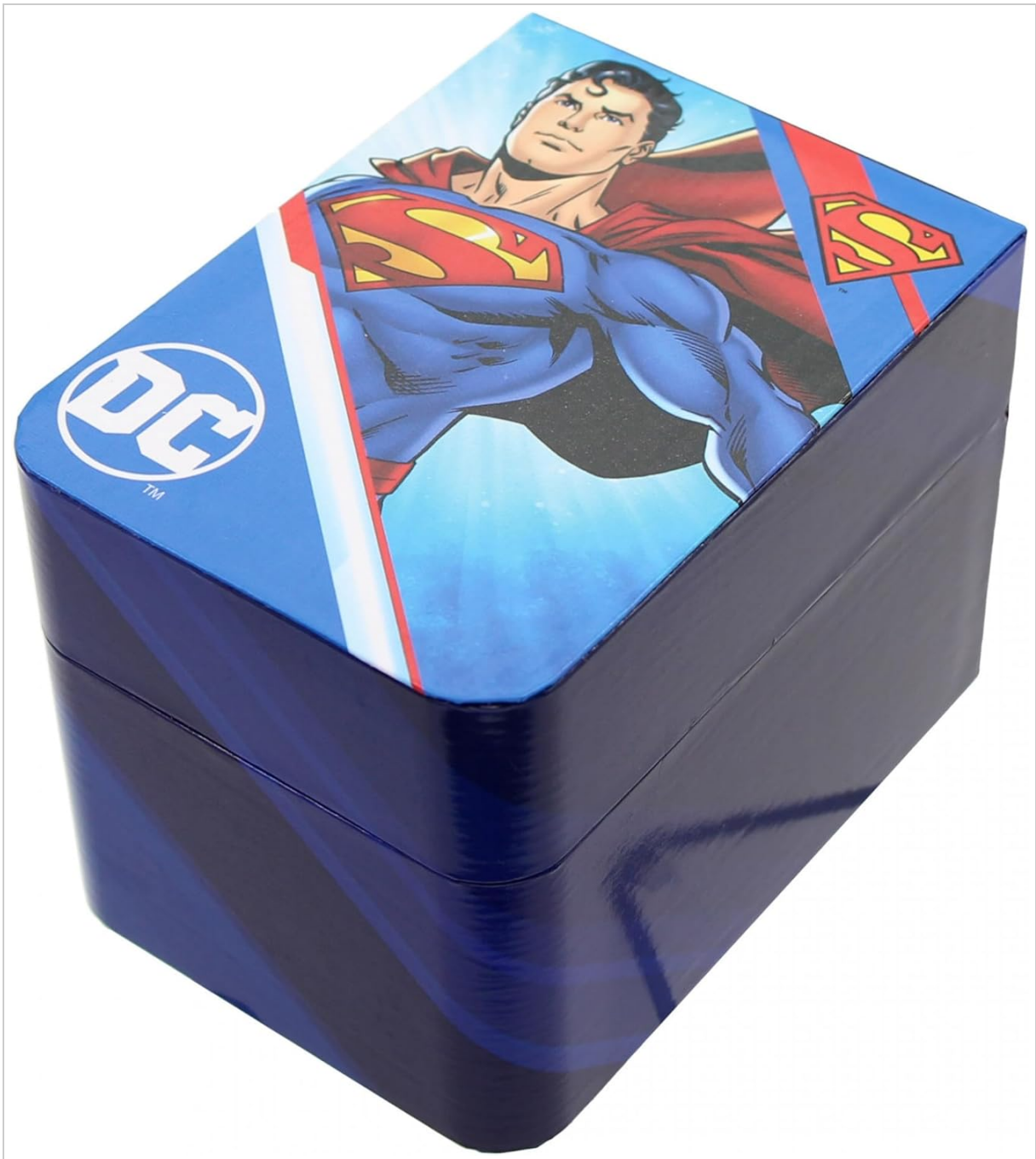
Image 4.1: The closed packaging box for the Accutime Superman watch. The box is blue with diagonal stripes and features an illustration of Superman on the lid, along with the DC Comics logo.

When not in use, store your watch in a dry, cool place, away from direct sunlight and extreme temperatures. The original packaging or a watch box is ideal for protection.