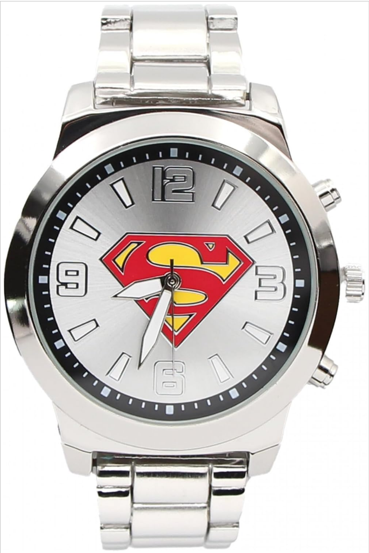
Image 1.1: Front view of the Accutime Superman Classic Logo Silver Analog Watch. The watch features a silver-tone metal band and case, with a silver dial displaying the iconic red and yellow Superman 'S' shield logo at its center. The dial has silver-tone hour markers and hands.