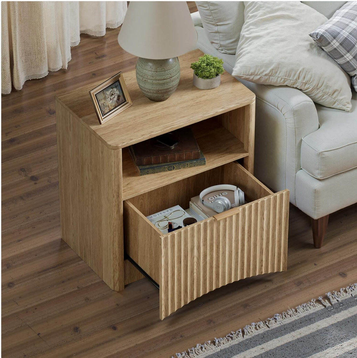
Image: An aerial view of the nightstand, showcasing the open shelf and the drawer filled with various personal items, emphasizing its organizational utility.