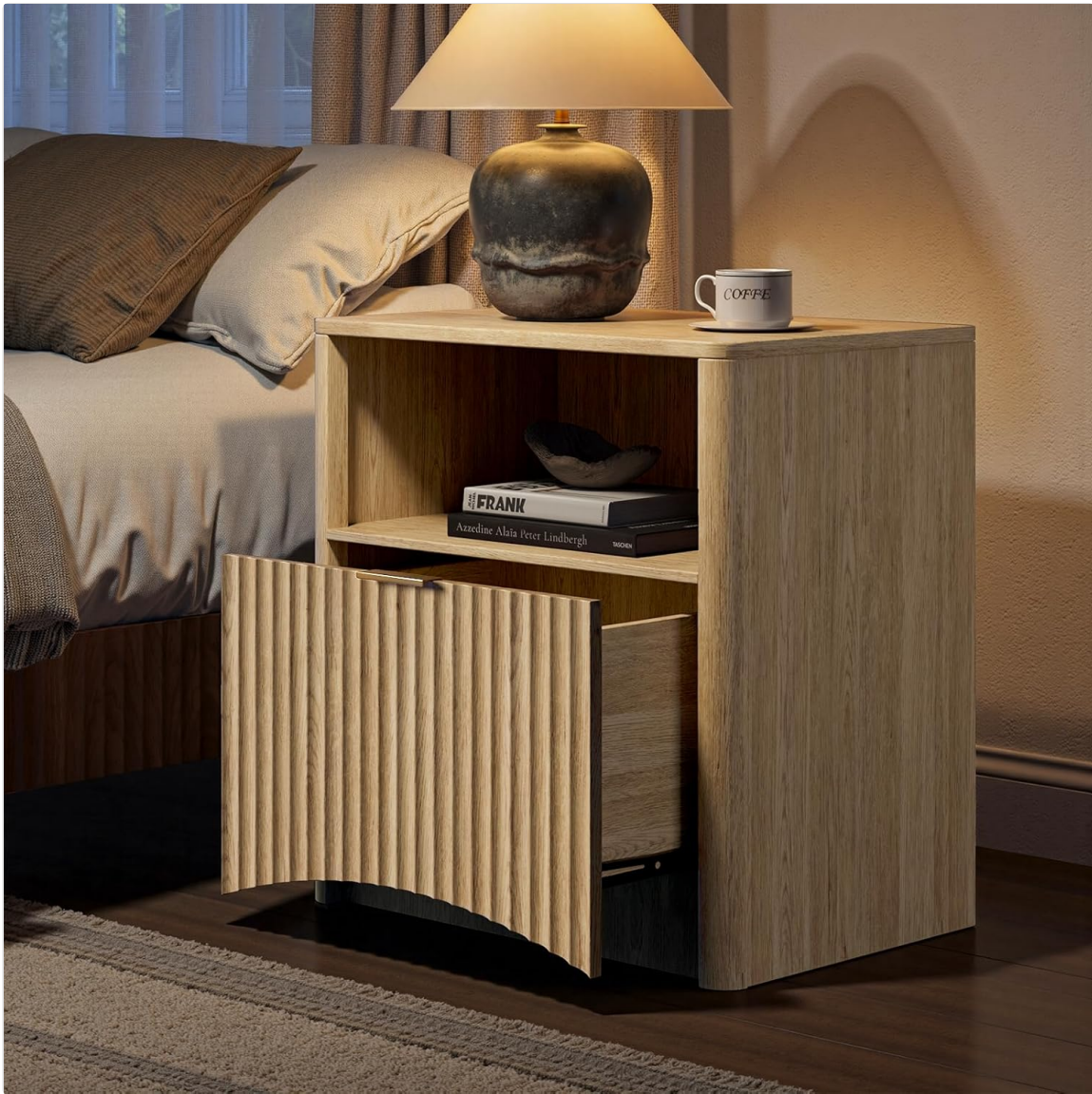
Image: The nightstand with its drawer partially open, revealing stored items like headphones and glasses, demonstrating its practical storage capacity.