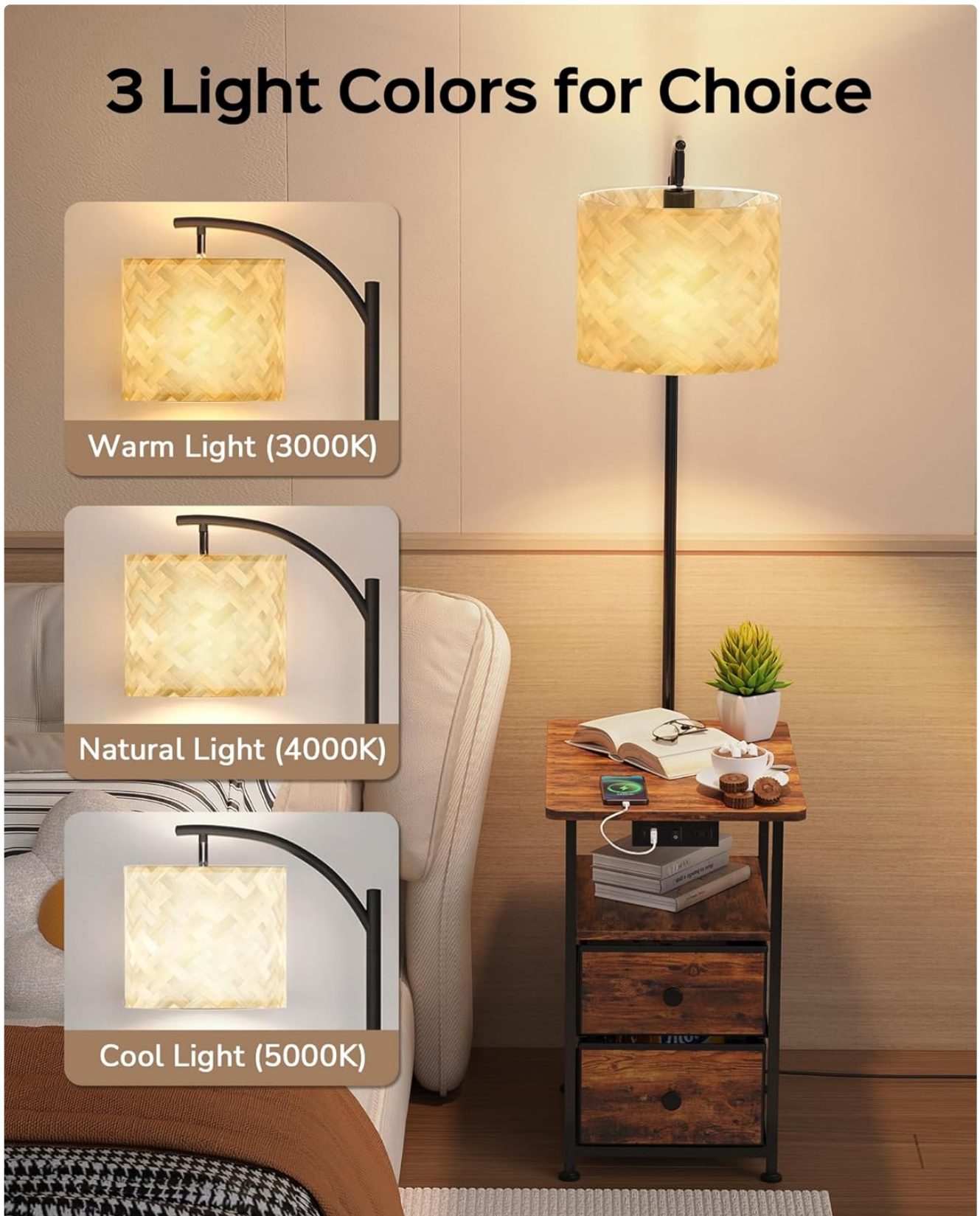
Image 5.1: Visual representation of the three available light color temperatures.