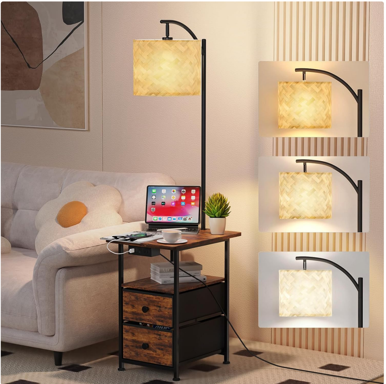
Image 1.1: The JACKYLED Floor Lamp with integrated table and drawers, demonstrating its three adjustable light color temperatures.