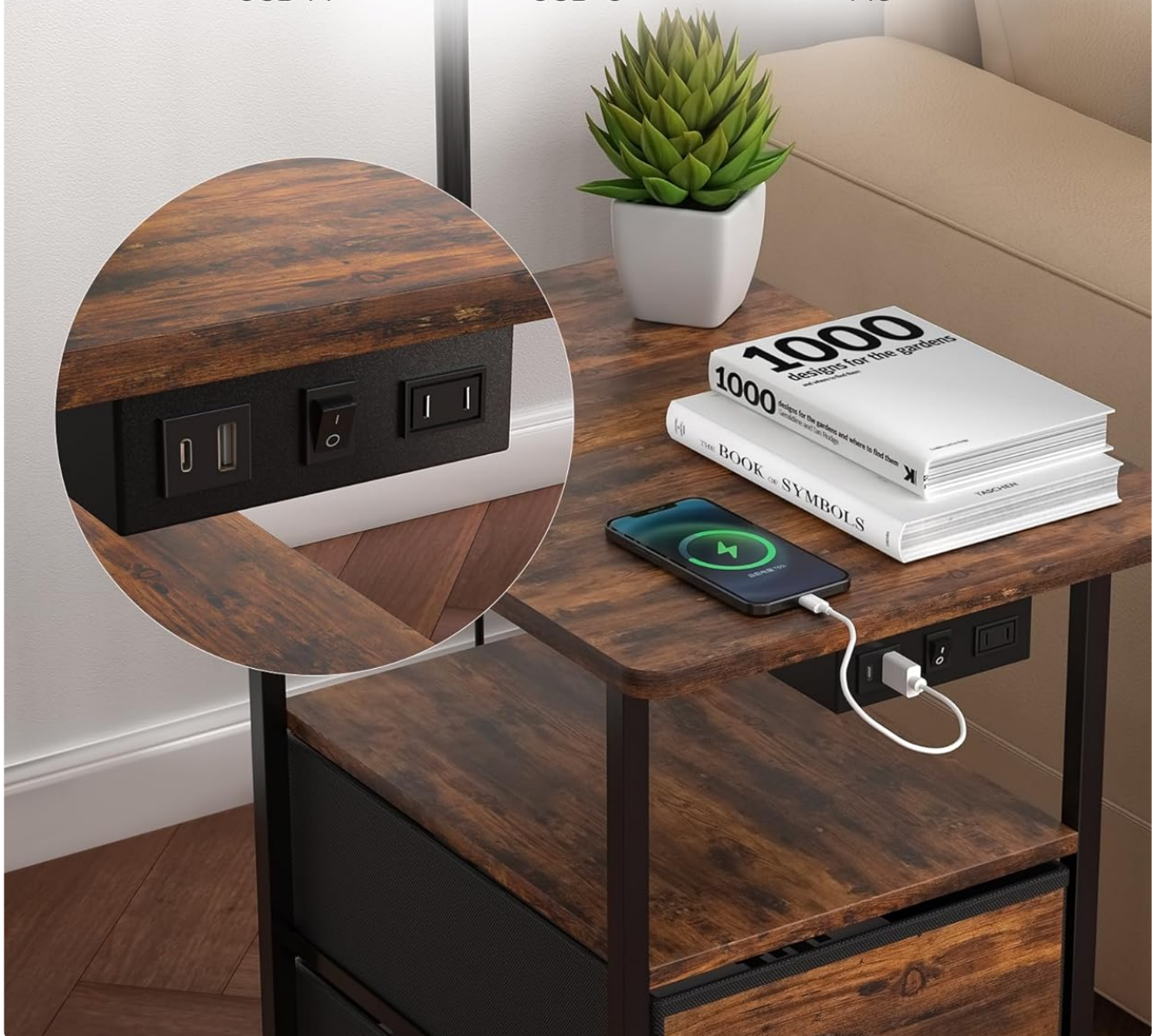
Image 5.2: The charging station with various ports for electronic devices.