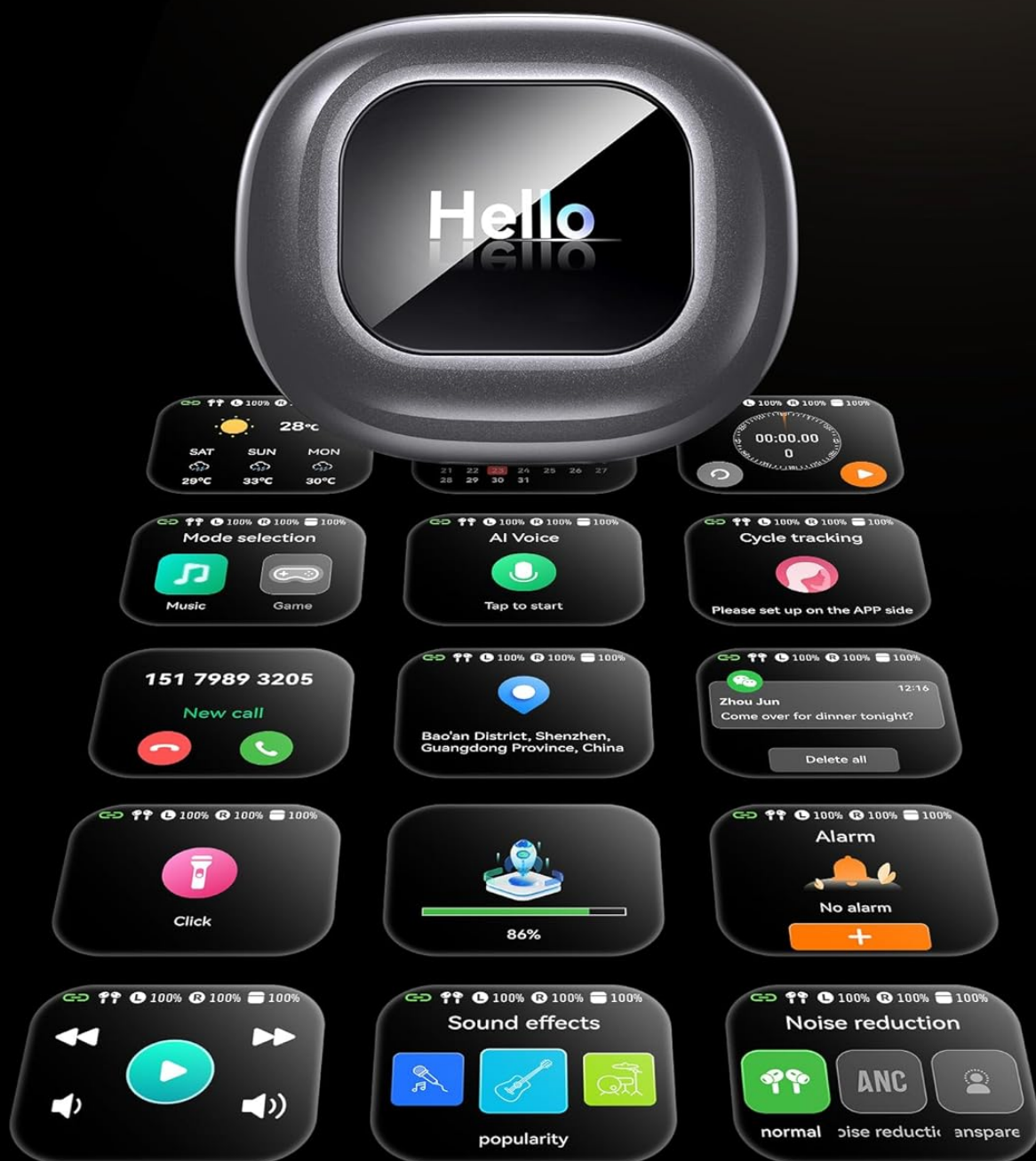
Image: The Q16 Pro's smart charging case with its interactive LCD touch screen, showing various control options.

Dynamic Interface Unlocks Fun and Innovative Features