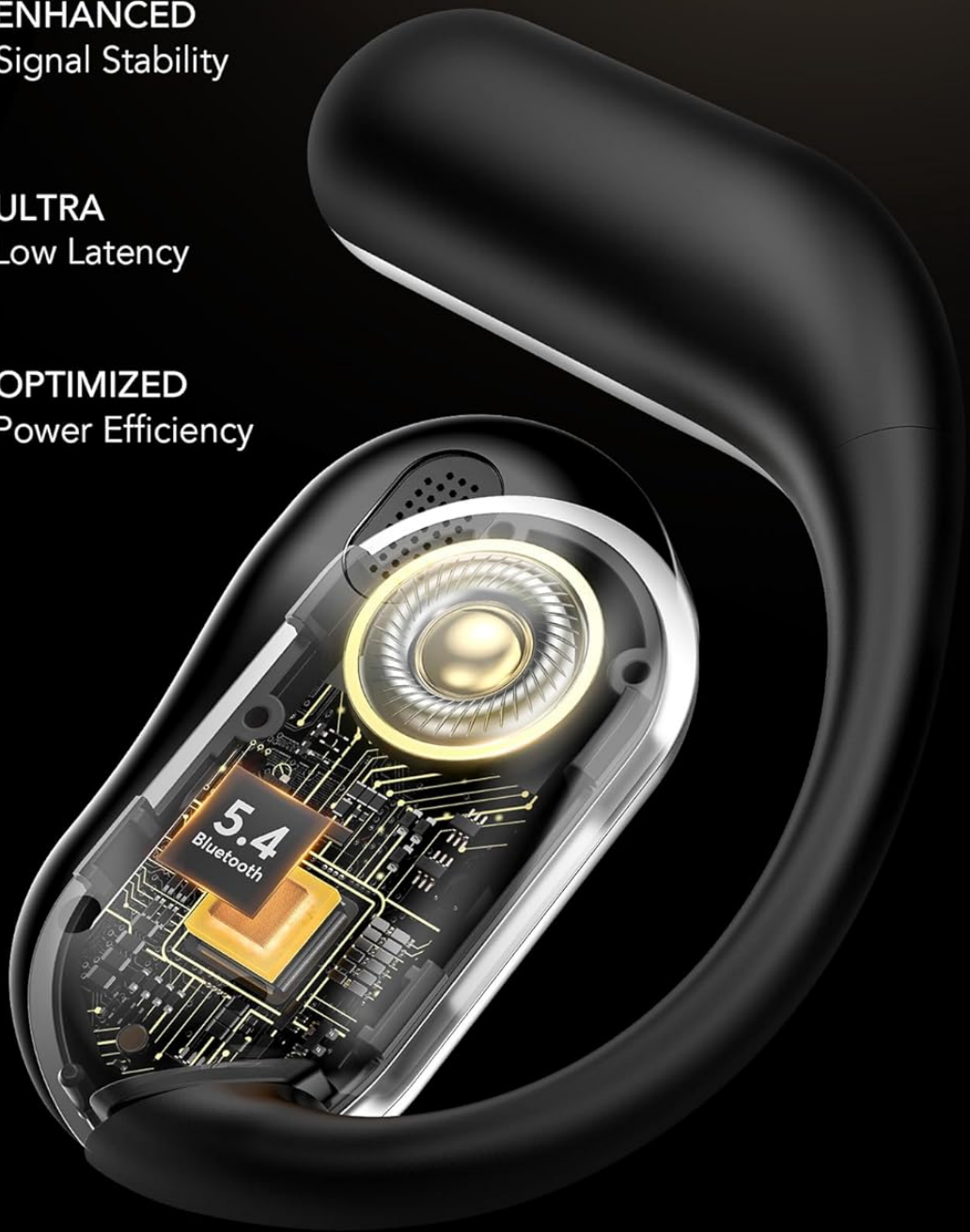
Image: An illustration detailing the advanced Bluetooth 5.4 connectivity.