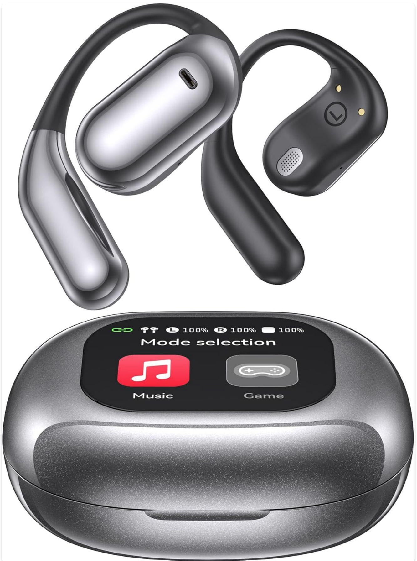
Image: The EUQQ Q16 Pro Open-Ear Headphones and their smart charging case.