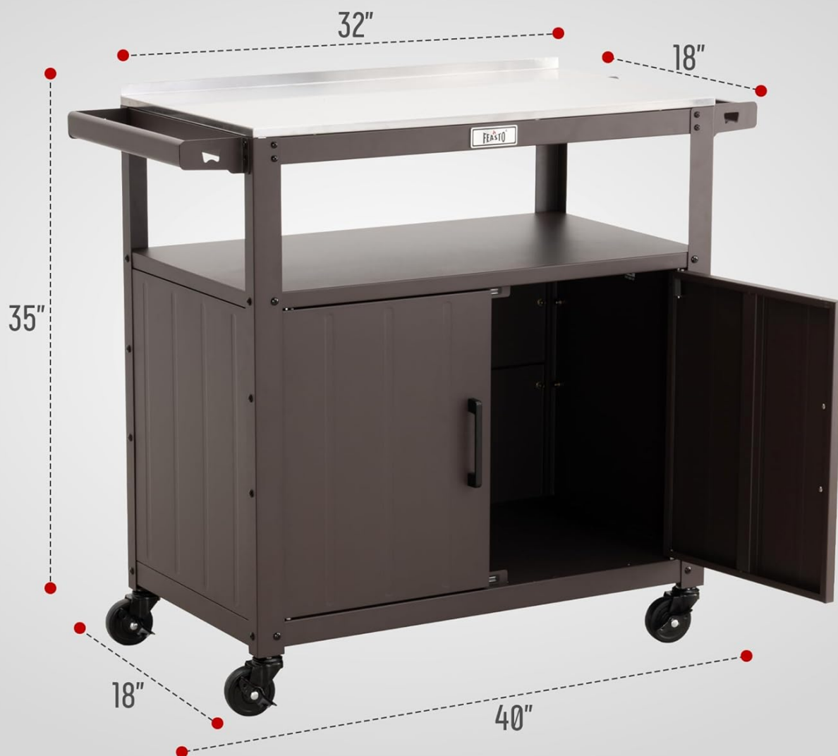
Figure 3: Product Dimensions. This diagram provides key measurements of the grill cart, including its 40" width, 18" depth, and 34.6" height, with a 32" x 18" tabletop.