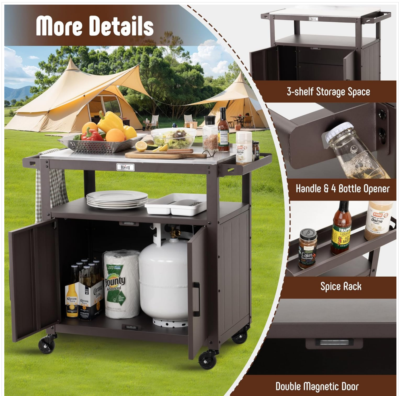
Figure 6: Detailed Features. This composite image showcases the 3-shelf storage space, the handle with integrated bottle openers, the spice rack, and the double magnetic doors for secure storage.