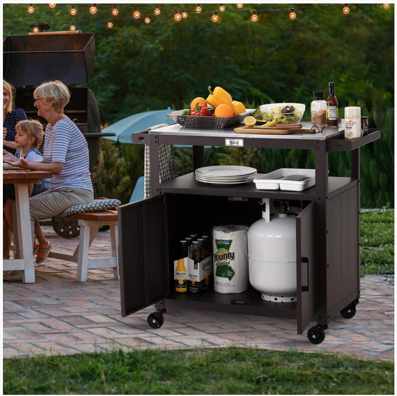
Figure 7: Outdoor Gathering Use. This image shows the grill cart being used as a food preparation and serving station during an outdoor gathering, demonstrating its practical application.

island for food prep, or a convenient dining station for outdoor gatherings.