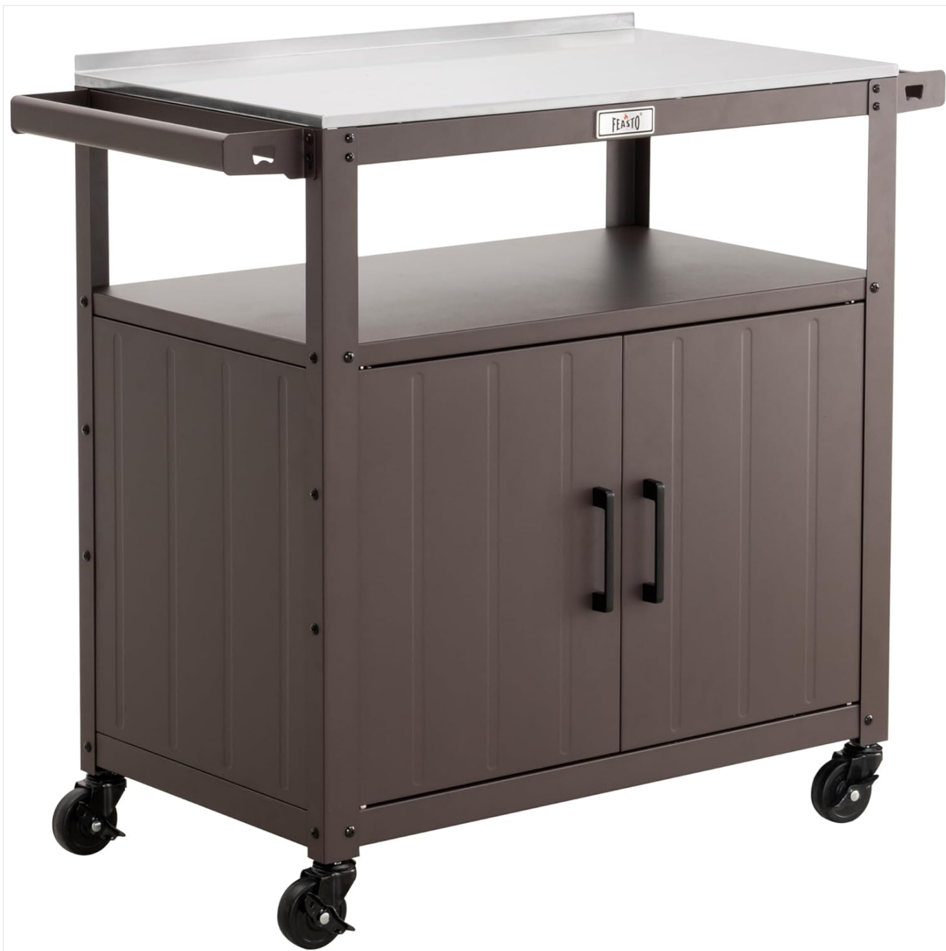
Figure 1: Feasto Outdoor Grill Cart (Brown color variant)

This image shows the complete Feasto Outdoor Grill Cart, highlighting its stainless steel tabletop, storage cabinet, and wheels. The cart is brown with black handles and wheels.