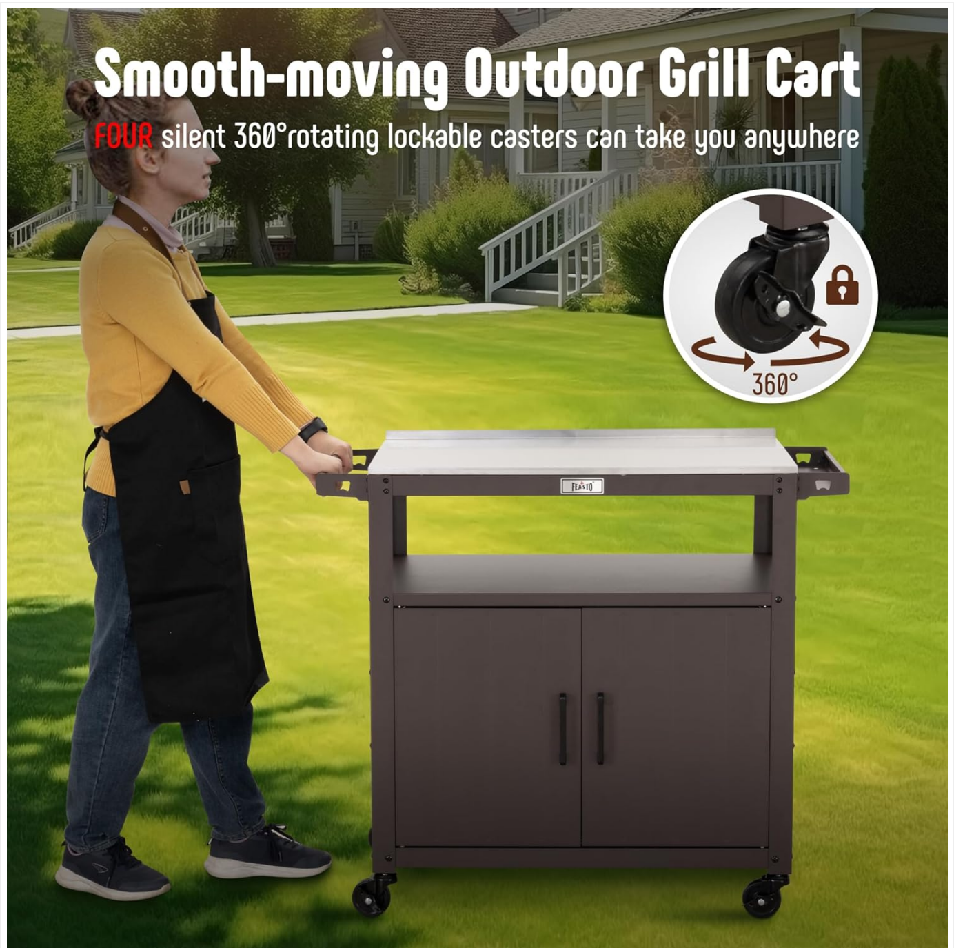
Figure 5: Smooth Movement and Lockable Casters. This image shows a person easily maneuvering the grill cart, emphasizing the 360° rotating and lockable casters for effortless and stable movement.