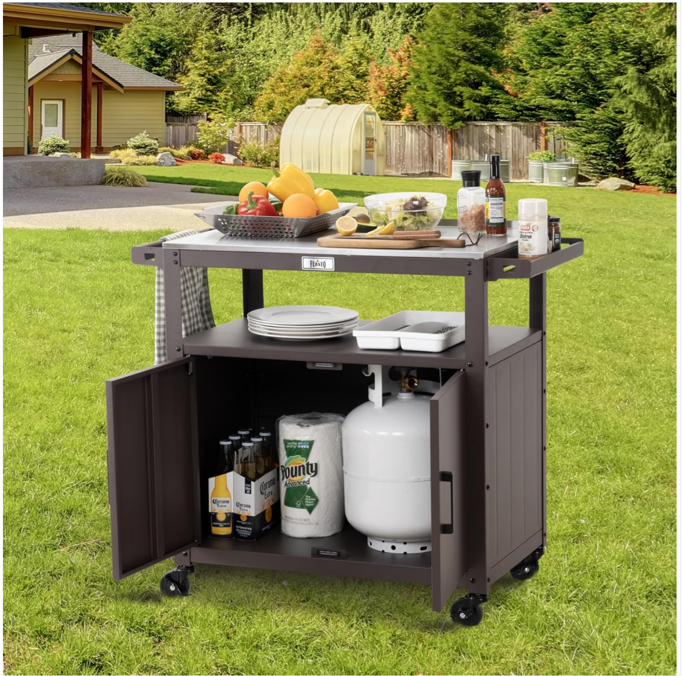
Figure 2: Grill Cart with Storage Cabinet Open. This image illustrates the spacious interior of the storage cabinet, capable of holding items like a propane tank, paper towels, and bottled beverages.