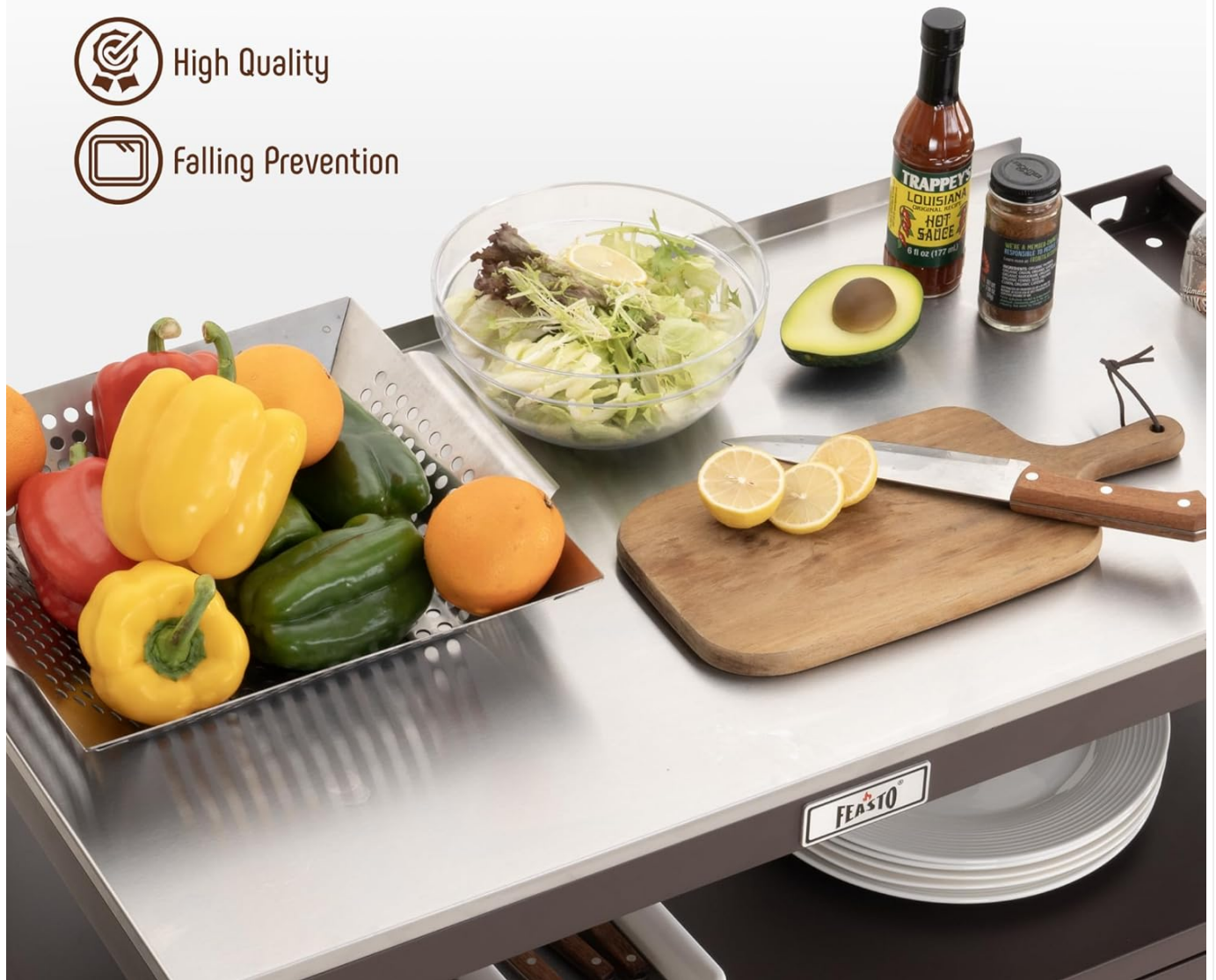
Figure 4: Stainless Steel Tabletop. This close-up image highlights the rust-resistant and stain-resistant stainless steel surface, ideal for food preparation, and shows the raised edge for falling prevention.