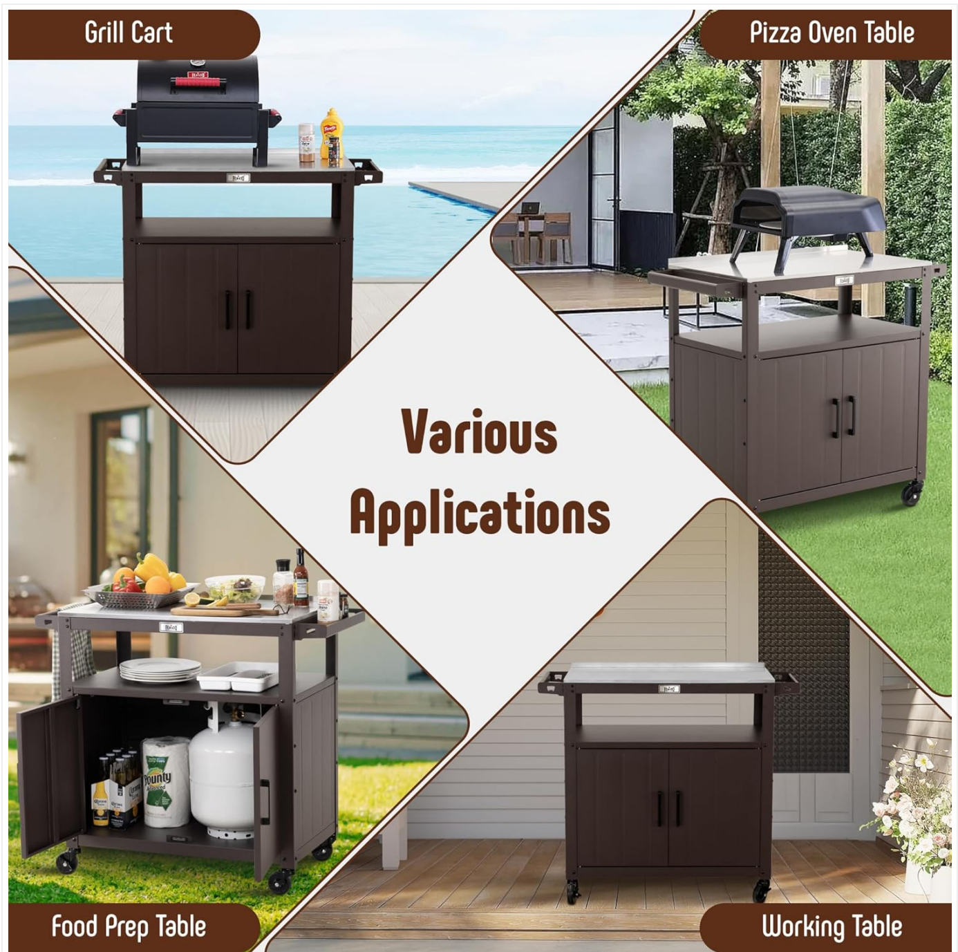
Figure 8: Multiple Uses. This collage illustrates the grill cart's versatility, showing it configured as a grill cart, a pizza oven table, a food prep table, and a general working table.