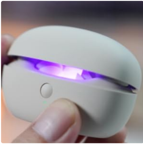
Image: The UV Light Charging Case with a purple glow indicating the UV cleaning process.