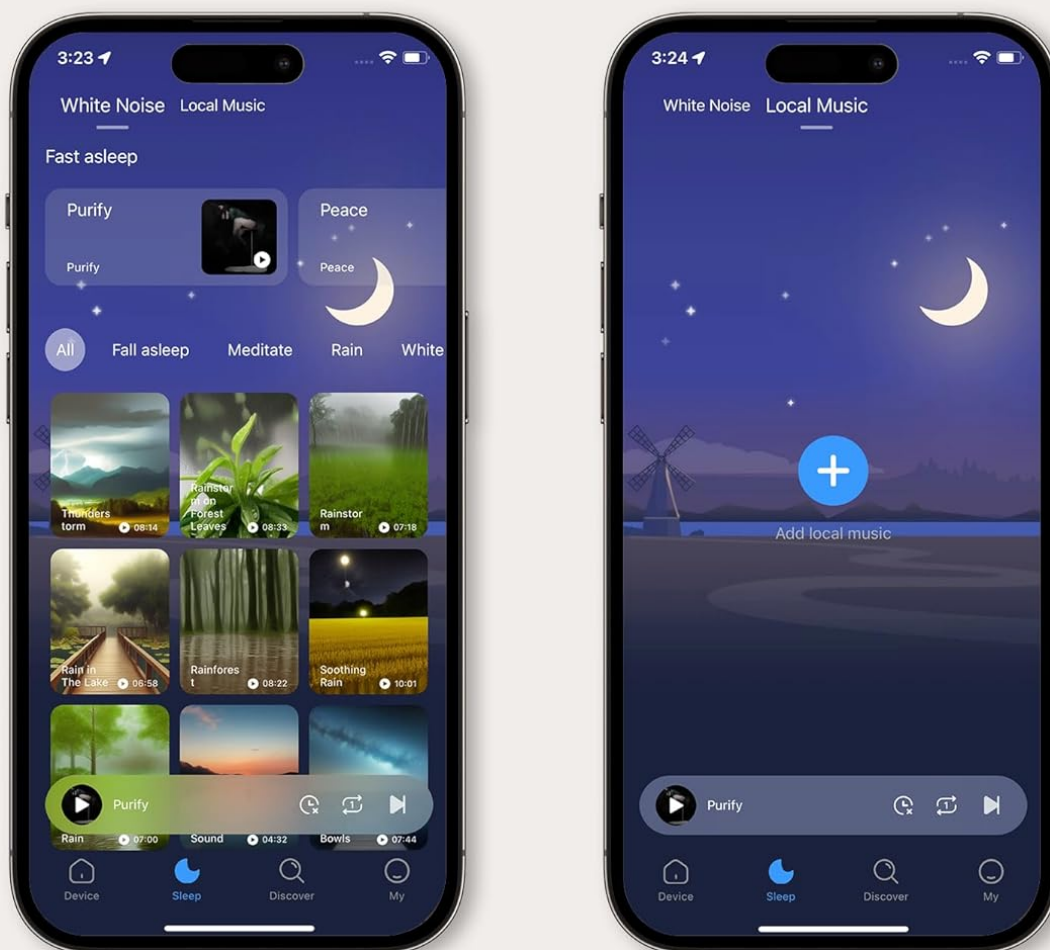
Image: wedoking Sleep Earbuds next to a smartphone displaying the control app interface.

Designed to soothe your mind and create a personalized sleep soundtrack