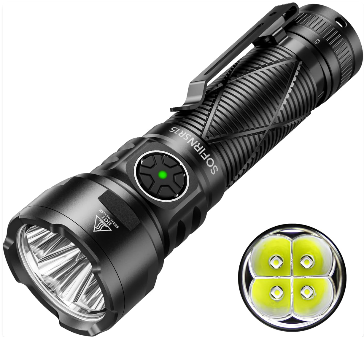
Figure 2: Sofirn SR15 Flashlight showing the main body and side switch.