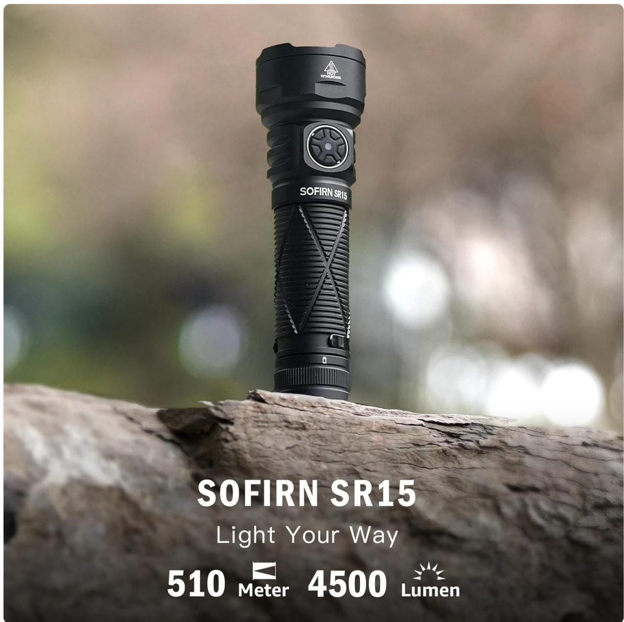
Figure 1: Sofirn SR15 Flashlight highlighting its 4500 lumen output and 510 meter beam distance.