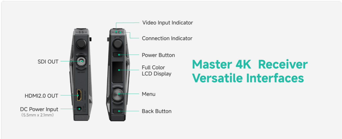
Image 4.1: Master 4K Receiver interfaces, including Power Button, Menu/OK Knob, Return Button, and Full Color LCD Display.

Use the Menu/OK knob (rotary dial) to navigate through the menu pages and modify settings. Press the Return button to go back to the previous page or cancel a selection.