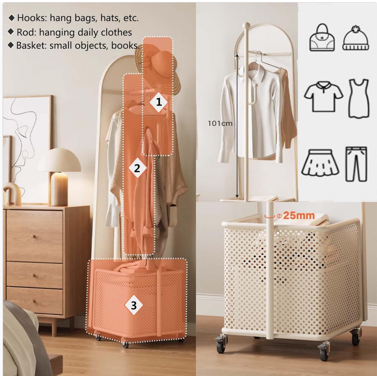
Image 4.1: Close-up view of the integrated storage features, including hooks for bags/hats, a rod for hanging clothes, and a basket for small items or books. Dimensions are indicated.