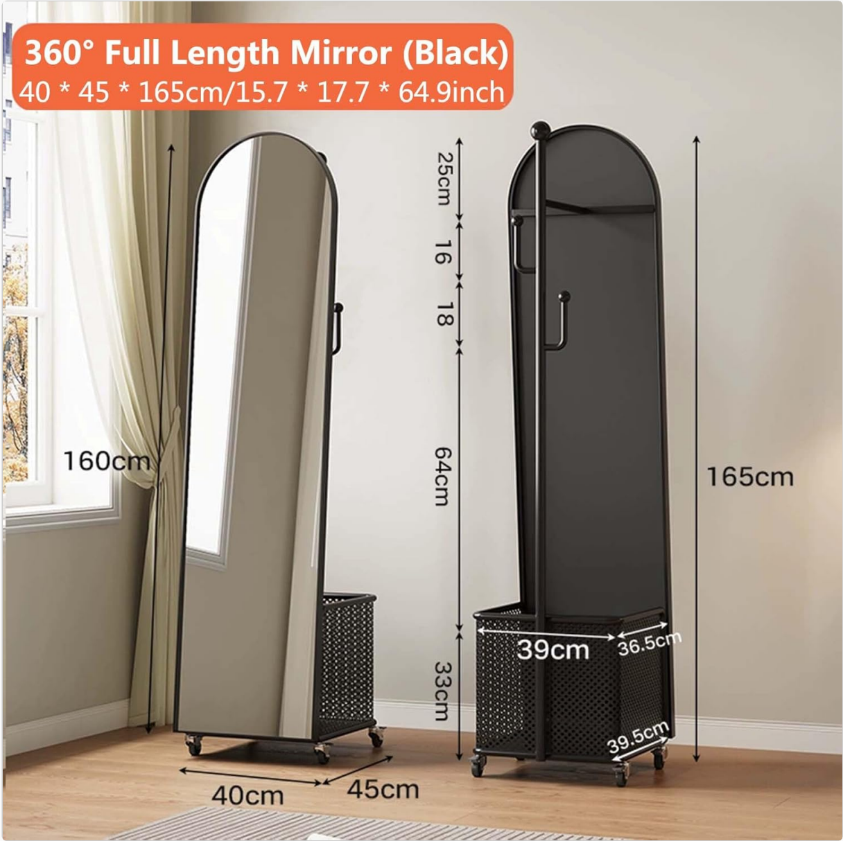
Image 8.1: Dimensional diagram of the black 3-in-1 Full Length Mirror, showing overall height, width, and depth, as well as specific measurements for the coat rack and basket.