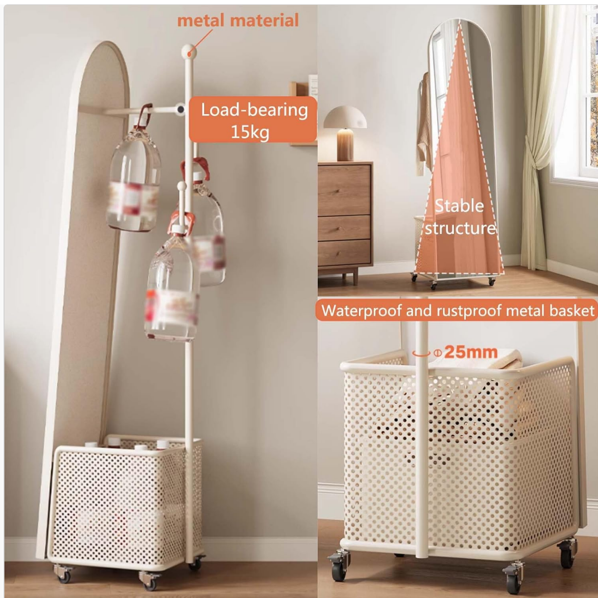
Image 6.1: Details on the robust metal construction, highlighting the 15kg load-bearing capacity of the coat rack and the waterproof, rust-proof nature of the metal basket.