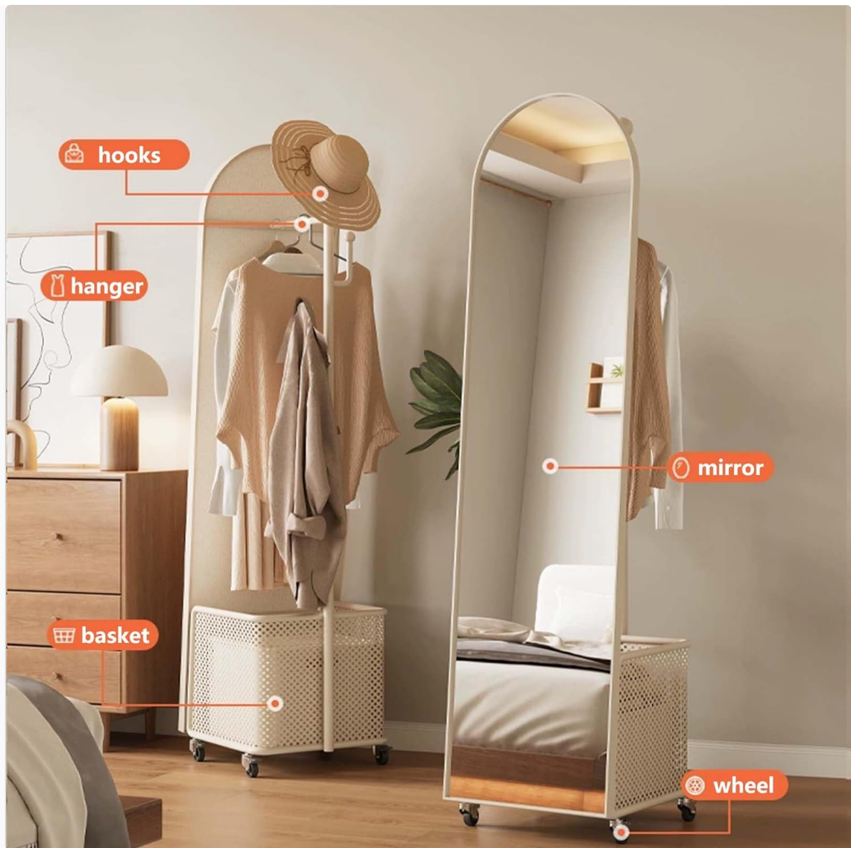
Image 2.1: Exploded view of the mirror highlighting its main components: hooks, hanger rod, storage basket, mirror panel, and wheels.