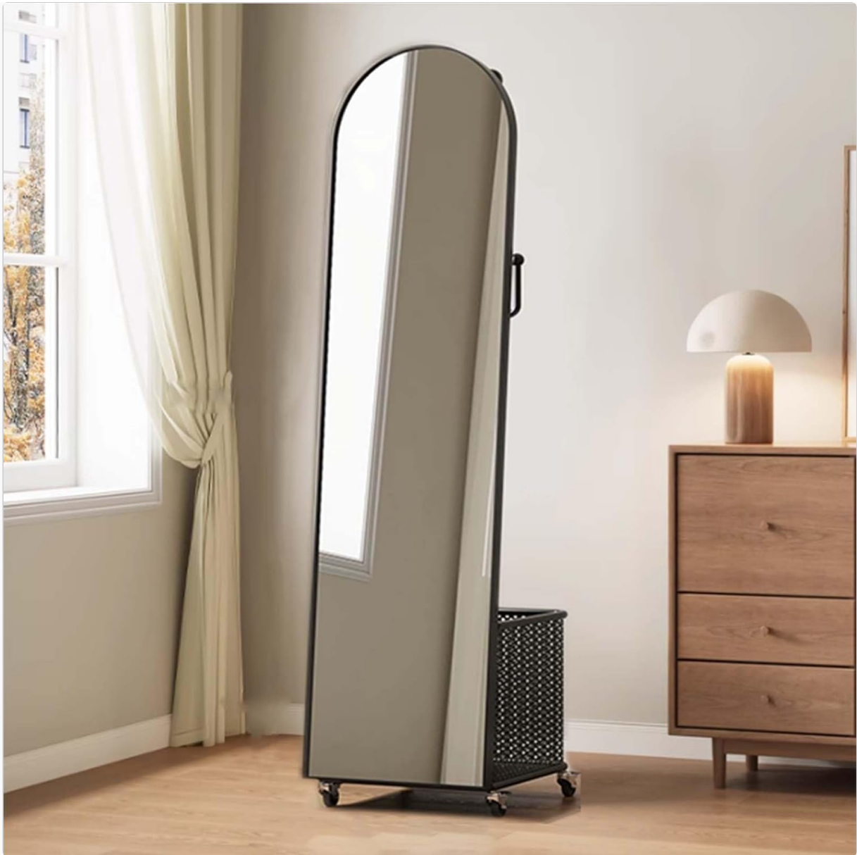
Image 1.1: The 3-in-1 Full Length Mirror in a bedroom setting, showcasing its design and functionality.