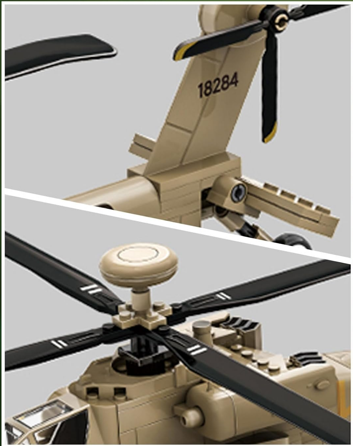
Image 3: Close-up view of the tail rotor and main rotor assembly of the AH-64 Helicopter model, showing the rotating parts.