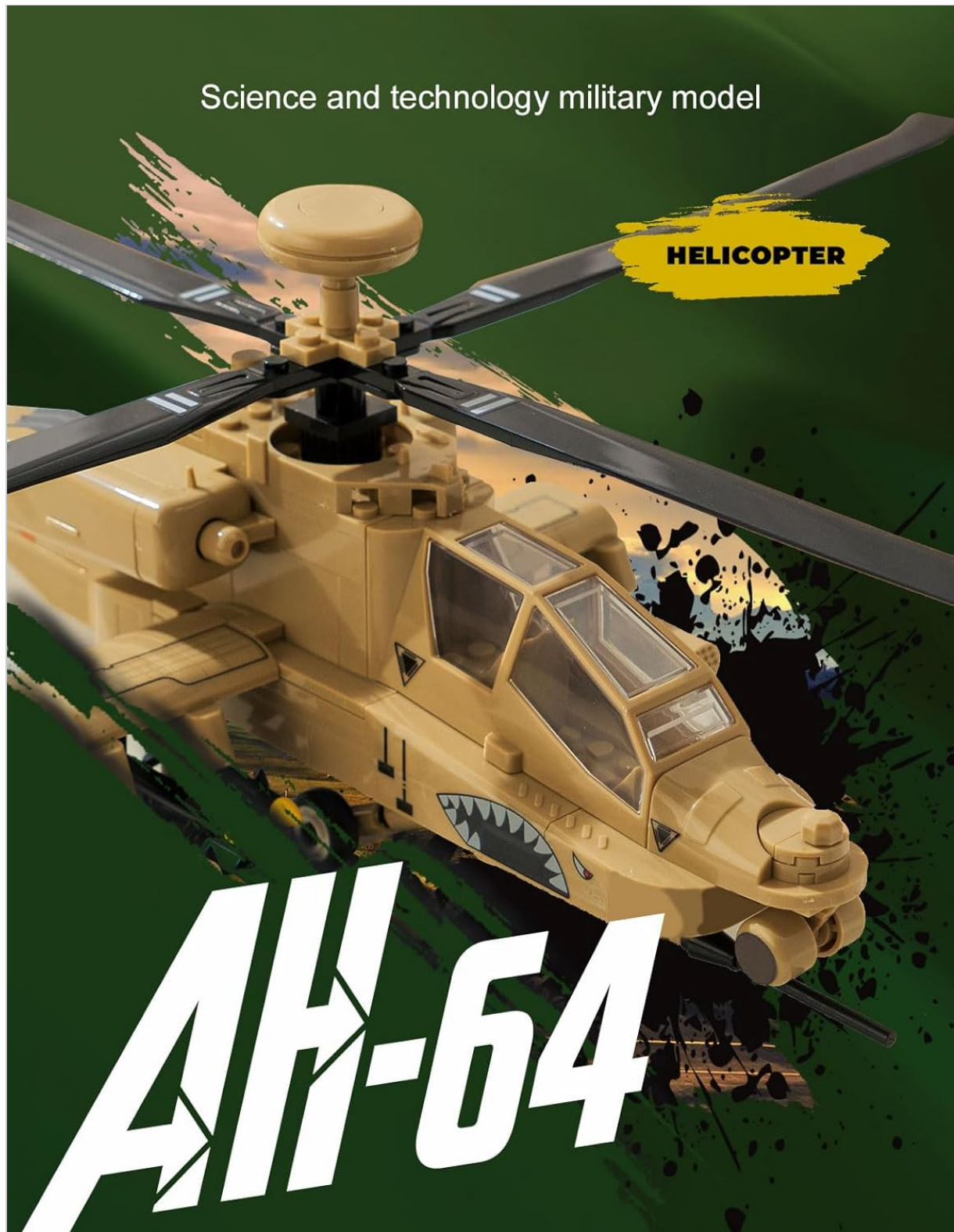
Image 1: Fully assembled SEMKY AH-64 Helicopter building block model from a side view.