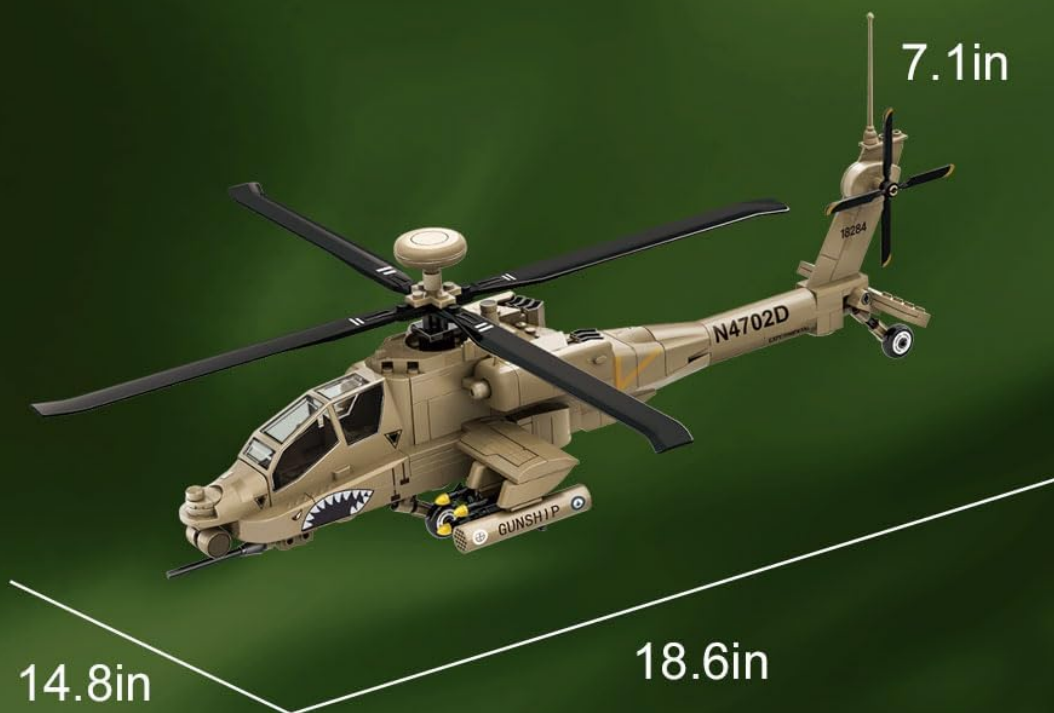
Image 4: Product dimensions of the assembled AH-64 Helicopter model.