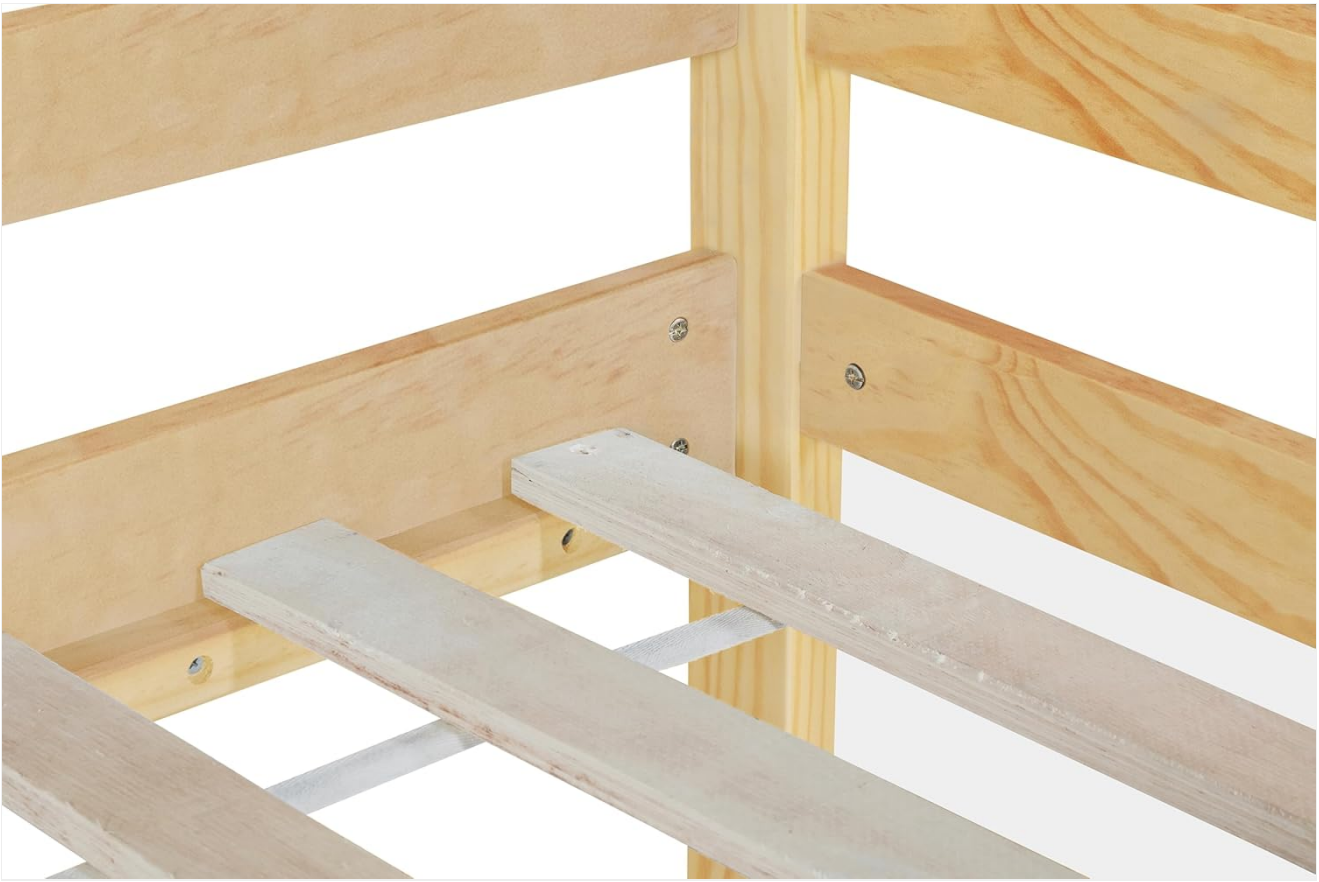
Image 4.2: Close-up view of the bed slats and their connection points to the frame, illustrating the support structure.