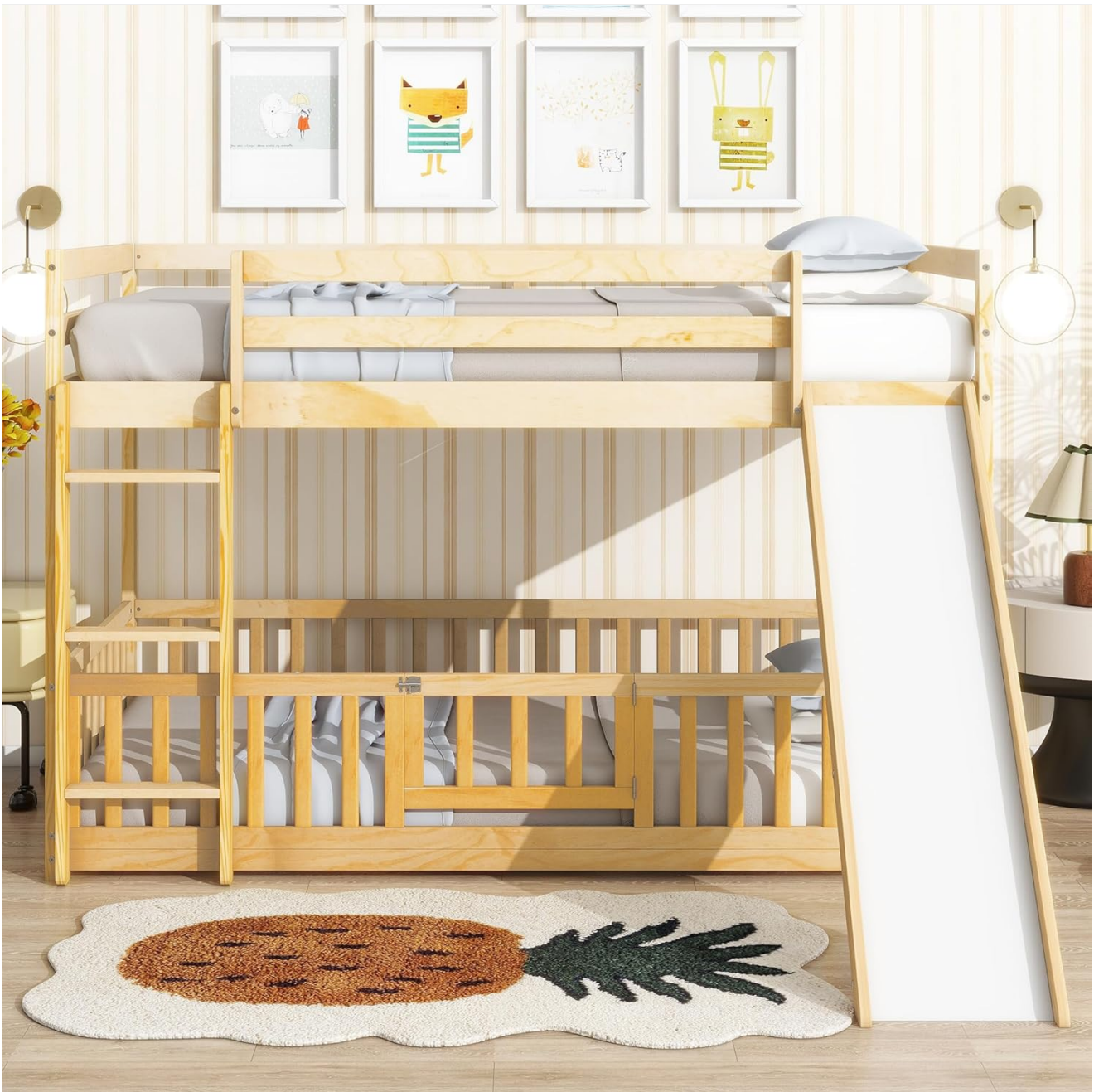
Image 5.1: The UOCFYK bunk bed integrated into a child's bedroom, showing the ladder and slide in use.