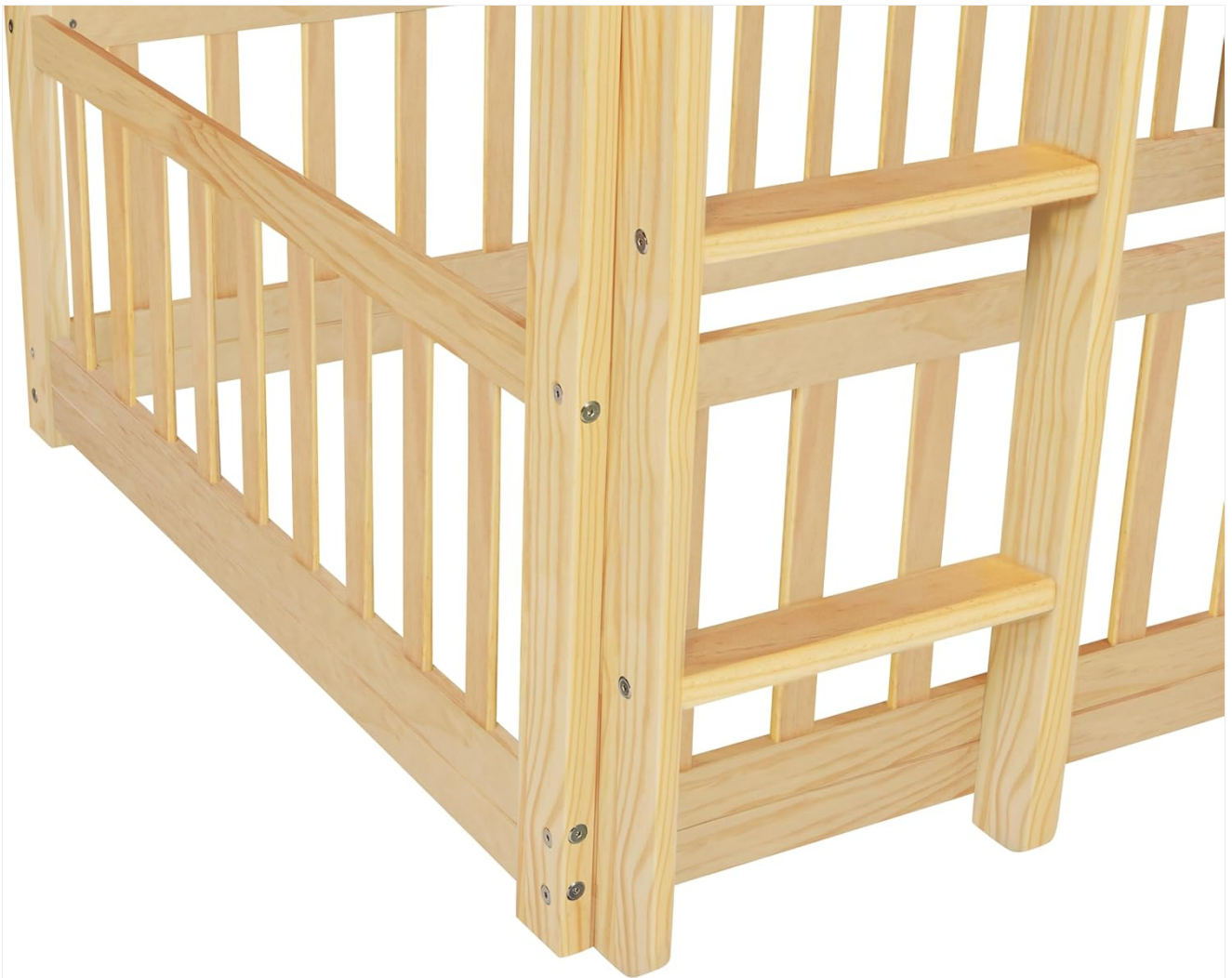
Image 6.1: Detail of a corner joint, highlighting the importance of secure hardware for structural integrity.