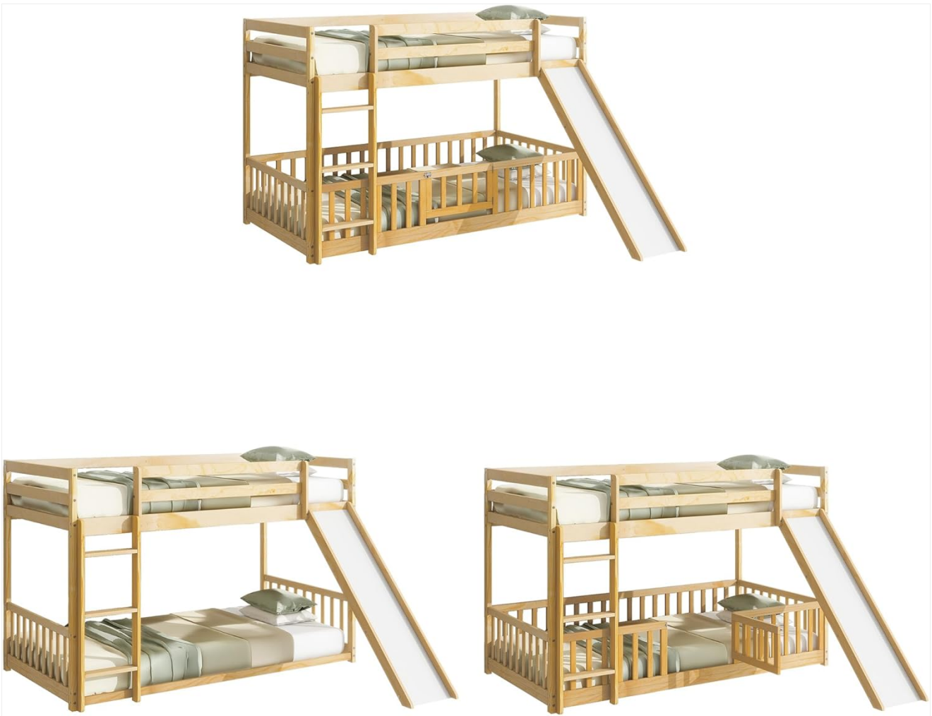
Image 4.1: The UOCFYK bunk bed can be configured in multiple ways, demonstrating its versatility during assembly.