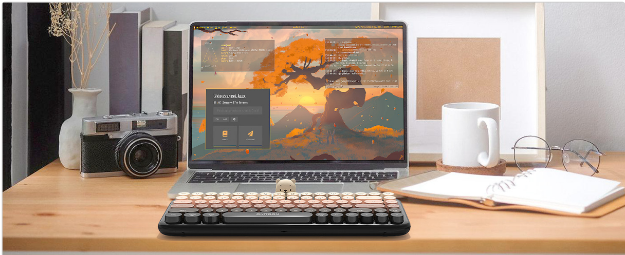
Figure 4.4: Magnetic bear doll attached to the keyboard.