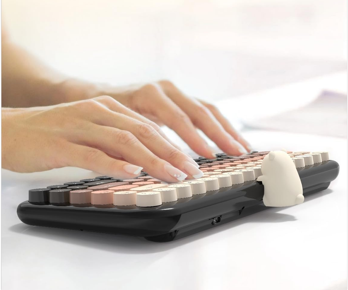
Figure 5.1: Ergonomic 9° tilt angle.

The rounded keycaps fit to fingertips, comfort in hand, good keystroke rebound.