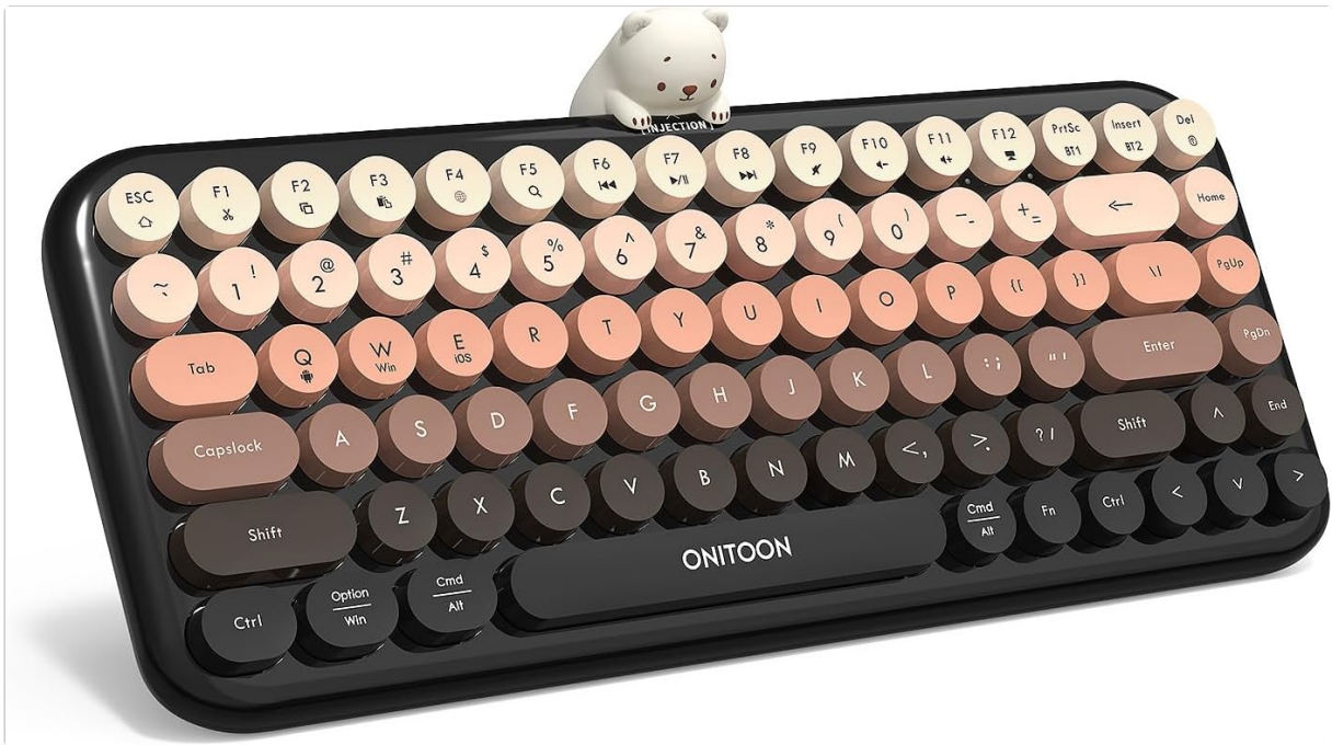
Figure 4.3: ONITOON G70 keyboard with magnetic bear doll.