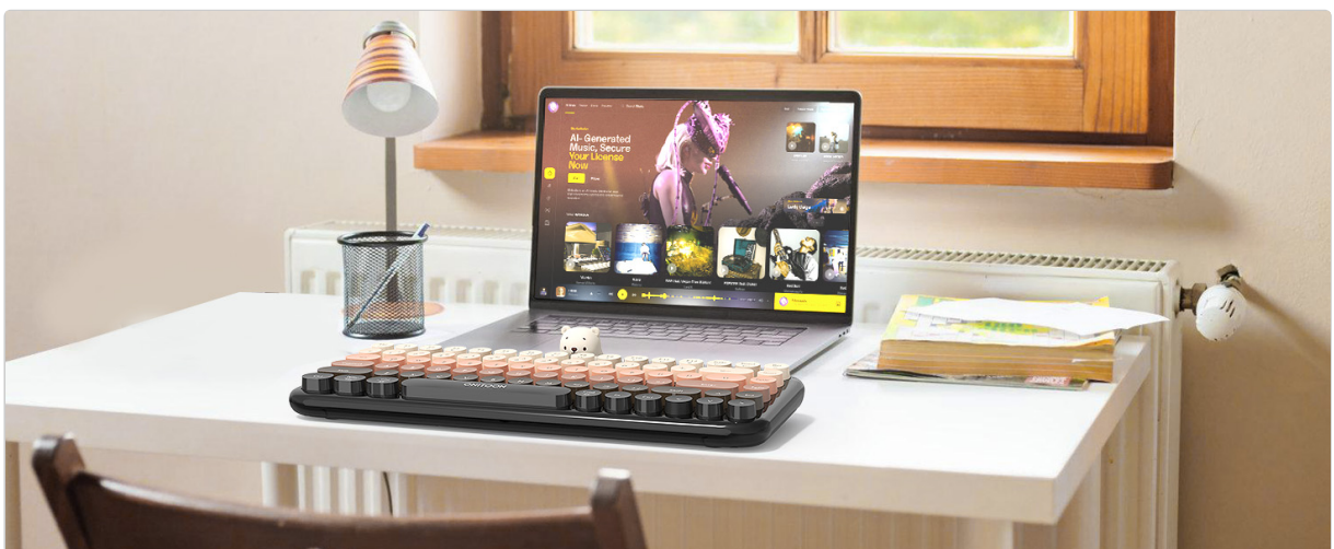
Figure 5.2: Comfortable typing experience with ergonomic design.