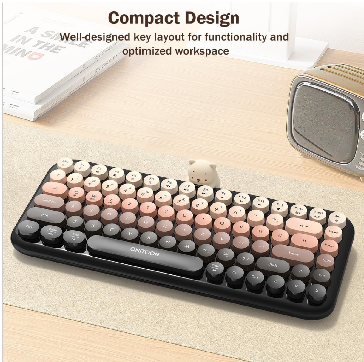
Figure 4.1: Typing on the G70 keyboard with rounded keycaps.

The G70 keyboard features 84 retro round keycaps designed for comfortable typing. The keys offer a slight clicking sound and responsive rebound, providing a satisfying tactile experience.