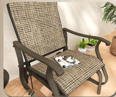
Slightly Inclined Backrest & Curved Seat

Image: Detail showing the powder-coated steel frame, emphasizing the sturdy construction designed for reliable daily use and weather resistance.