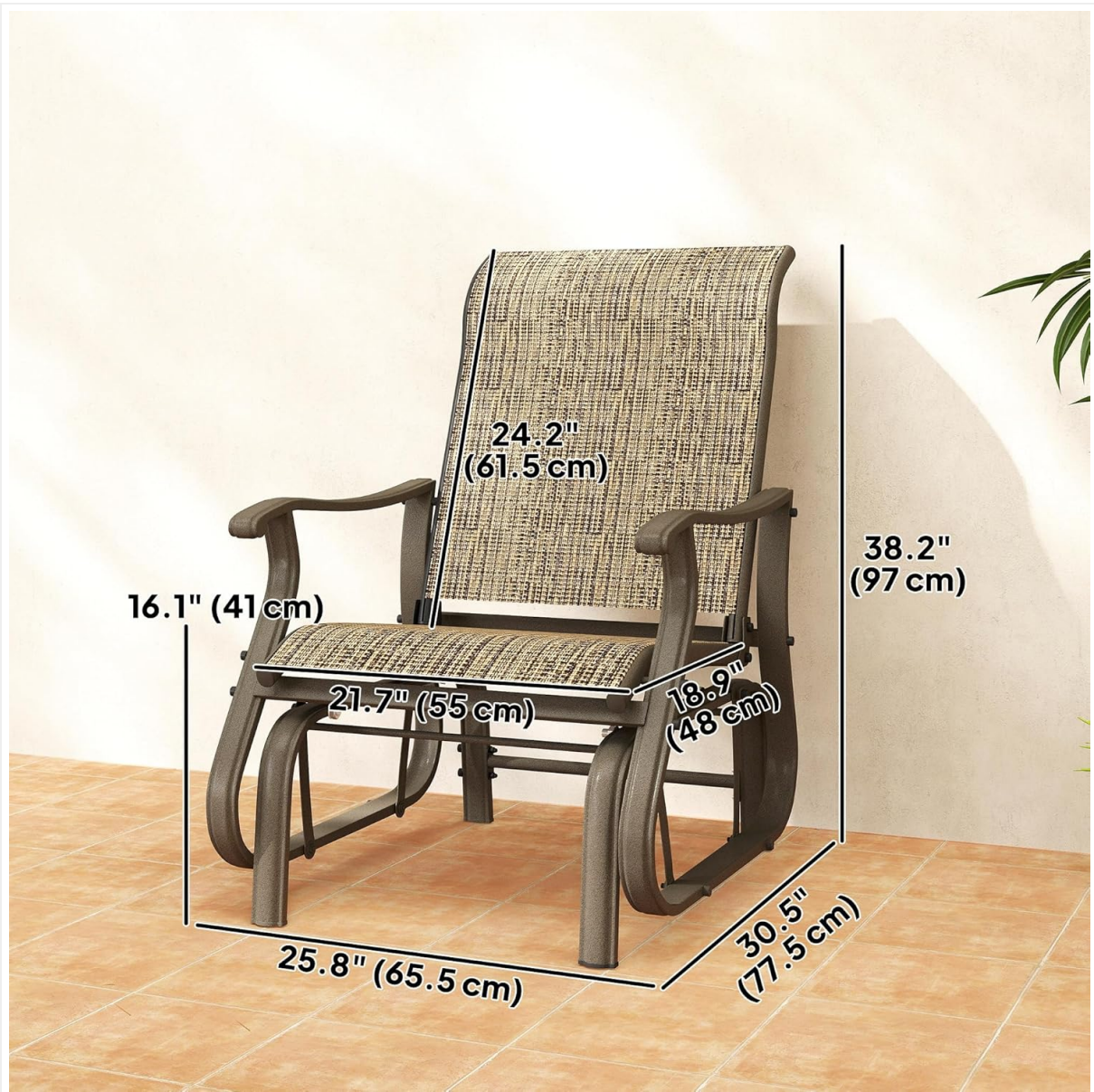
Image: An illustration of the chair's ergonomic design, featuring supportive armrests and a slightly inclined backrest and curved seat for optimal comfort.