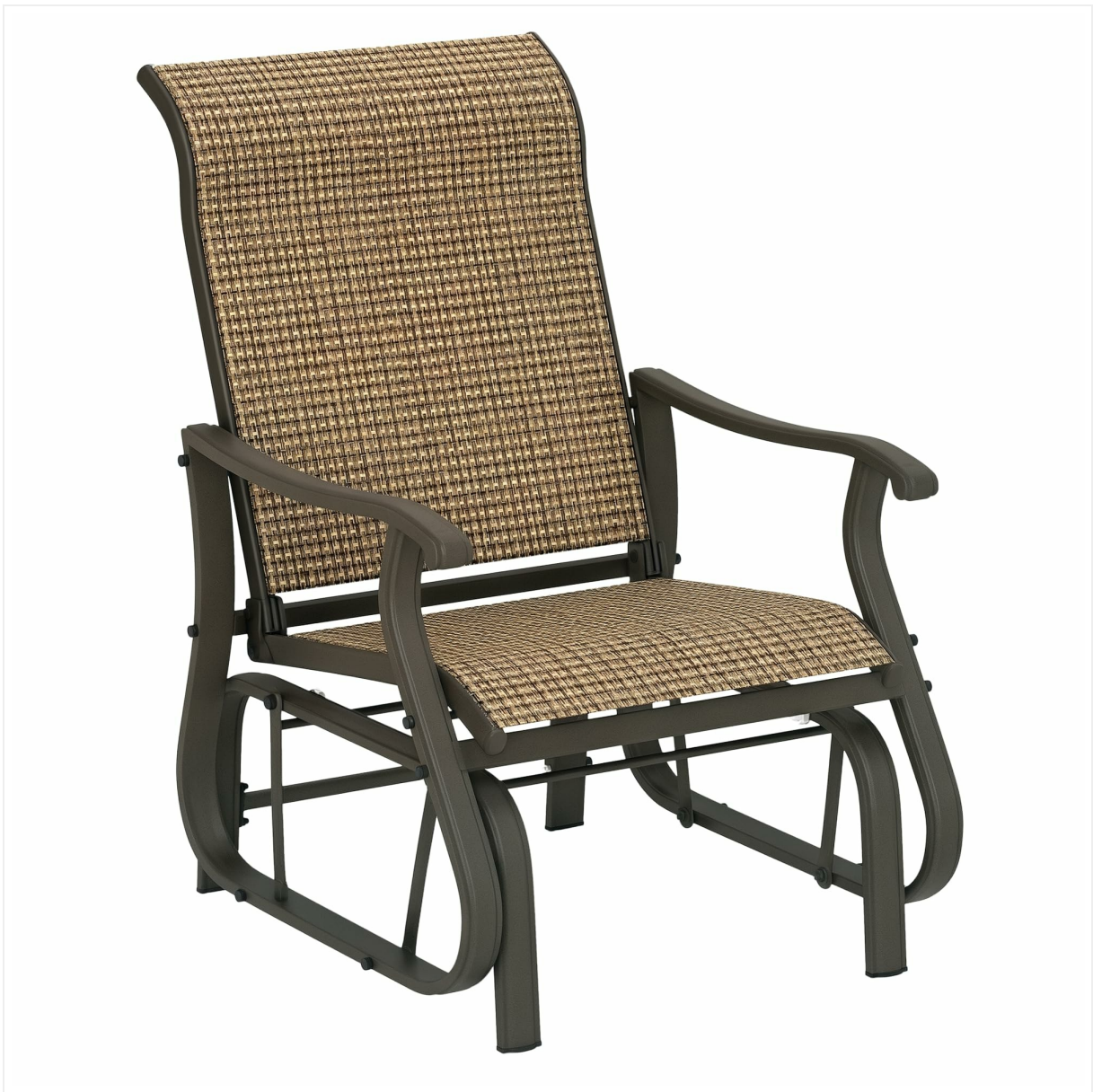
Image: The Outsunny Outdoor Glider Chair in Light Mixed Brown, showcasing its design and color.