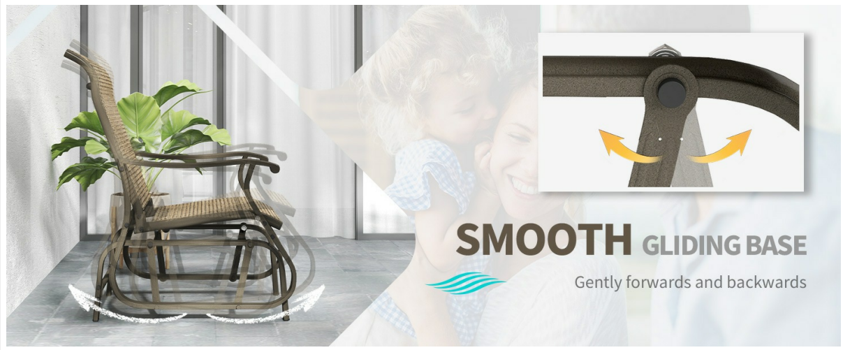
Image: The Outsunny Glider Chair featuring its Texteline fabric, designed for breathability and quick drying, ideal for outdoor use.