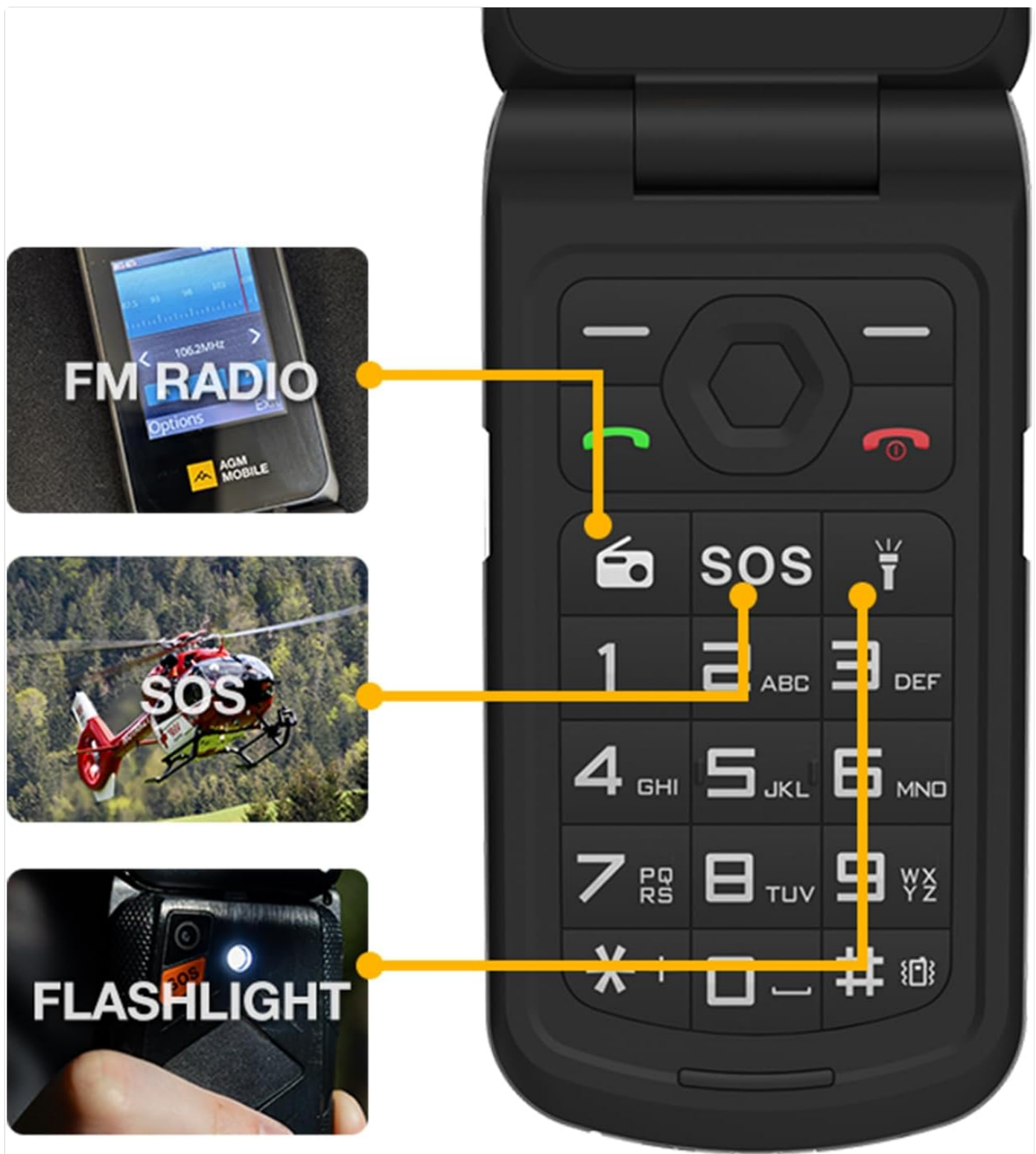
Figure 6: Quick access features: FM Radio, SOS, and Flashlight.