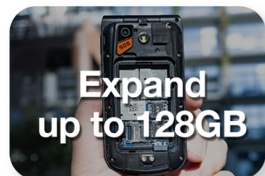
Figure 3: Internal view showing dual SIM card slots and expandable storage.