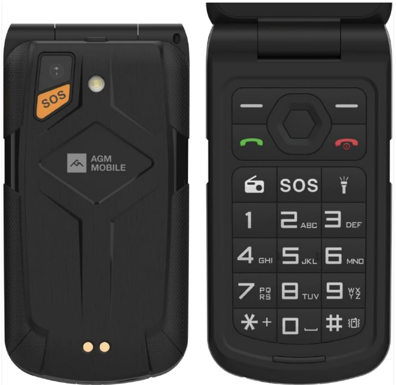
Figure 1: Front and back view of the AGM M10 Rugged Flip Phone.