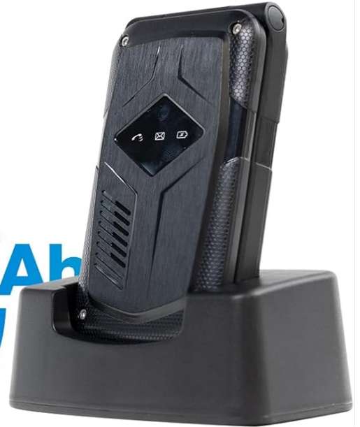
Figure 4: The AGM M10 charging, illustrating its long-lasting battery.