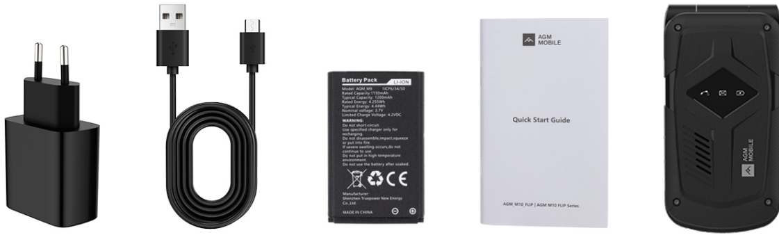
Figure 2: Contents included in the AGM M10 retail packaging.