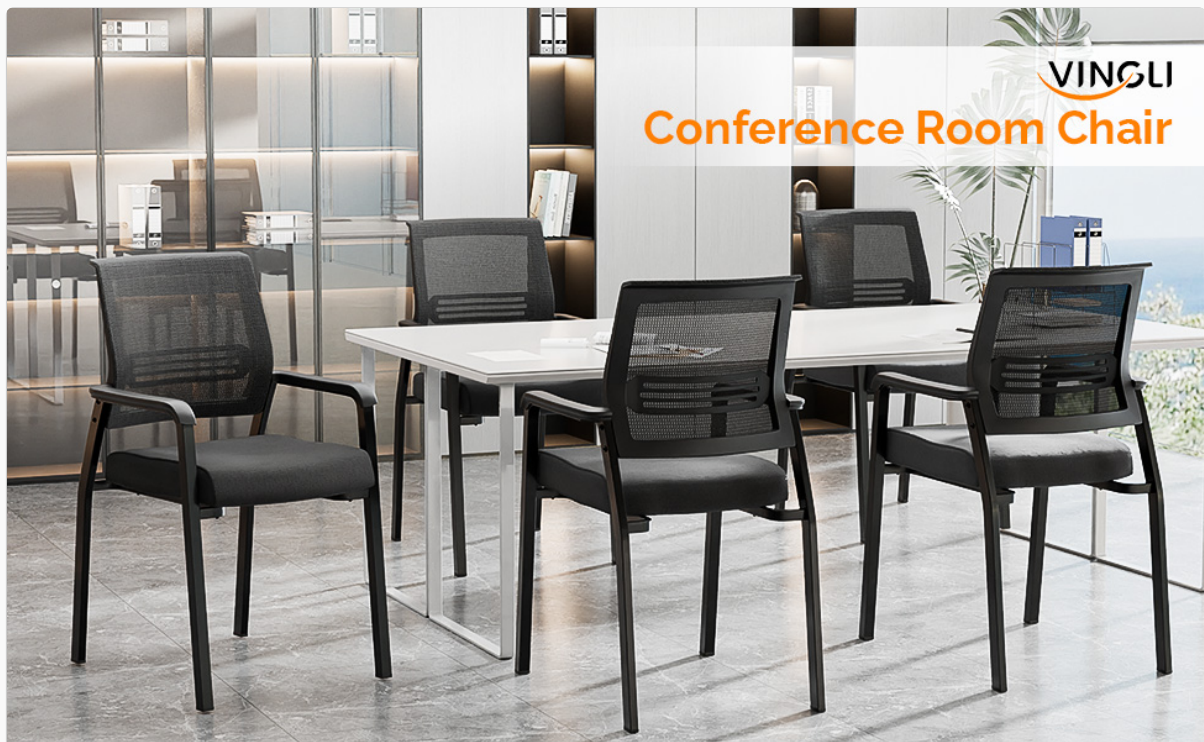
Figure 1: VINGLI Oversize Waiting Room Chair in a conference room environment.

Thank you for choosing the VINGLI Oversize 350 lbs Waiting Room Chair. This manual provides essential information for the safe assembly, operation, and maintenance of your new chair. Please read these instructions carefully before use and retain them for future reference.