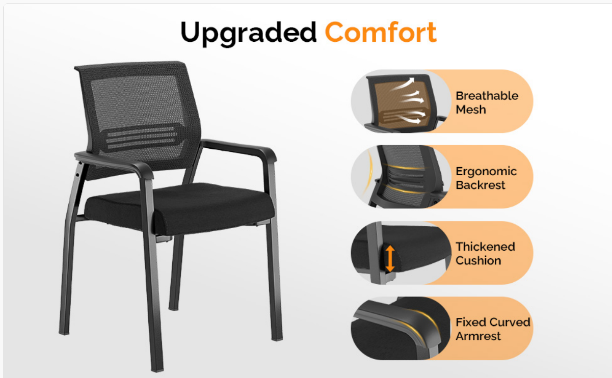
Figure 2: Key comfort features of the VINGLI chair.

The VINGLI Waiting Room Chair is designed for straightforward use. Simply sit on the chair, ensuring your weight is evenly distributed. The ergonomic design with a curved backrest and contoured armrests provides comfort and support for short to medium-duration seating.