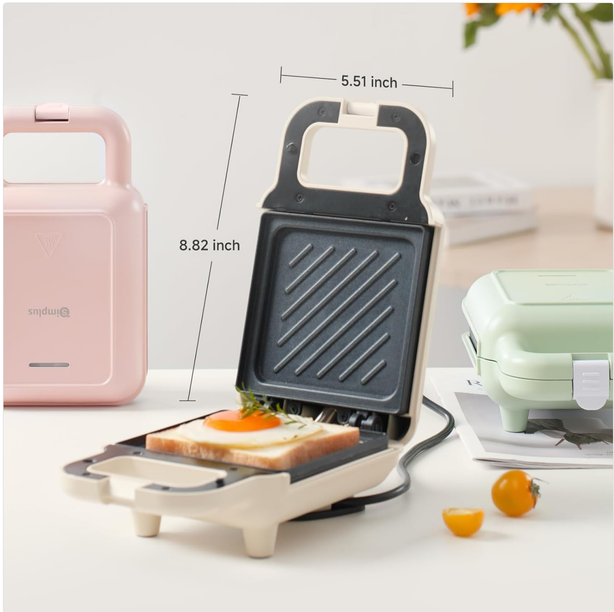
Image: The SIMPLUS Electric Sandwich Maker, open to show the cooking plates, with dimensions indicating a width of 5.51 inches and a height of 8.82 inches when open. A fried egg on bread is visible on the lower plate. Another pink sandwich maker and a green one are in the background.