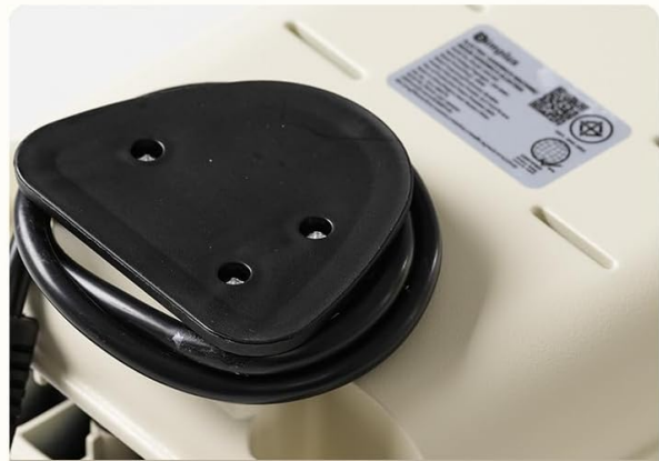
Cord storage design