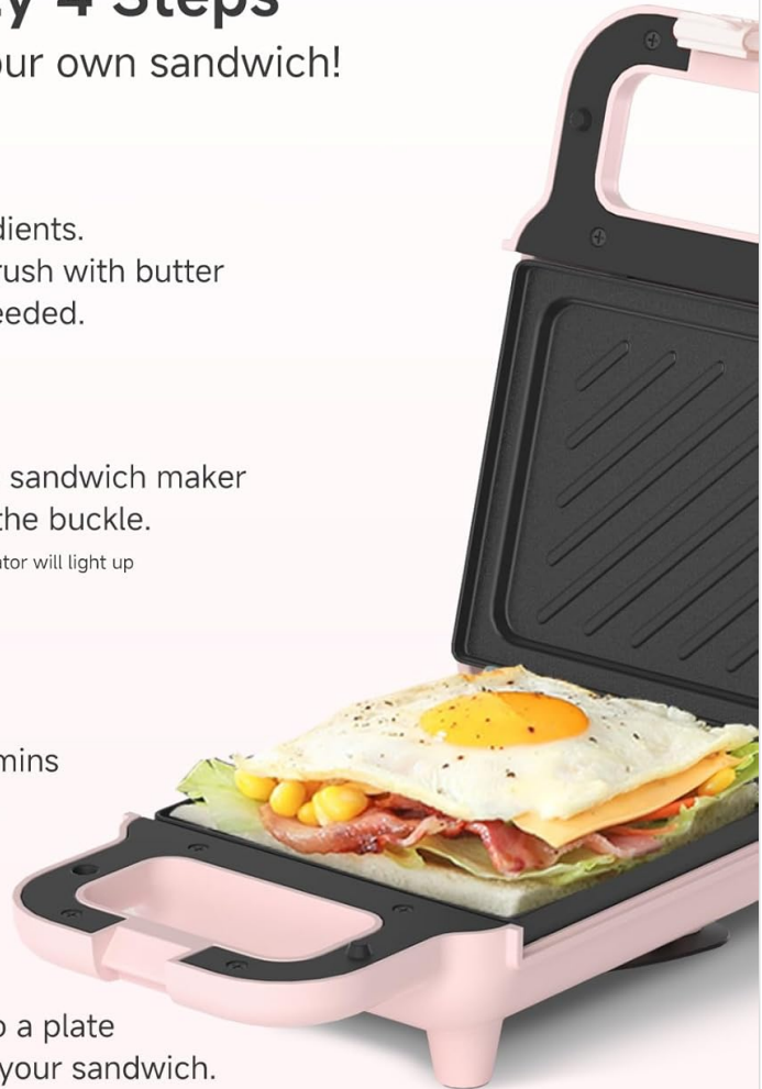
Image: A four-step visual guide showing how to use the sandwich maker: 1. Add ingredients (egg on bread). 2. Plug in and close the buckle. 3. Wait for 5 minutes. 4. Transfer to a plate and enjoy.

Transfer to a plate and enjoy your sandwich.