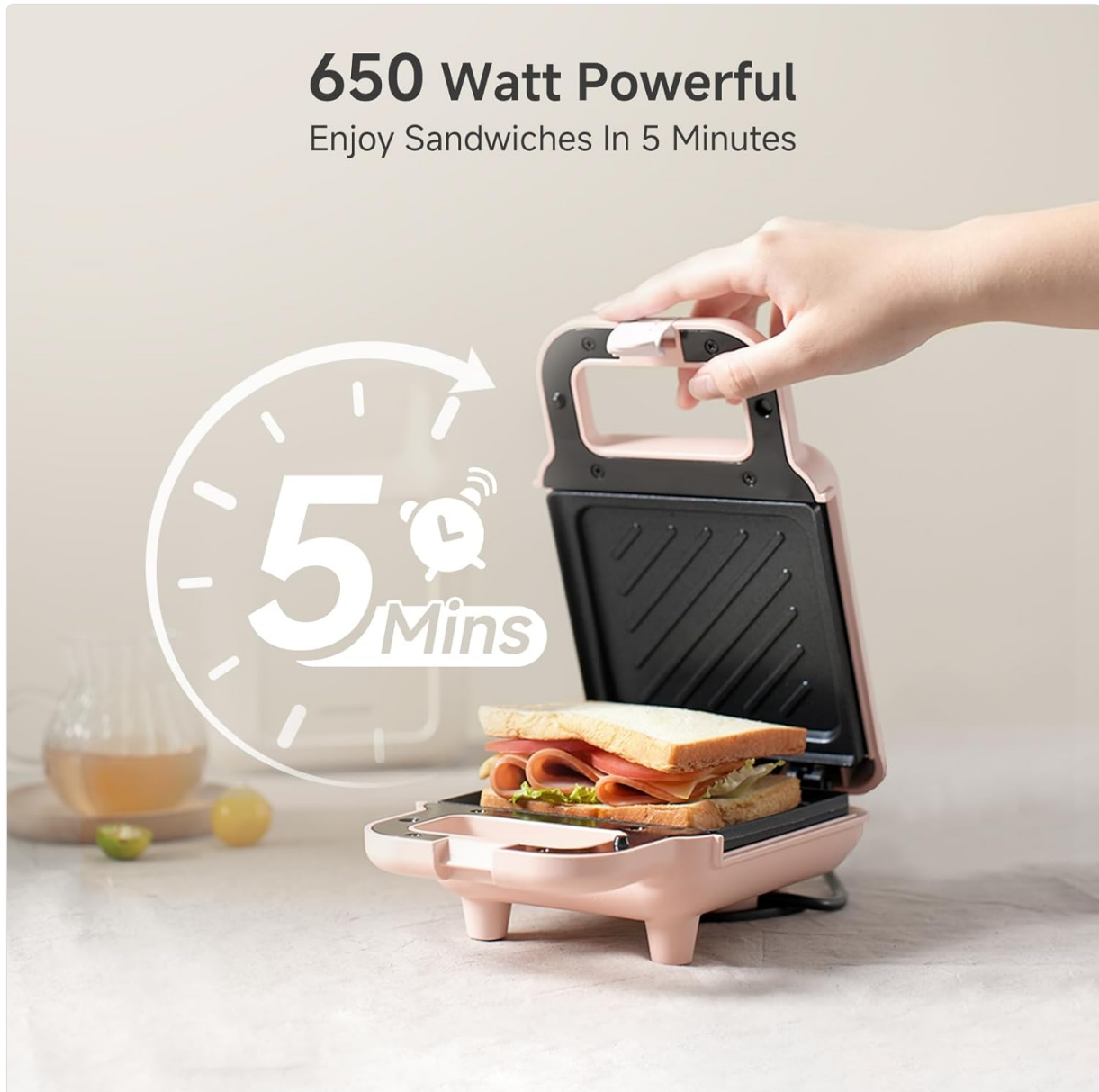
Image: A pink SIMPLUS Electric Sandwich Maker with a sandwich inside, illustrating that it cooks in approximately 5 minutes with a '5 Mins' timer graphic.