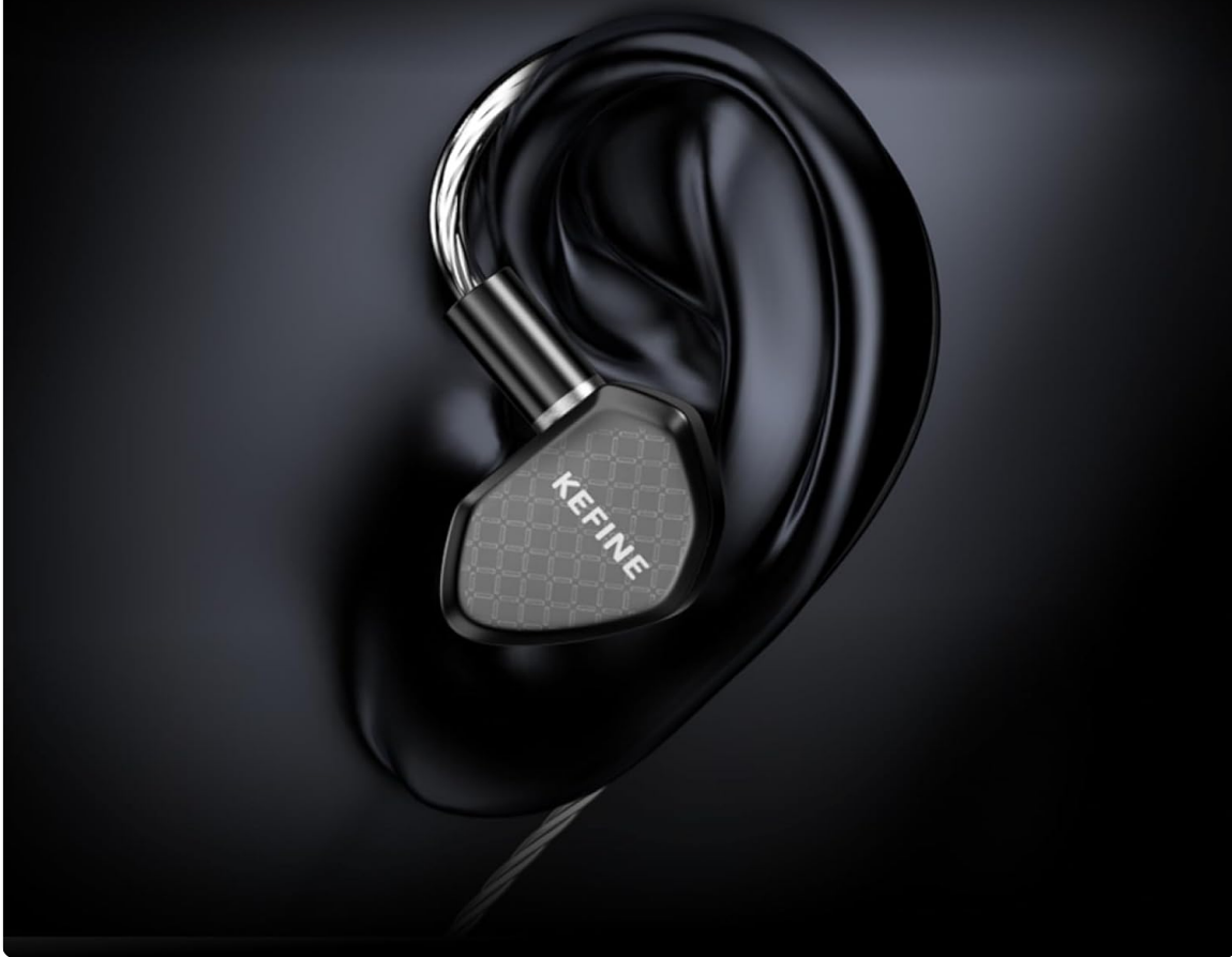
Image: A Linsoul Kefine Klean earphone properly seated in a human ear, highlighting its ergonomic design for comfortable and secure wearing.

The carefully sculpted earpieces fit snugly, following the natural bends of your ear canals.