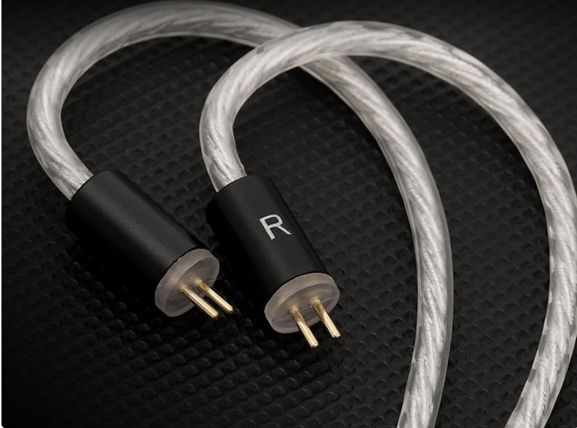
Image: The high-quality 0.78mm 2-pin detachable silver-plated copper cable, ready for connection to the earphones.

Pure Signal with a Clean and Transparent Sound