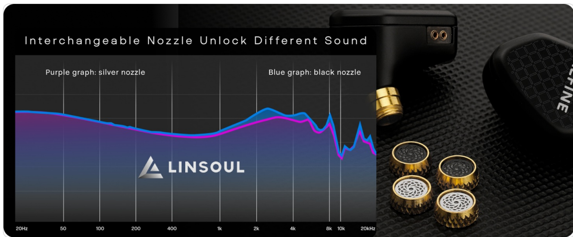
Image: The Linsoul Kefine Klean earphones showcasing the interchangeable silver and black nozzles, along with a graph illustrating their distinct frequency response curves.