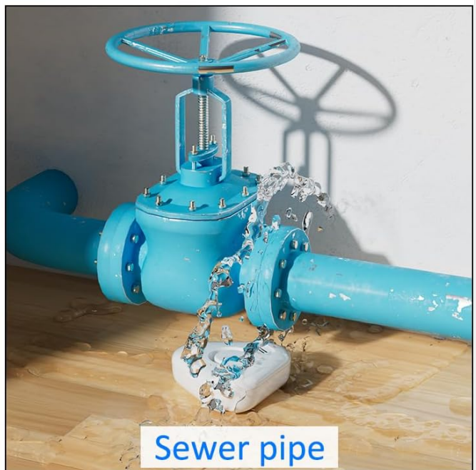
Figure 5.1: Recommended Placement Areas.