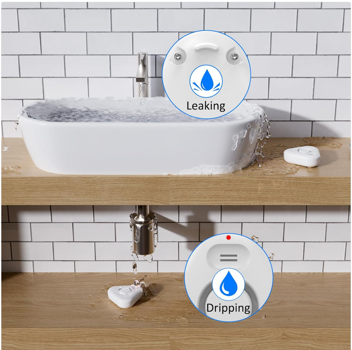
Figure 5.4: Dual detection for dripping and leaking.