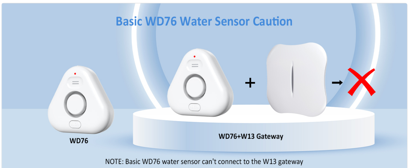
Figure 7.1: WD76 is not compatible with W13 Gateway.

Please note that the Stechro WD76 Water Leak Sensor (Model: WD76) does NOT have WiFi, Bluetooth, or APP functions. It does NOT support connecting to the Stechro W13 WiFi gateway and cannot work with other products (ASIN: B0DPM4PYHJ/B0DPMCSB5B) in this store that require gateway connectivity. This device operates as a standalone alarm system.