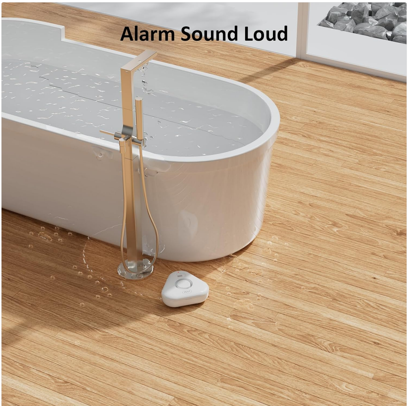
Figure 5.3: Loud alarm for immediate notification.