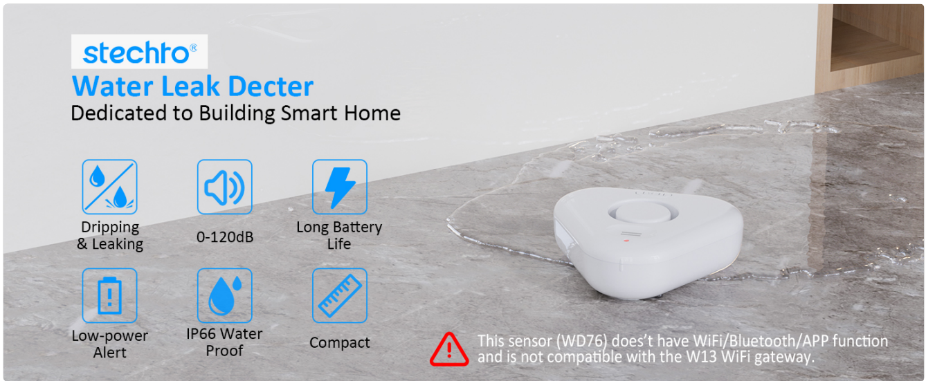
Figure 2.1: Key Features of the Stechro WD76 Water Leak Detector.