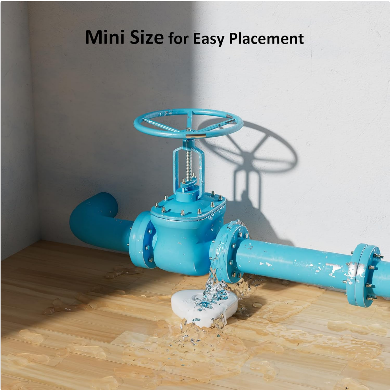
Figure 5.2: Compact size for discreet placement.