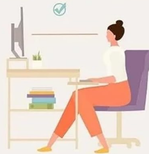
Eye Level = Improved Posture