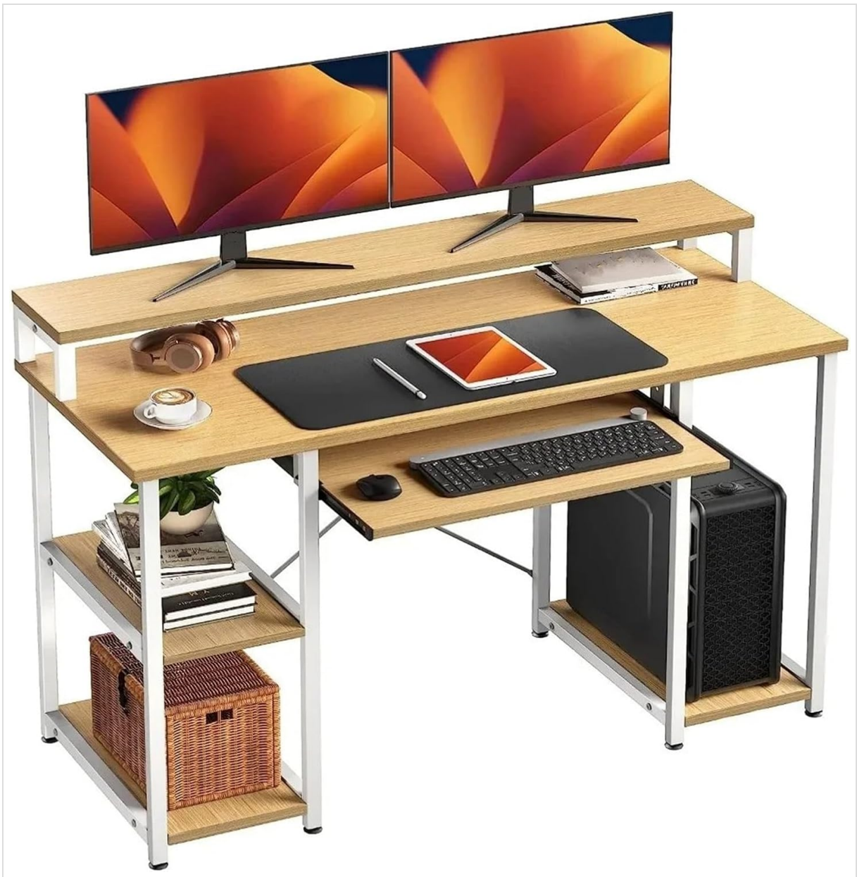
Image 2.1: The Generic Computer Desk with its monitor stand, keyboard tray, and side storage shelves, shown with two monitors and various office items.