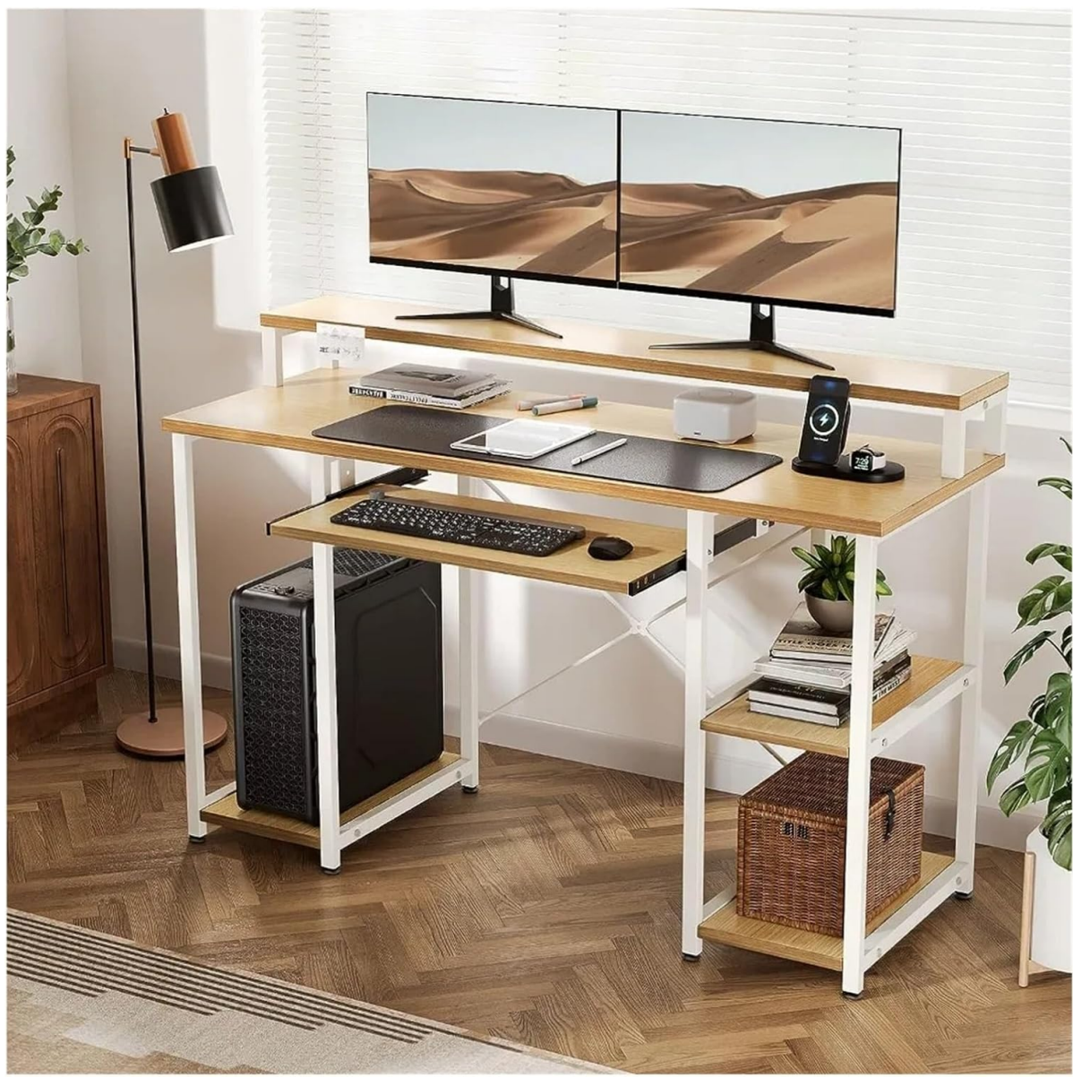
Image 2.2: The computer desk integrated into a modern home office environment, highlighting its functional design.