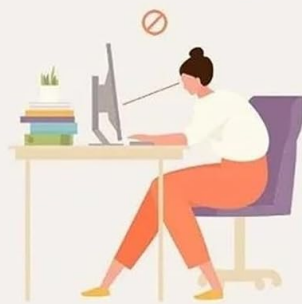
Low Screen = Cervical Discomfort