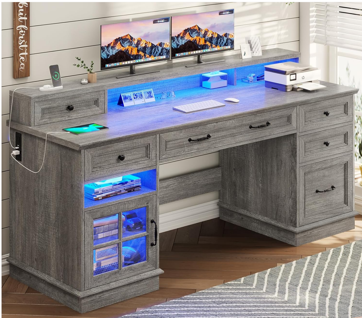
Figure 1: Overview of the BTHFST Farmhouse Executive Desk with its integrated features.