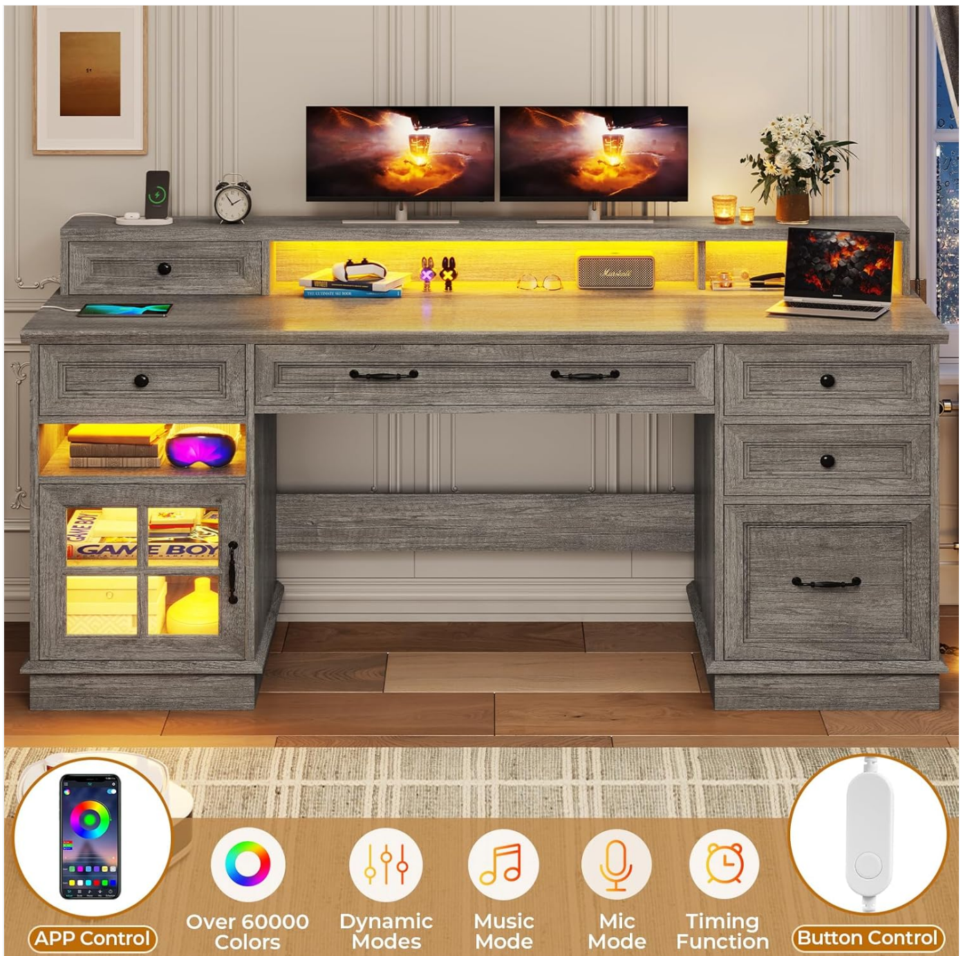
Figure 4: The desk's RGB LED lighting system with app and button control options.