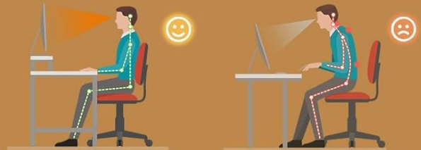
Figure 5: Ergonomic benefits of the full monitor stand.

Maintaining proper posture to reduce neck or back pain