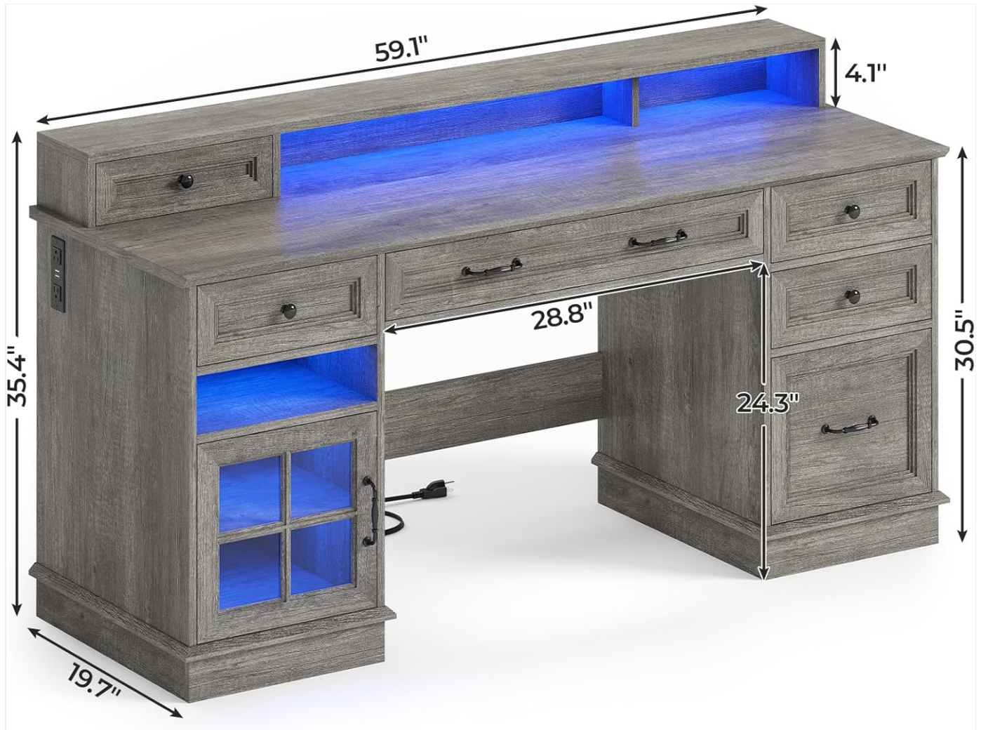
Figure 2: Product dimensions for planning your workspace.