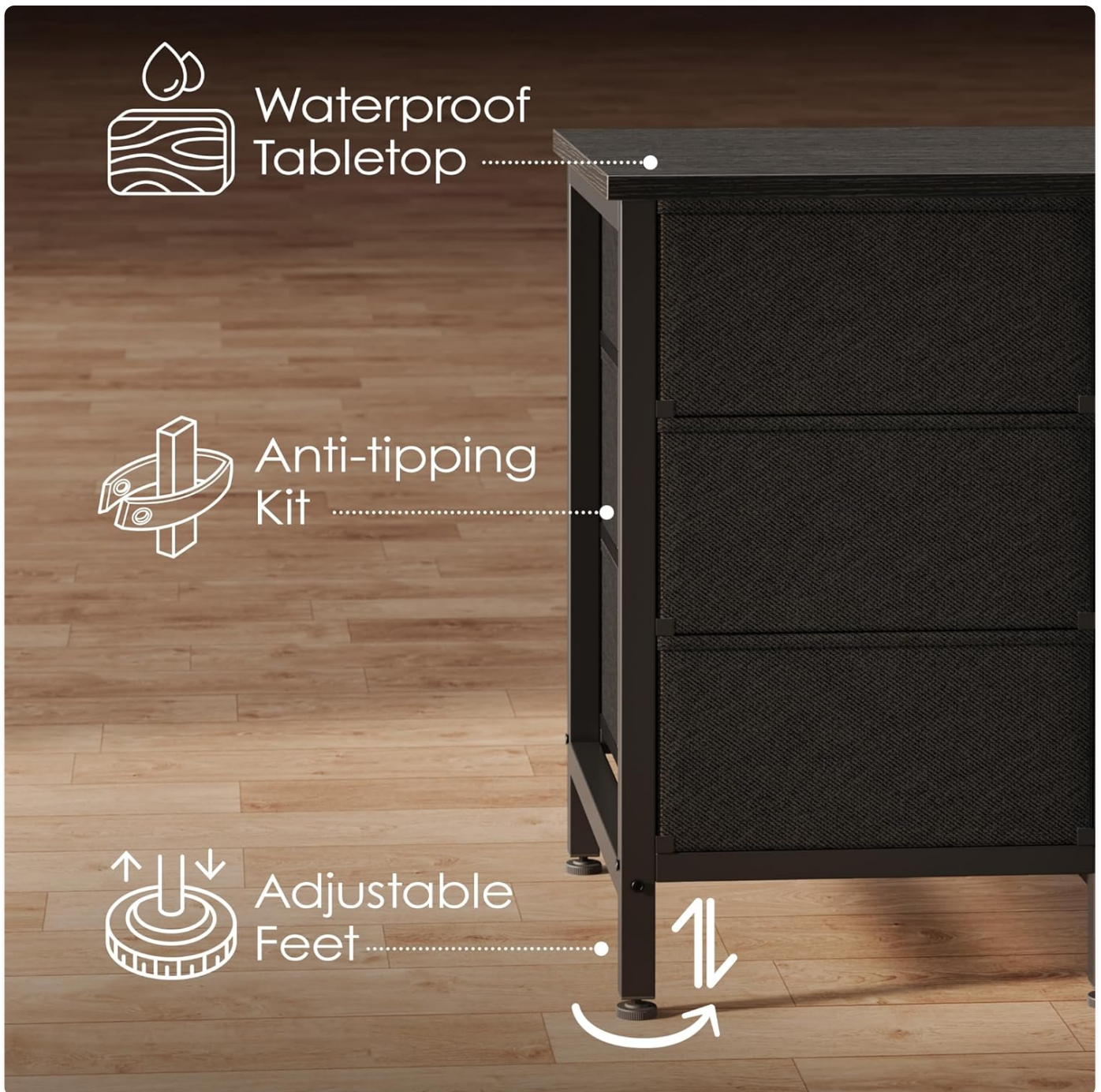
Image: A detailed view highlighting key safety and design features: a waterproof tabletop, the anti-tipping kit for wall attachment, and adjustable feet for stability on uneven surfaces.