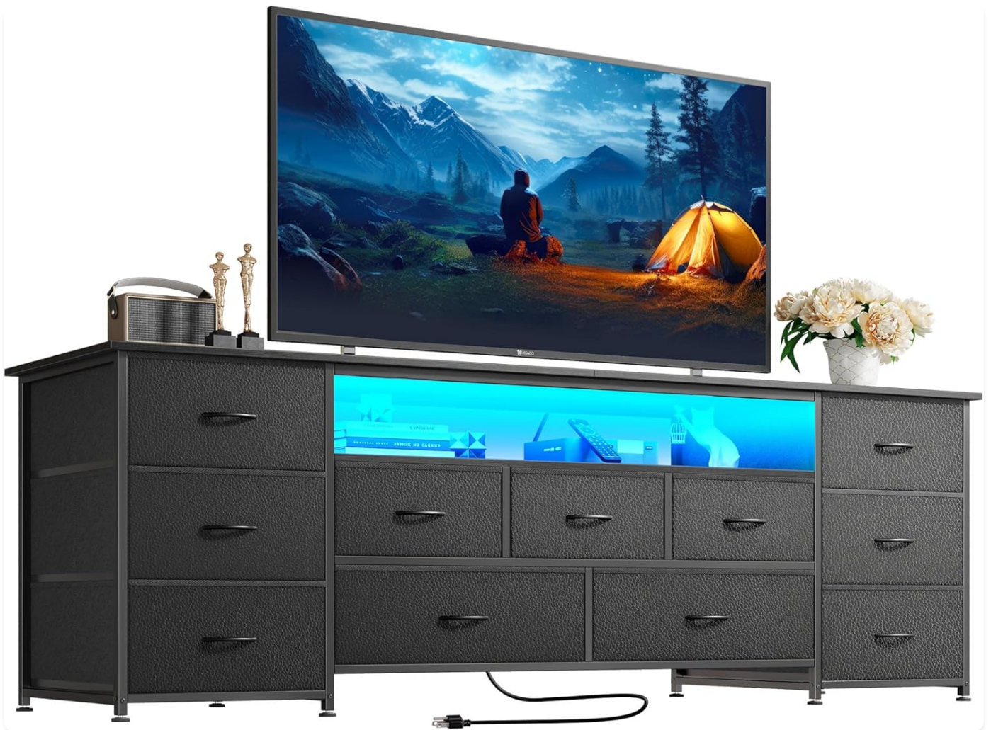
Image: The Huuger 63 Inch TV Stand, a black entertainment center with a large television placed on its top surface. The central open shelf illuminates with blue LED lights, and the unit features numerous fabric drawers for storage.