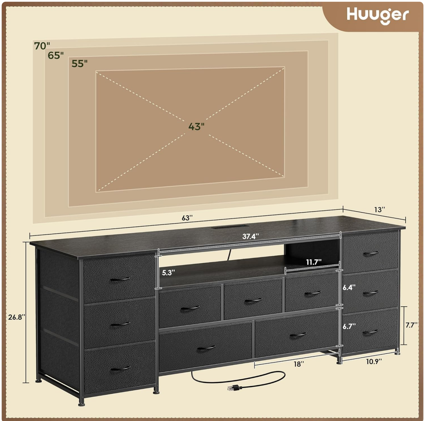
Image: A technical diagram illustrating the overall dimensions of the TV stand (63 inches wide, 26.8 inches high, 13 inches deep) and the internal measurements of the central shelf and drawer sections.