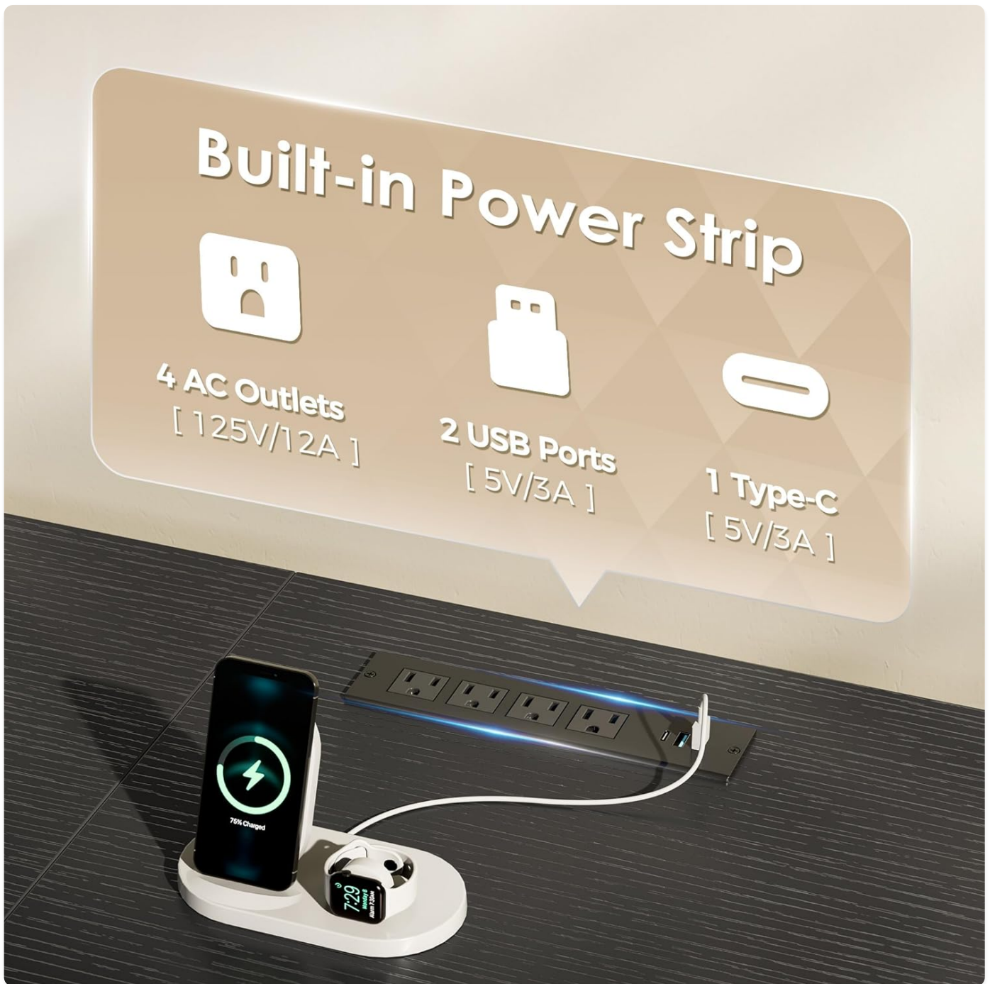
Image: A detailed view of the integrated power strip, illustrating its various ports and their specifications, with a smartphone and smartwatch connected for charging.