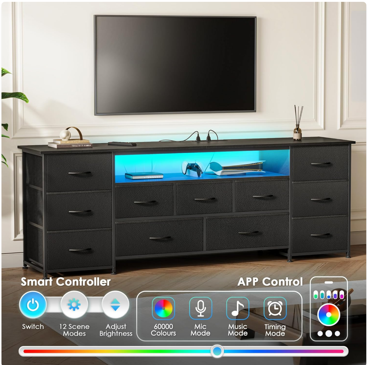
Image: The TV stand with its central compartment glowing with blue LED lights, accompanied by graphics illustrating the functions of the smart controller (power, scene modes, brightness) and the mobile app (60,000 colors, mic mode, music mode, timing mode).