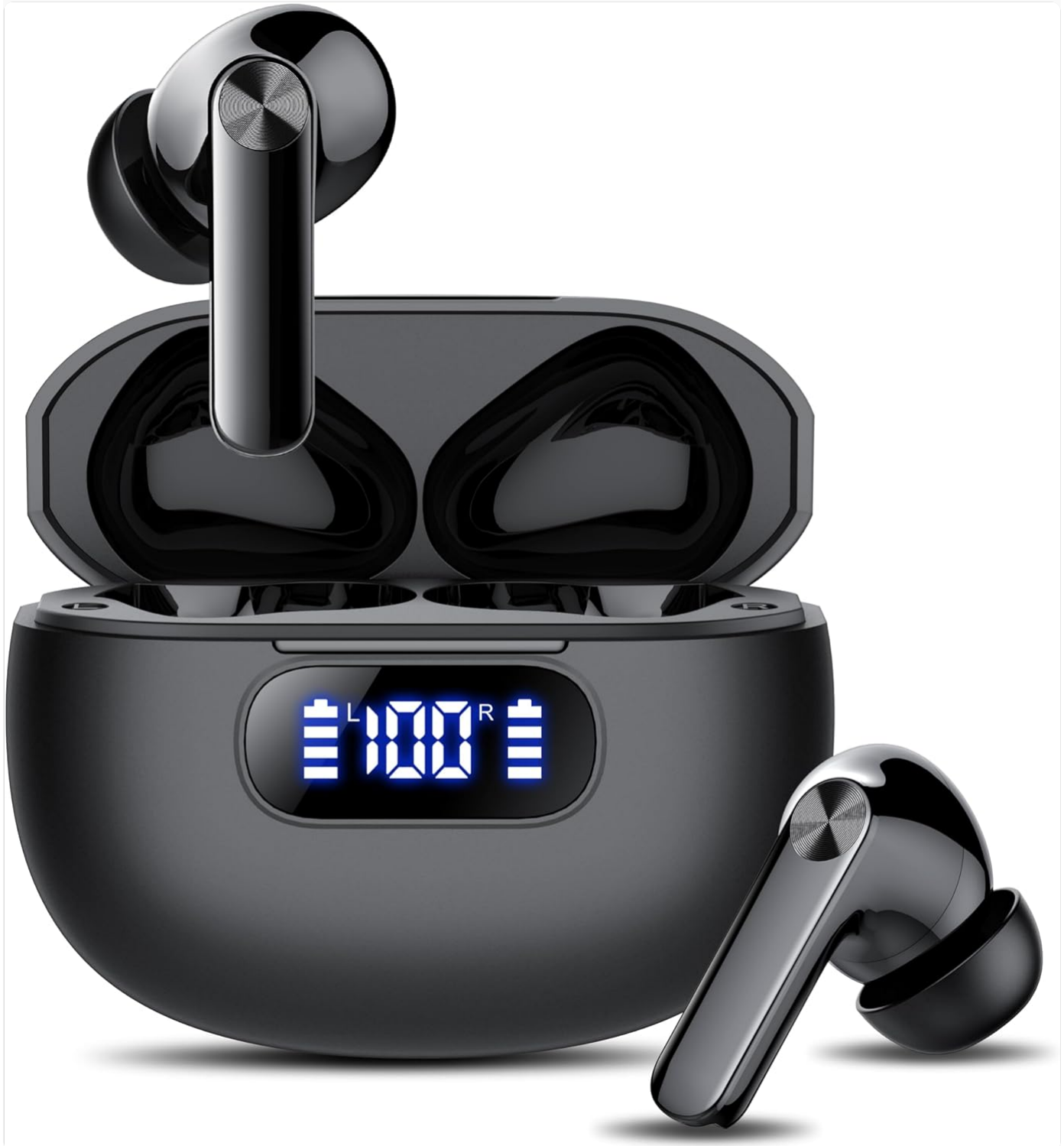
Figure 3.1: The Wekily S50 Wireless Earbuds and their charging case, highlighting the digital LED power display.

The Wekily S50 earbuds feature a sleek design with intuitive controls and a portable charging case. Understanding the components will enhance your user experience.