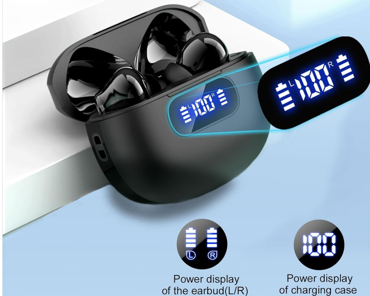
Figure 3.2: The digital power display on the charging case, indicating battery levels for both the case and individual earbuds.

Dual digital display to show the power of the charging case and earbuds