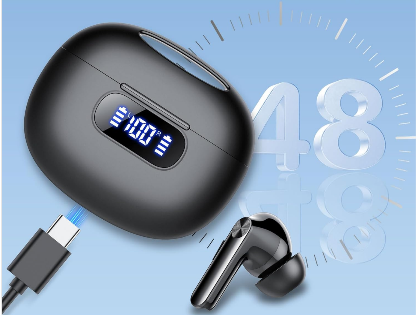
Figure 4.1: Charging the Wekily S50 earbuds and case, illustrating battery life and fast charging capabilities.