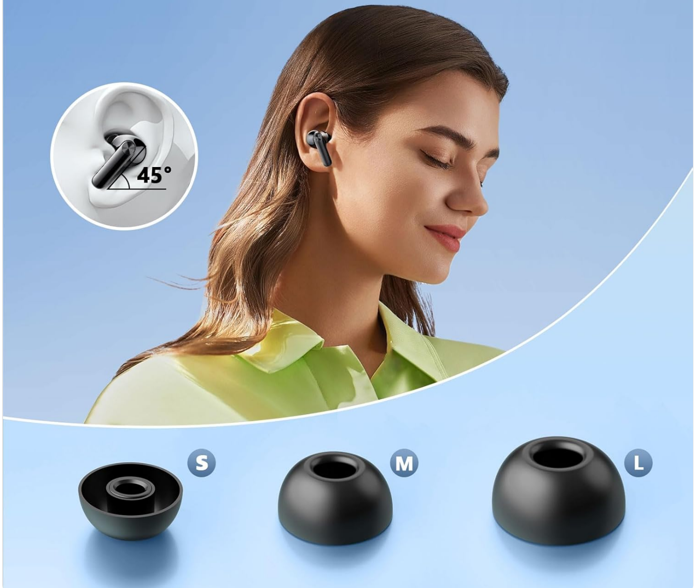
Figure 5.1: Proper ergonomic fit and available ear tip sizes for the Wekily S50 earbuds.

Different size eartips & in-ear design make you more comfortable and fit