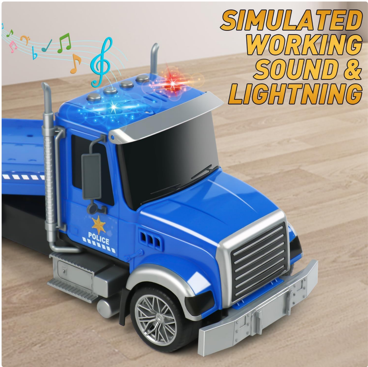
Image: The truck cab with activated lights and sound effects, illustrating its interactive features.