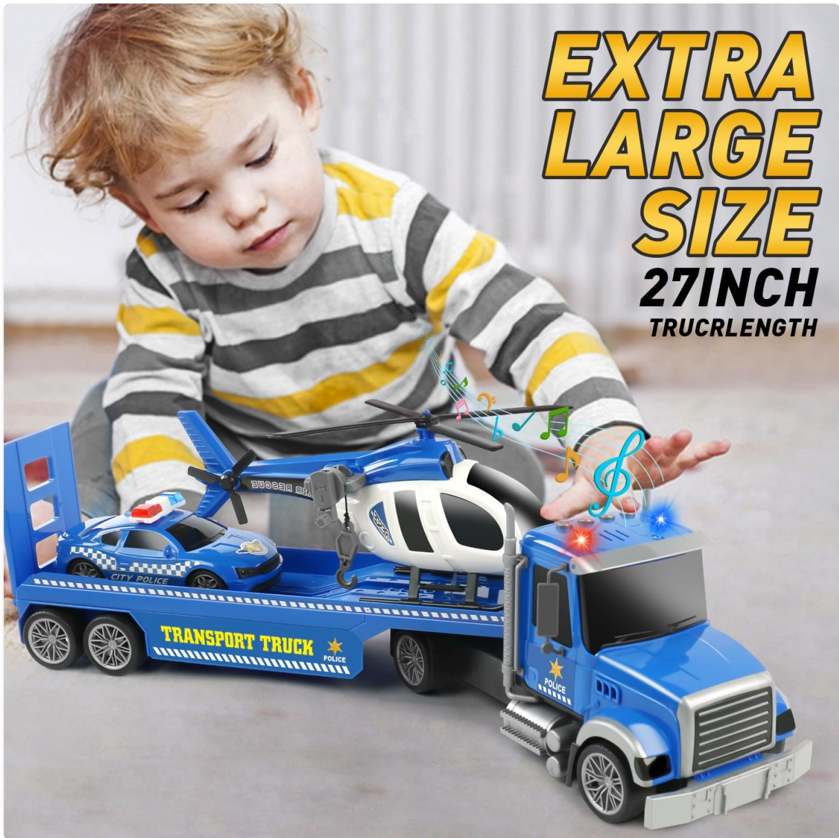
Image: A child engaging with the Dwi Dowellin Police Truck Toy, demonstrating its substantial size and play value.