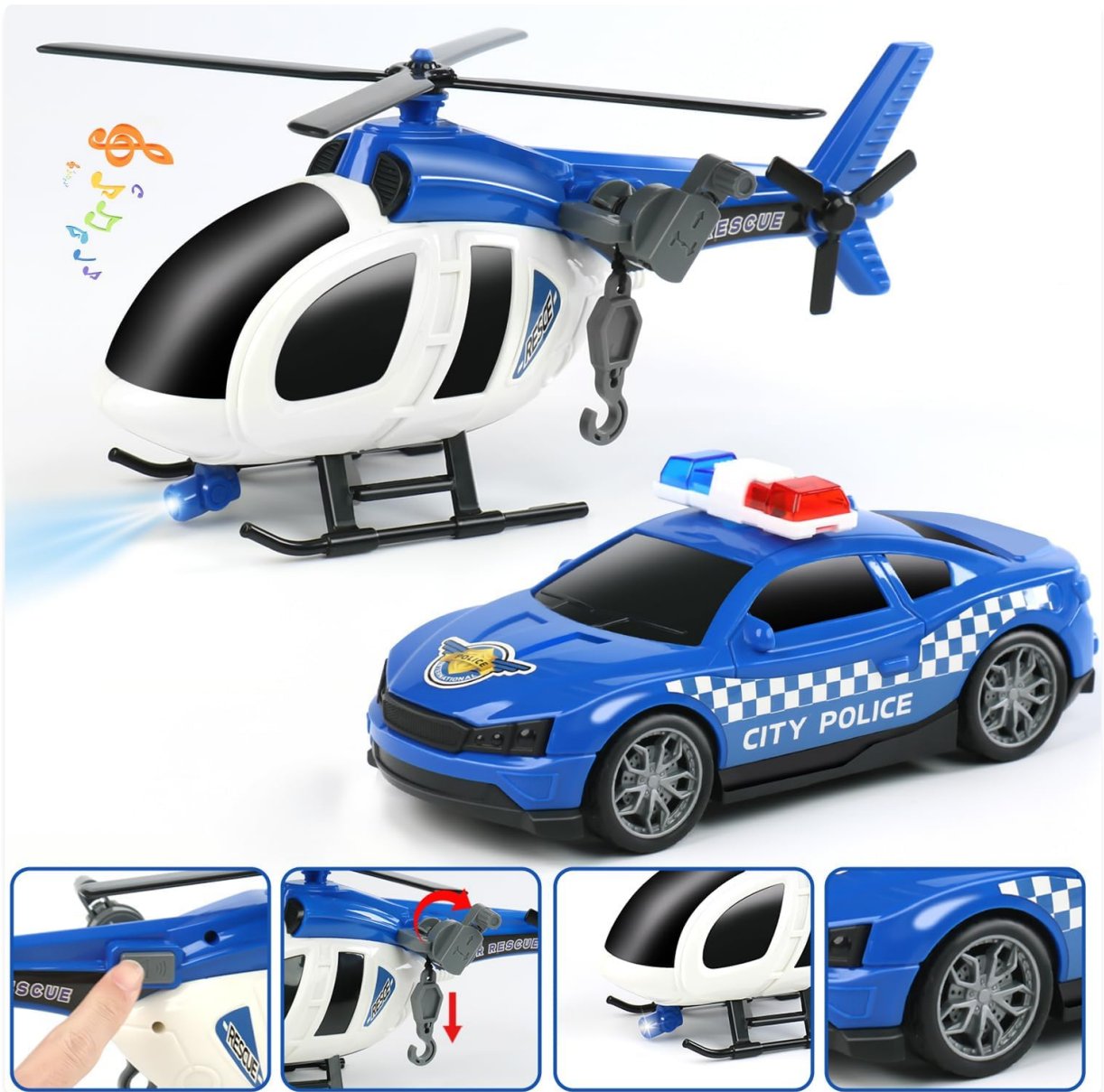
Image: The police helicopter and car, highlighting the helicopter's functional hook and sound button.