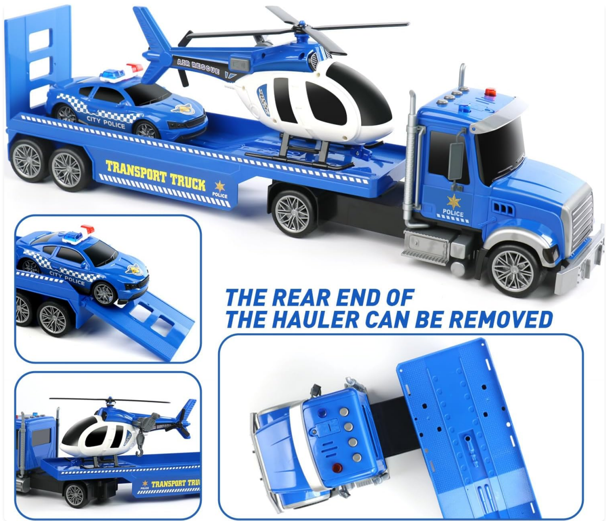
Image: The police truck with its detachable trailer and loading ramp, demonstrating how the police car can be loaded.