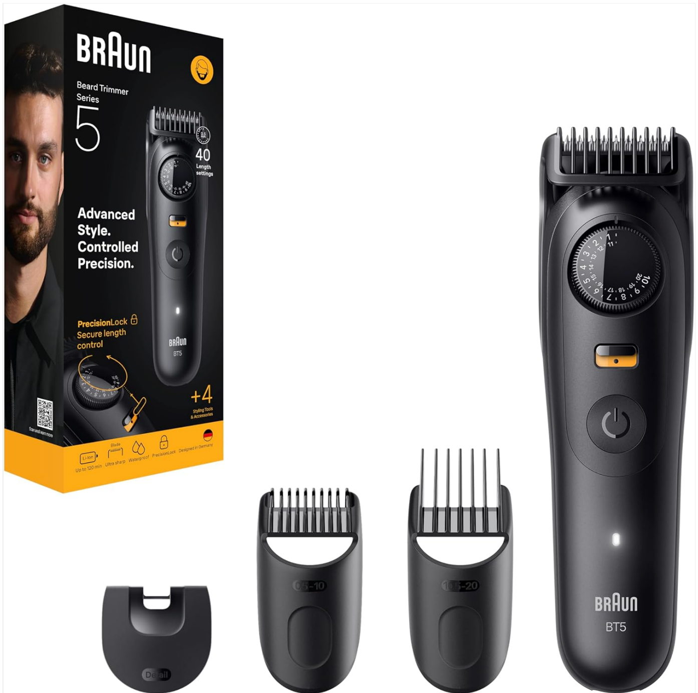
Image: The Braun Series 5 BT5520 trimmer unit displayed alongside its three comb attachments (short beard, long beard, and detail trimmer) and a cleaning brush.