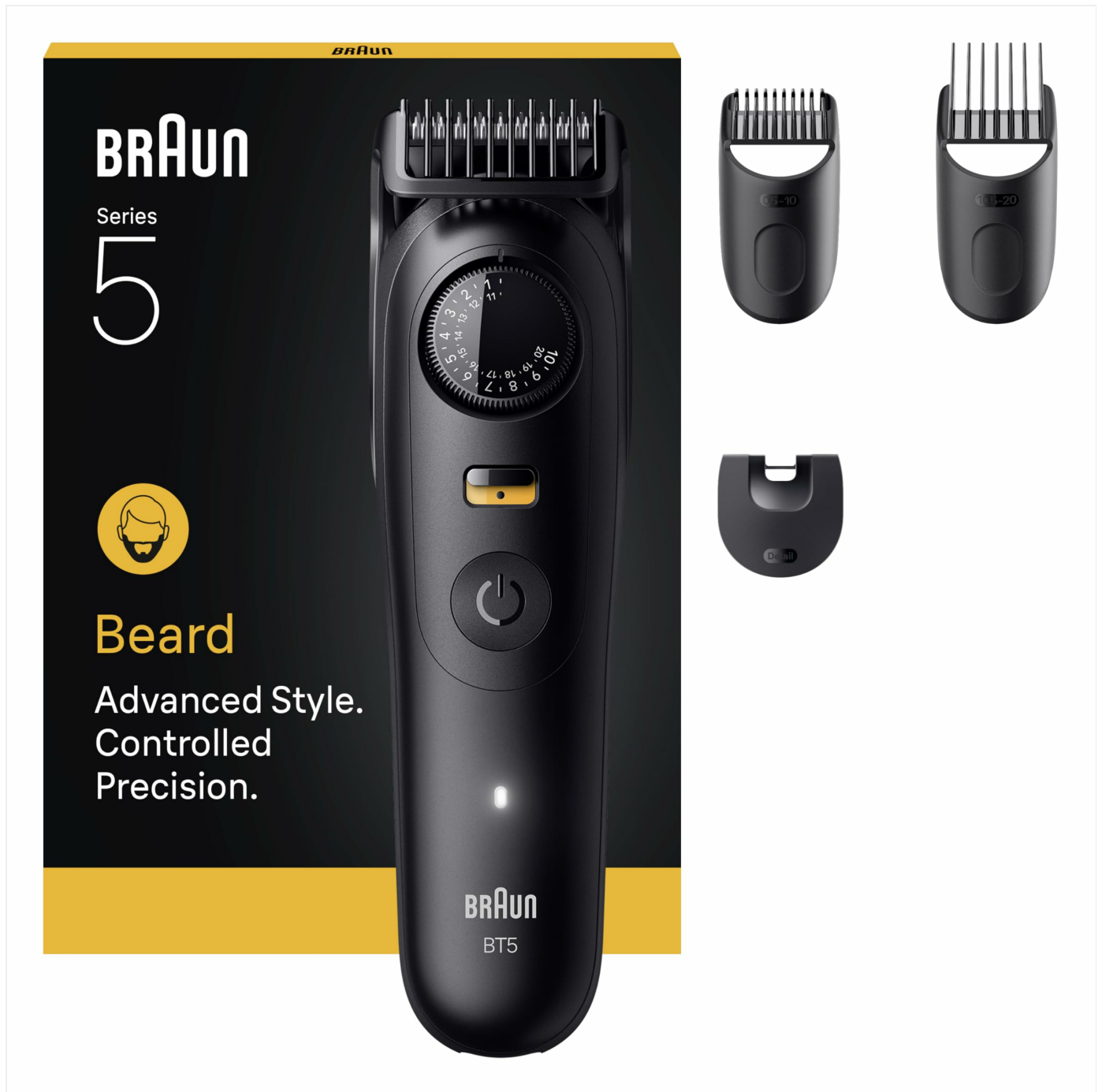
Image: Braun Series 5 BT5520 Electric Beard Trimmer showcasing its design and key features like 40 length settings, PrecisionLock, ultra-sharp blade, 120 min battery life, and waterproof capability.

The Braun Series 5 BT5520 Electric Beard Trimmer is designed for precise control and an even trim. It features an ultra-sharp ProBlade blade, a PrecisionWheel with 40 length settings, and a waterproof design.