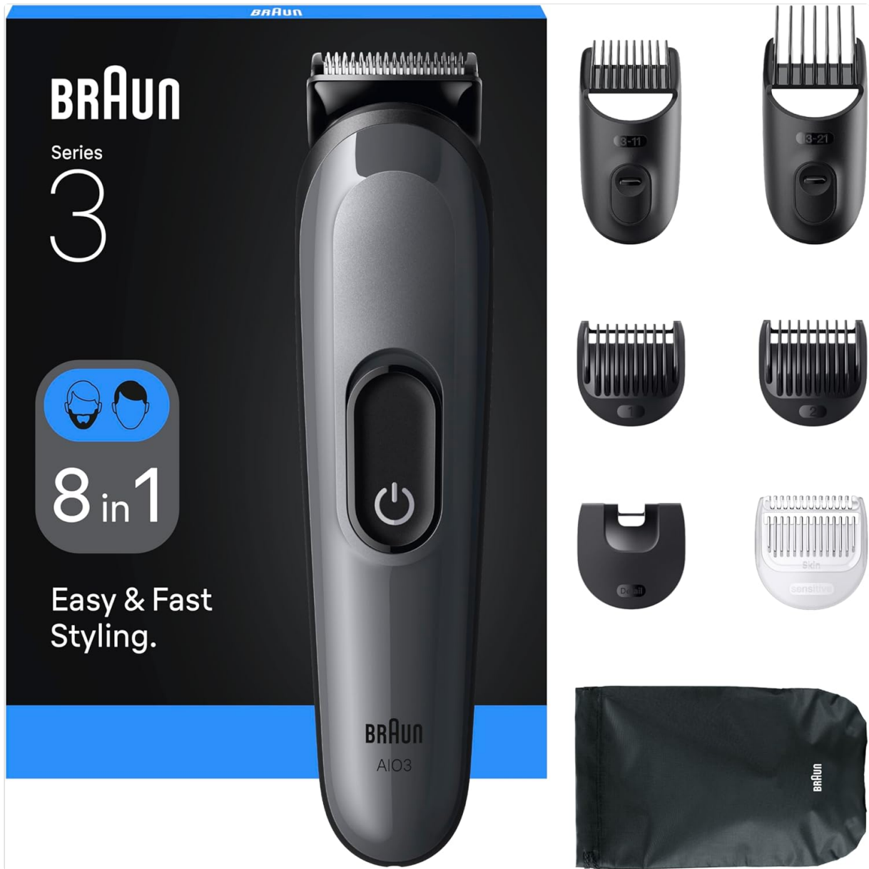
Image 1: Braun All-in-One Series 3 Trimmer with all included accessories.