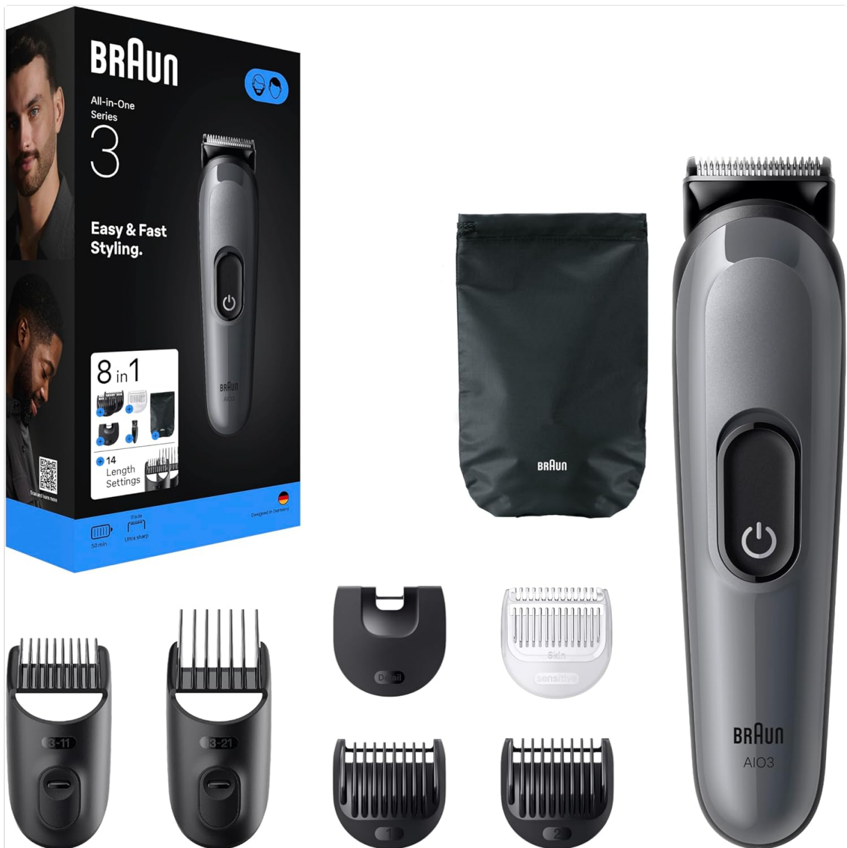
Image 2: Detailed view of the Braun AIO3540 trimmer and its various attachment combs and tools.