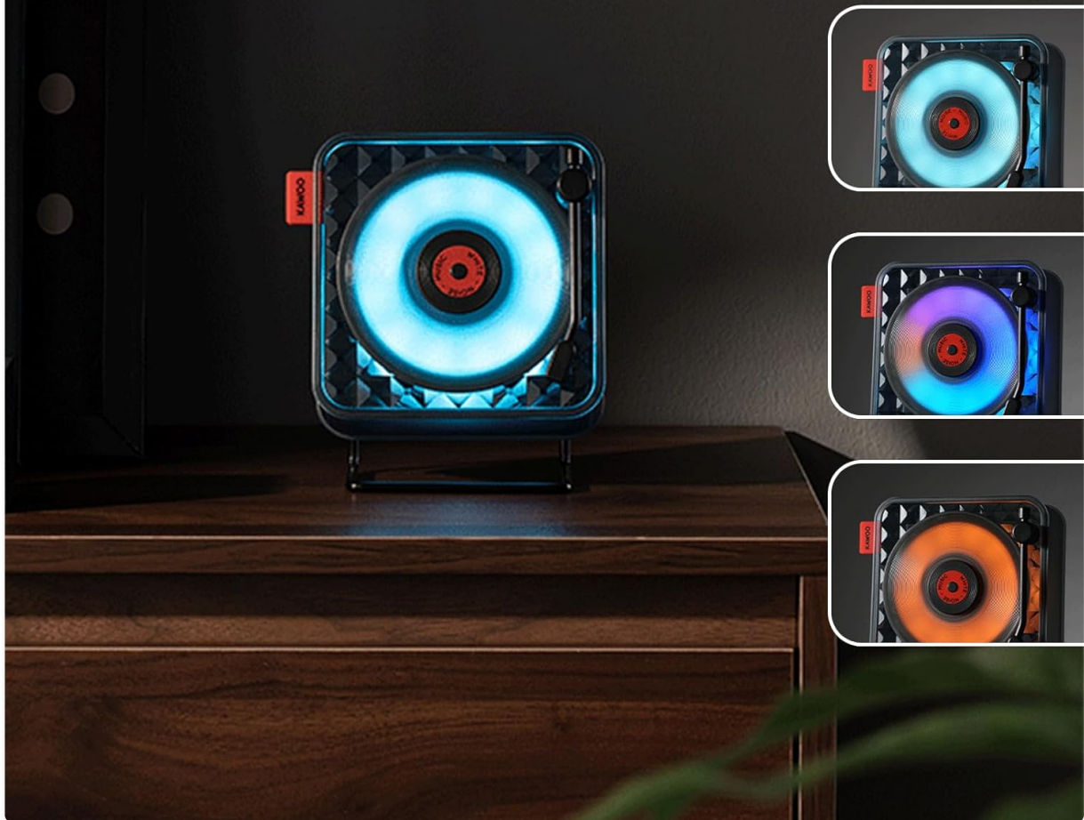
Image: Three views of the Generic KW02 Retro Bluetooth Speaker, each demonstrating a different RGB lighting mode: blue, purple, and orange, highlighting its ambient light capabilities.

Classic phonograph design speaker with colored night lights three modes to choose from, with white light/breathing/RGB mode