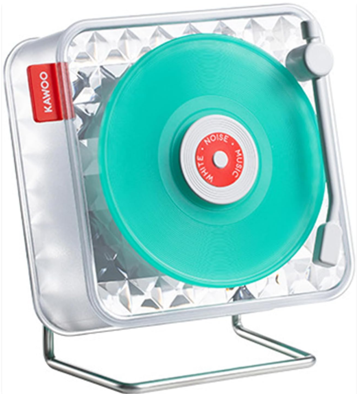
Image: Front view of the Generic KW02 Retro Bluetooth Speaker, featuring a green vinyl record design and a red 'KAWOO' tag on the side.