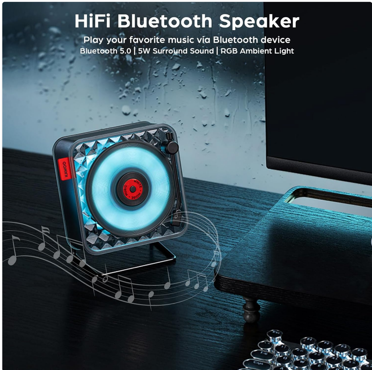
Image: The Generic KW02 Retro Bluetooth Speaker with its central disc glowing with blue RGB light, indicating active operation or Bluetooth mode.