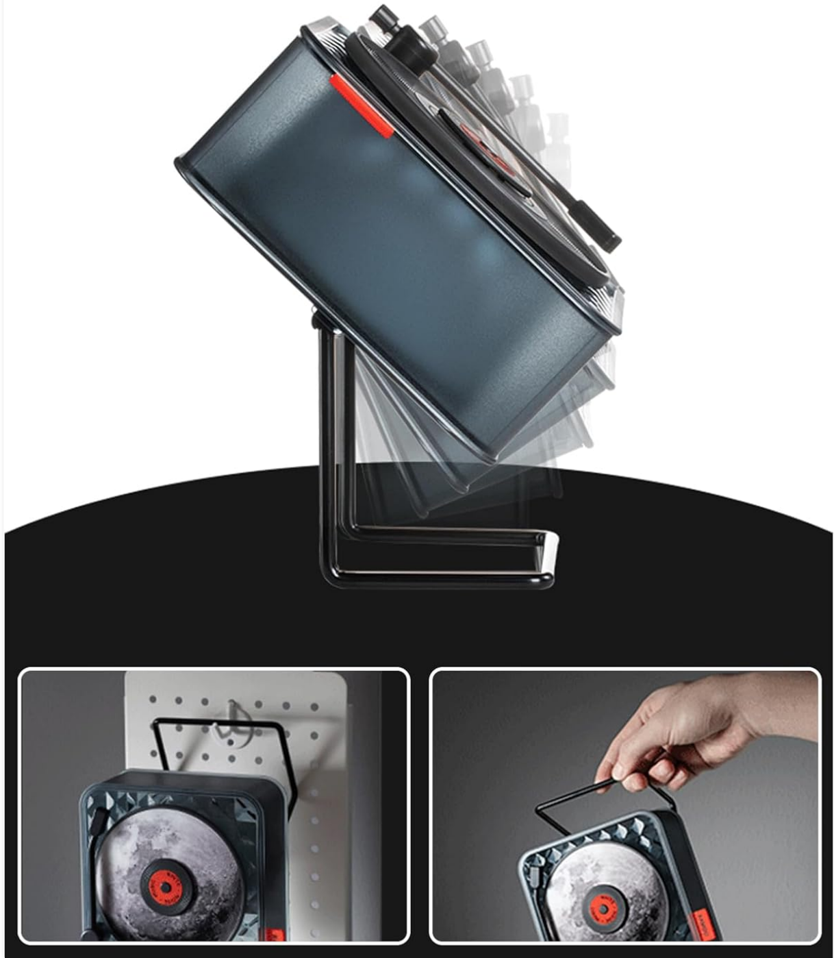
Image: The Generic KW02 Retro Bluetooth Speaker shown with its stand allowing for multi-angle adjustment, and also being held by hand, illustrating its portability.

The speaker's stand allows for multi-angle adjustment, enabling optimal sound direction. It can also be hung or handheld for portability.