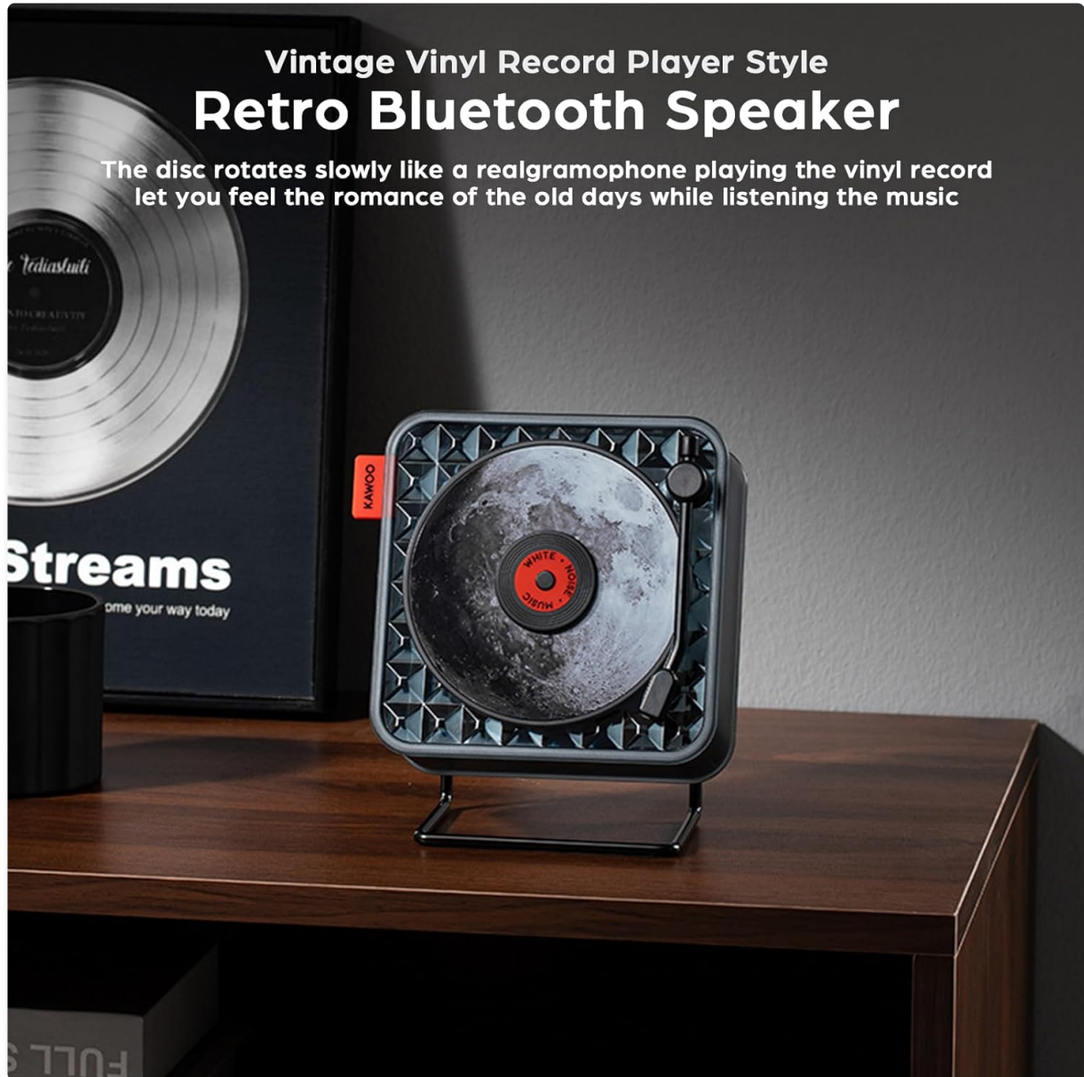
Image: The Generic KW02 Retro Bluetooth Speaker positioned on a wooden shelf, highlighting its vintage vinyl record player aesthetic.

Familiarize yourself with the speaker's components and prepare it for first use.