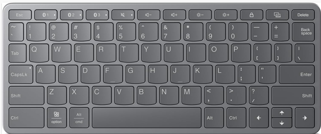
Figure 1: Top-down view of the Lenovo Multi-Device Wireless Bluetooth Keyboard, showcasing its compact and sleek design.

The Lenovo Multi-Device Wireless Bluetooth Keyboard is engineered for maximum productivity and versatility. It allows you to effortlessly connect and switch between up to three different devices, such as laptops, tablets, and smartphones, running various operating systems including Android, iOS, and Windows.