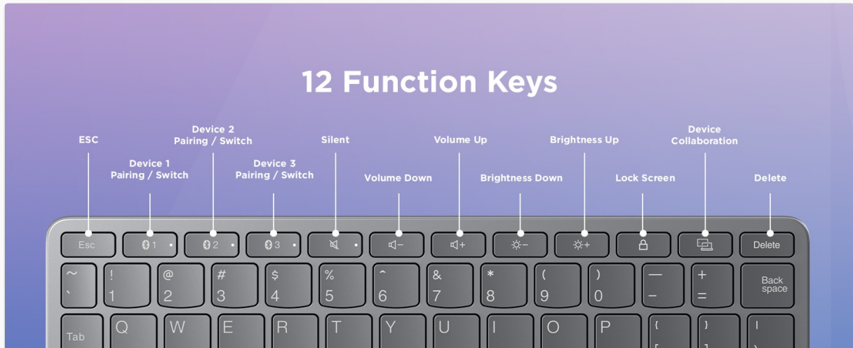
Figure 4: Diagram illustrating the 12 function keys and their default assignments, including device switching, volume control, brightness, and lock screen.

The keyboard features 12 customizable shortcut keys (F1-F12 functions) that provide quick access to various system functions. These keys are typically activated by pressing the Fn key in combination with the desired function key. Refer to the diagram below for common functions.