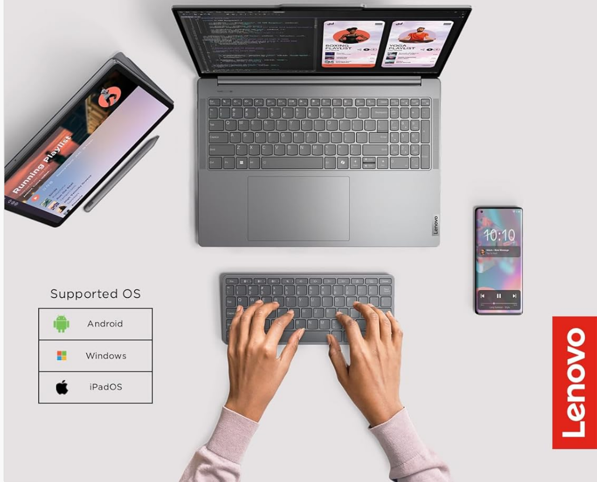
Figure 2: Illustration of the keyboard's multi-device connectivity, showing it connected to a laptop, tablet, and smartphone, highlighting compatibility with Android, Windows, and iPadOS.

Effortlessly connect and switch up to 3 devices