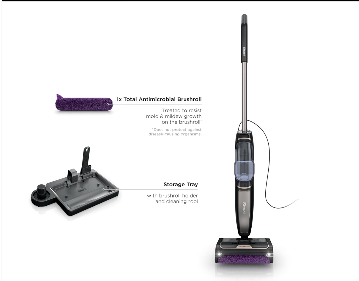
Image: Contents of the Shark SD201 Steam Mop package. This includes the main steam mop unit, an antimicrobial brushroll, and a storage tray designed to hold the brushroll and a cleaning tool.