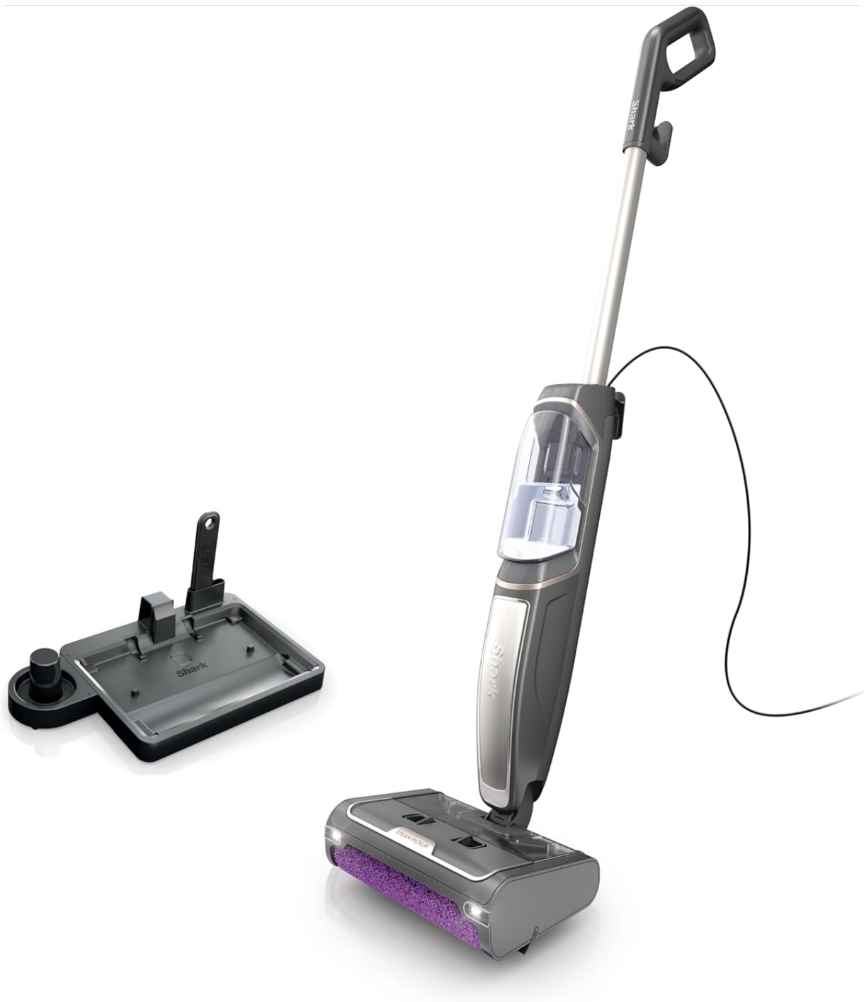
Image: The Shark SD201 Steam Mop fully assembled, standing upright next to its dedicated storage tray. This illustrates the complete product ready for use or storage.