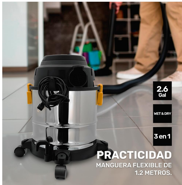
Figure 4.1: The vacuum cleaner effectively cleaning a floor surface.