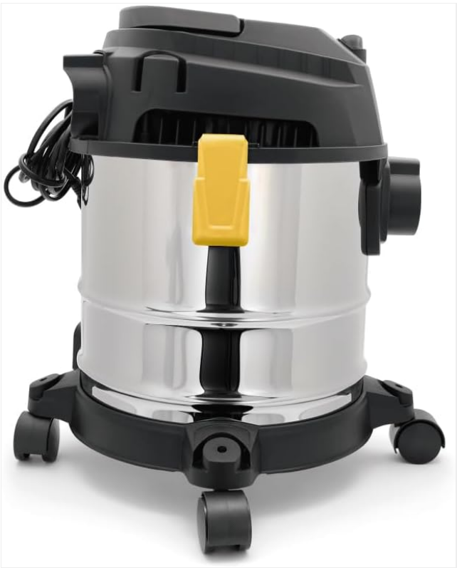
Figure 5.1: The power cord neatly wrapped around the vacuum unit for compact storage.