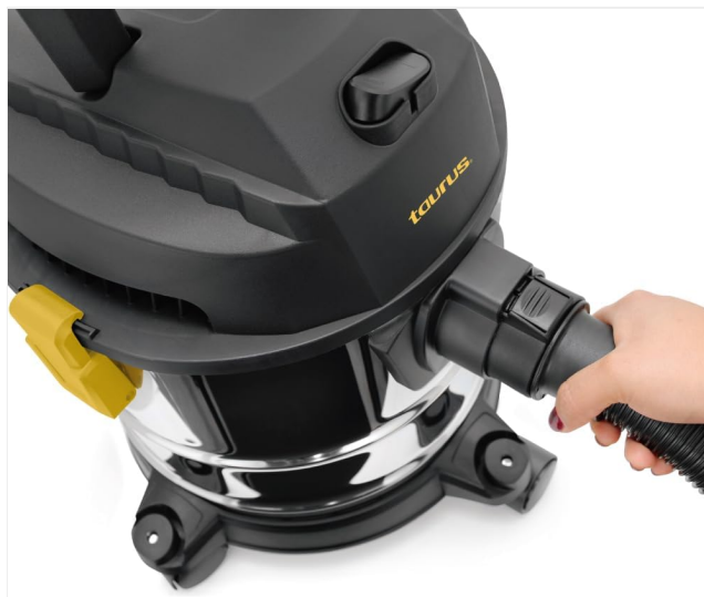
Figure 3.1: Proper connection of the flexible hose to the vacuum unit.