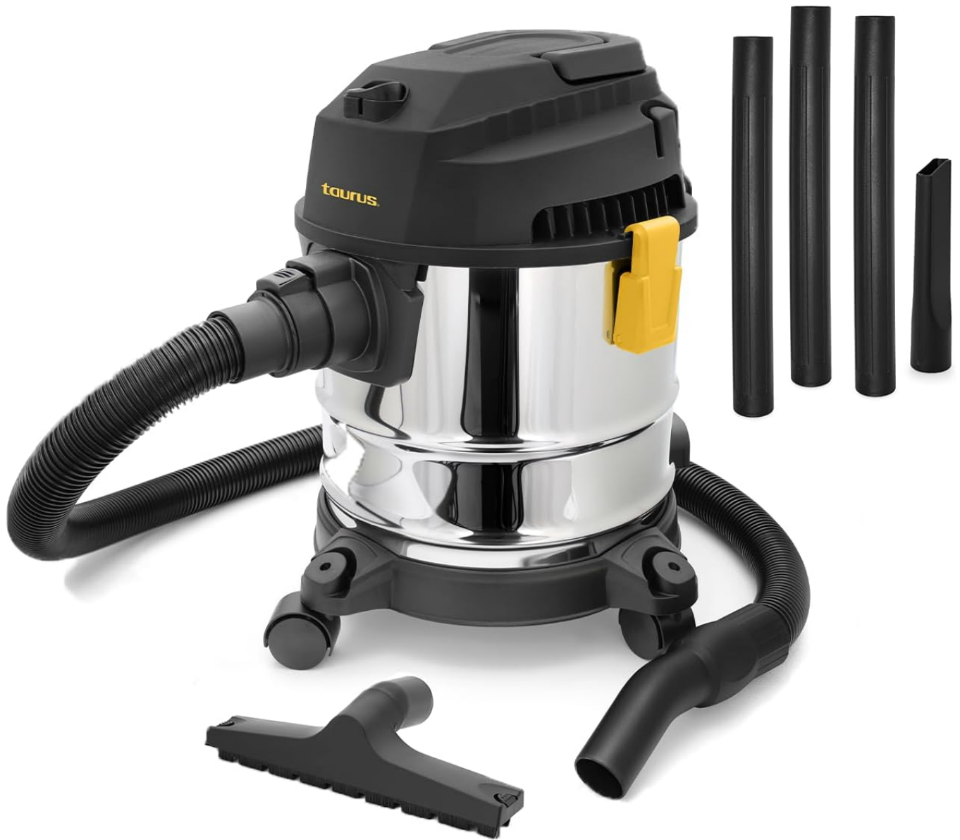
Figure 2.1: The Taurus Tempest Wet & Dry Vacuum Cleaner shown with its main body, hose, and various cleaning attachments.