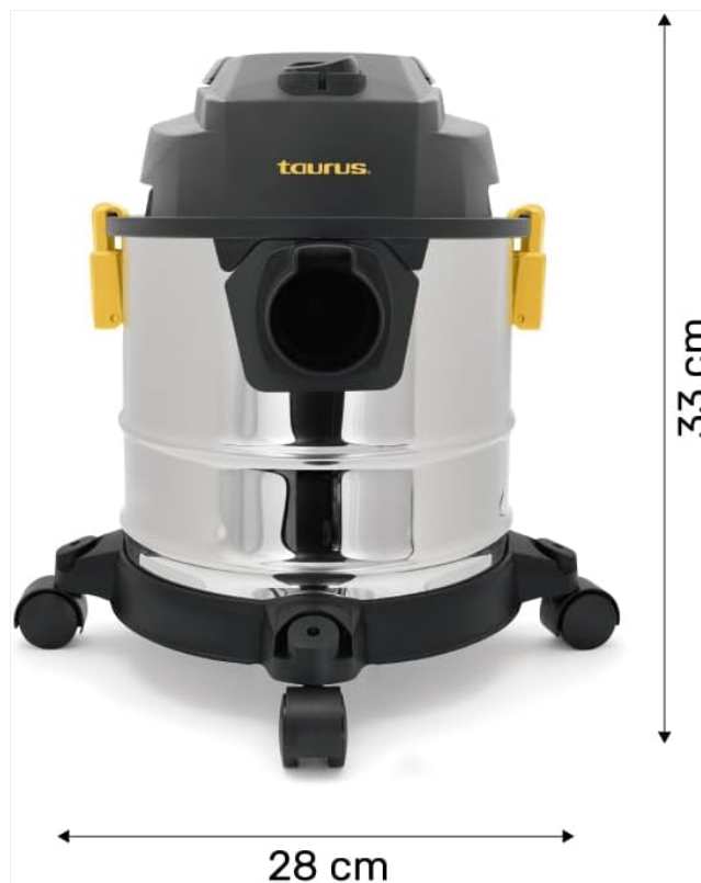
Figure 7.1: Approximate dimensions of the Taurus Tempest vacuum cleaner.