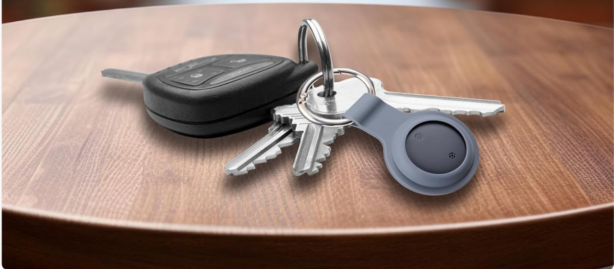
Image: An iPhone screen showing a 'Time Sensitive' notification indicating that 'Emily's Keys' were left behind, with a set of keys and a Reyke Smart Tag visible on a wooden table.