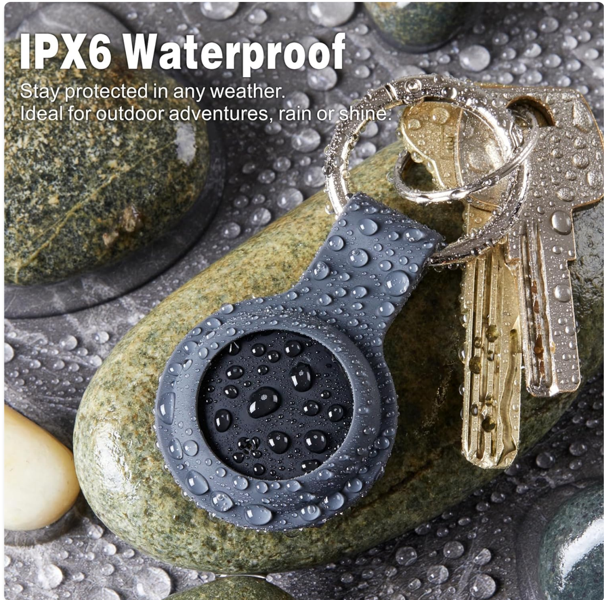
Image: A Reyke Smart Tag, attached to a keychain with keys, resting on wet, pebbled surfaces, illustrating its IPX6 water-resistant capability.

The Reyke Smart Tag is rated IPX6 water-resistant, meaning it can withstand powerful water jets. This makes it suitable for outdoor use and protection against rain or splashes. However, it is not designed for submersion in water.