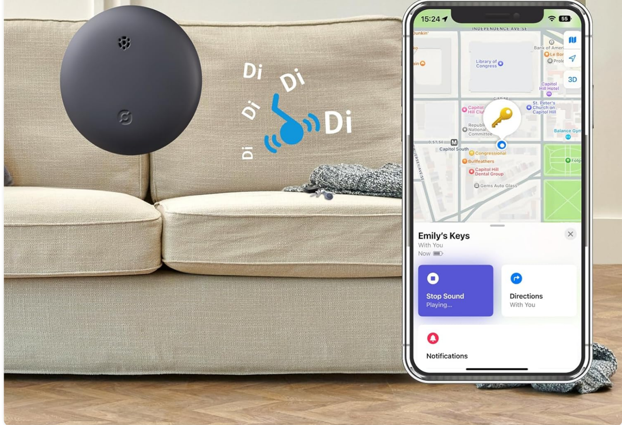
Image: A Reyke Smart Tag resting on a couch, visually indicating sound waves, next to an iPhone displaying the 'Play Sound' option within the Find My app to locate the item.

Crystal-Clear Audibility and Impressive Tracking Range Up to 105dB loud beep Up to 180ft. Bluetooth range