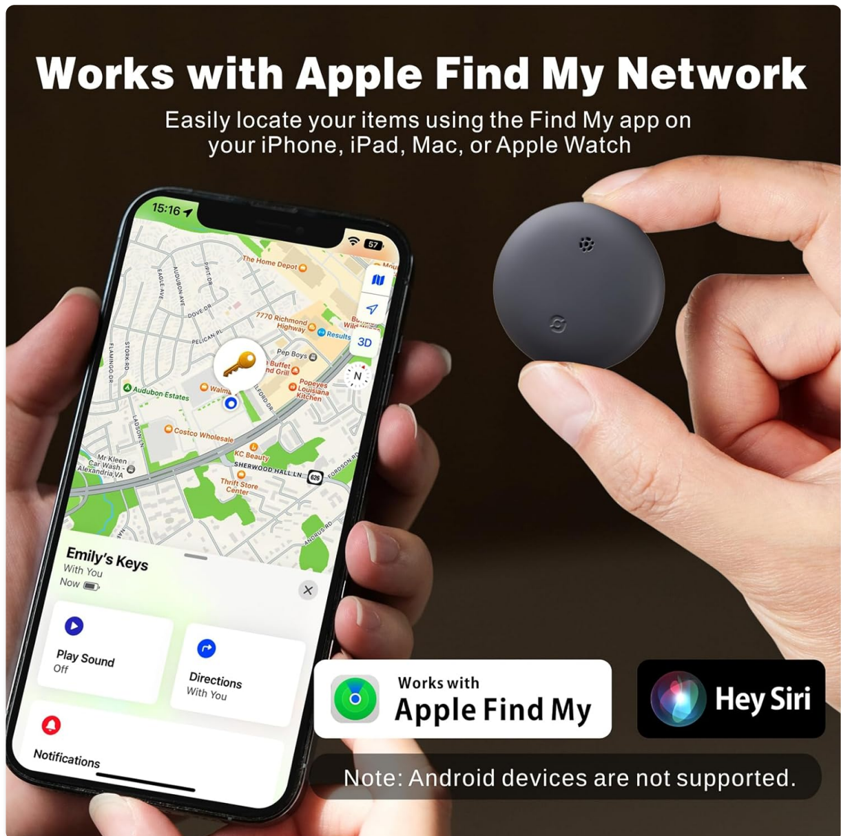
Image: The Reyke Smart Tag displayed alongside an iPhone screen showing the Apple Find My map interface, indicating successful integration and item tracking capabilities.