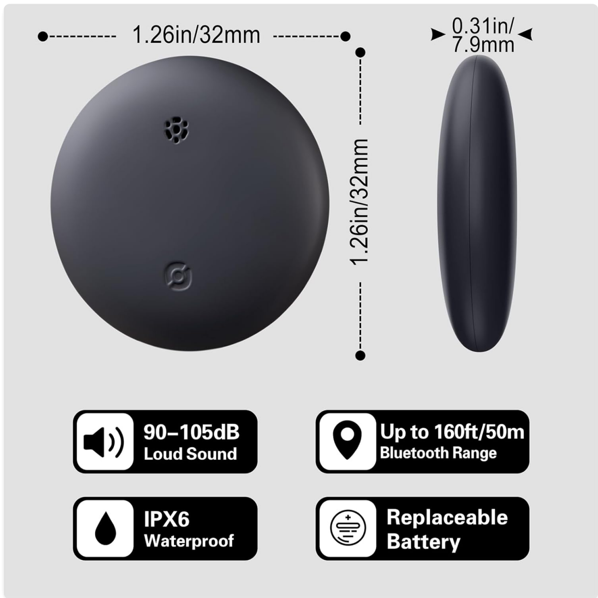
Image: A visual representation of the Reyke Smart Tag's dimensions (1.26 inches / 32mm diameter, 0.31 inches / 7.9mm thickness) and key features including 90-105dB loud sound, up to 160ft/50m Bluetooth range, IPX6 waterproof rating, and replaceable battery.