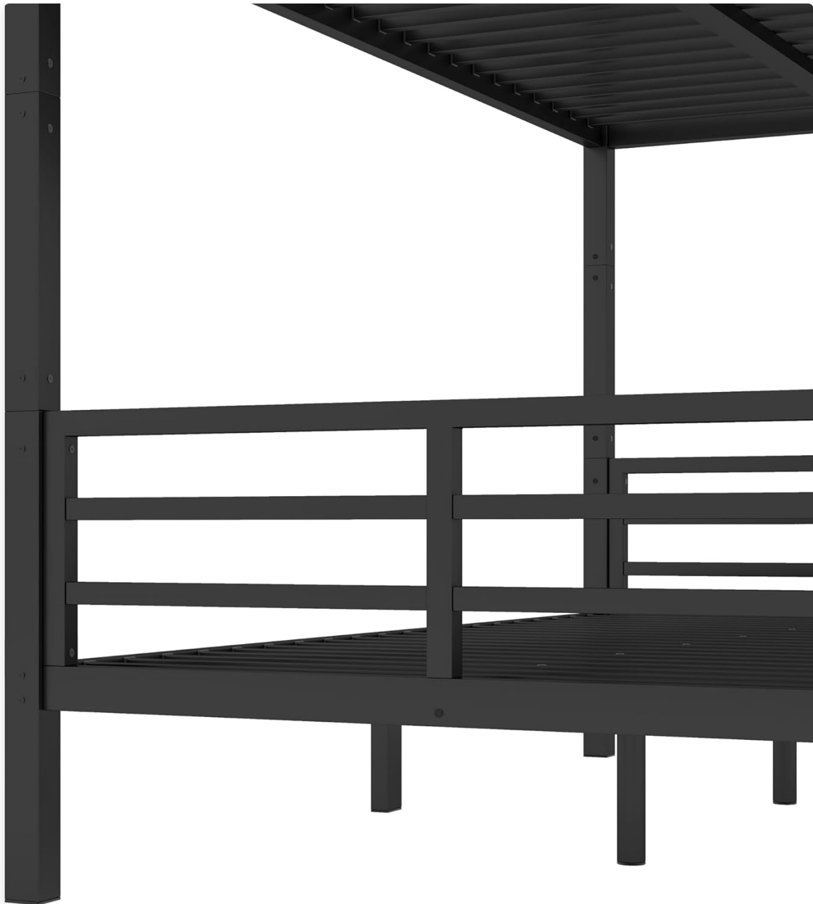
Image: Detailed view of key components including metal slats, rubber stoppers for noise reduction, and the integrated ladder design.