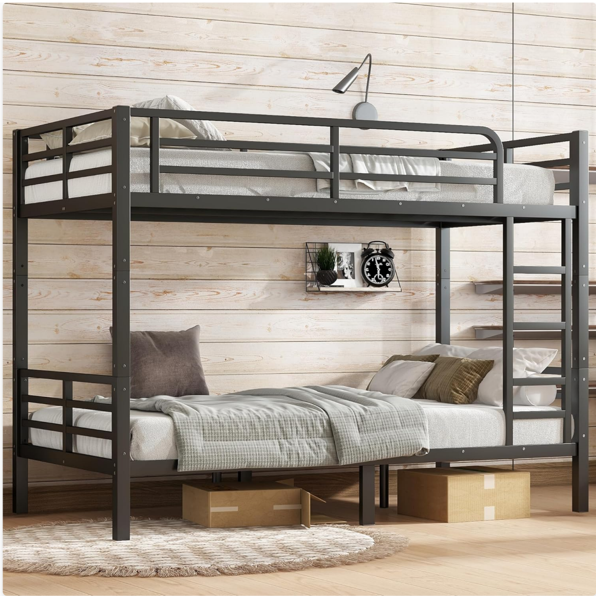
Image: Fully assembled Bellemave Twin XL Over Twin XL Bunk Bed in black metal finish.