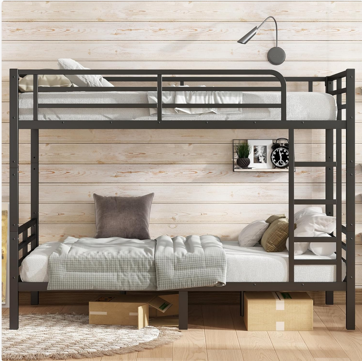
Image: The Bellemave Twin XL Over Twin XL Bunk Bed fully assembled, ready for use.

Note: This bunk bed will arrive in one box.