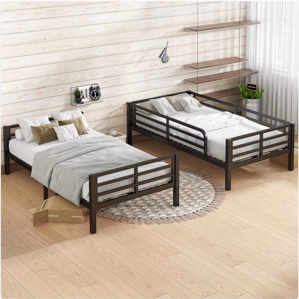
Image: Illustration of ample space between bunks to prevent head bumping.