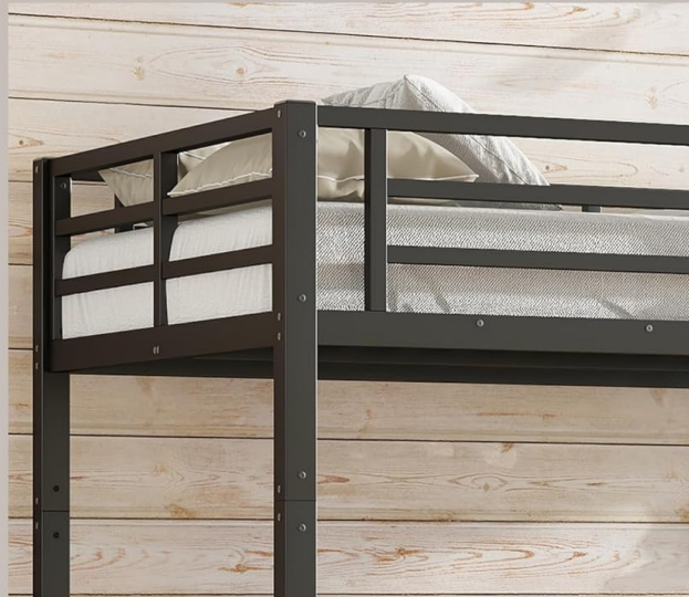
Image: Close-up of the 13-inch high full-length guardrails on the upper bunk.

13” H Guardrails to prevent accidental falls