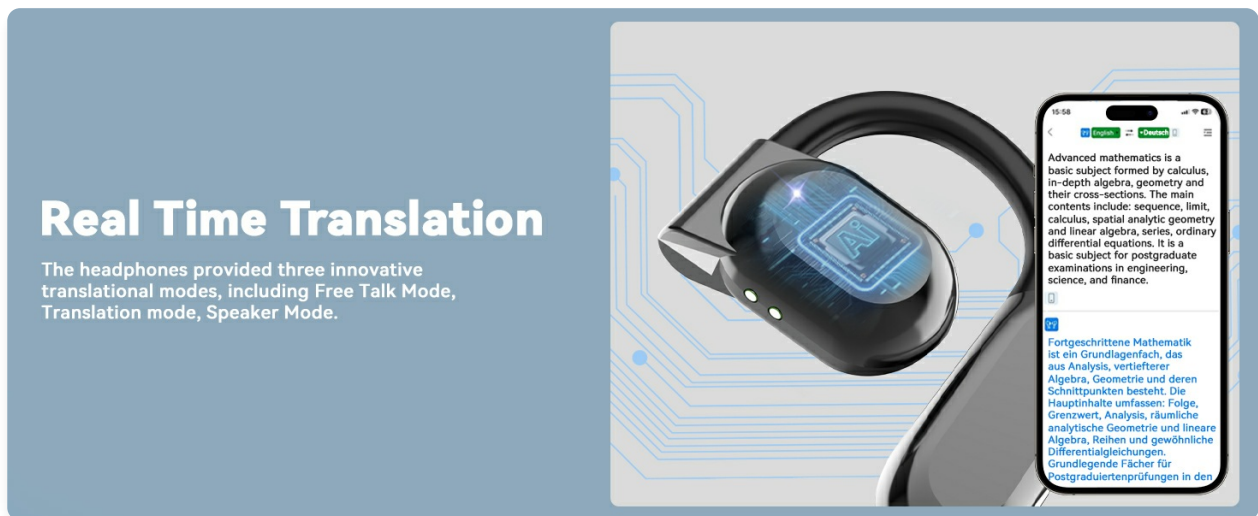
Image: A visual demonstrating real-time translation with the earbuds, showing text translation on a smartphone screen.