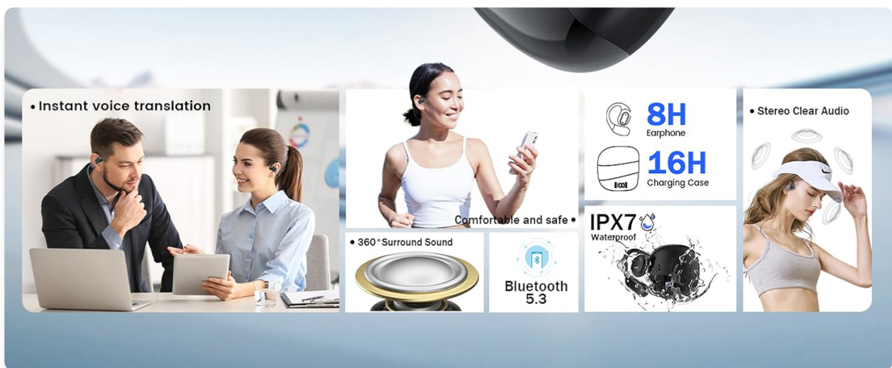
Image: An infographic highlighting key features such as 8 hours earphone battery, 16 hours with charging case, IPX7 waterproof, Bluetooth 5.3, and stereo clear audio.