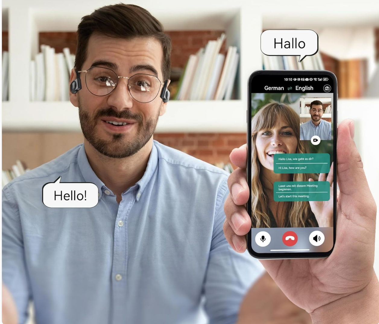
Image: A person on a video call, demonstrating the real-time translation feature with speech bubbles showing different languages.

Make video or voice calls with your friends in different languages