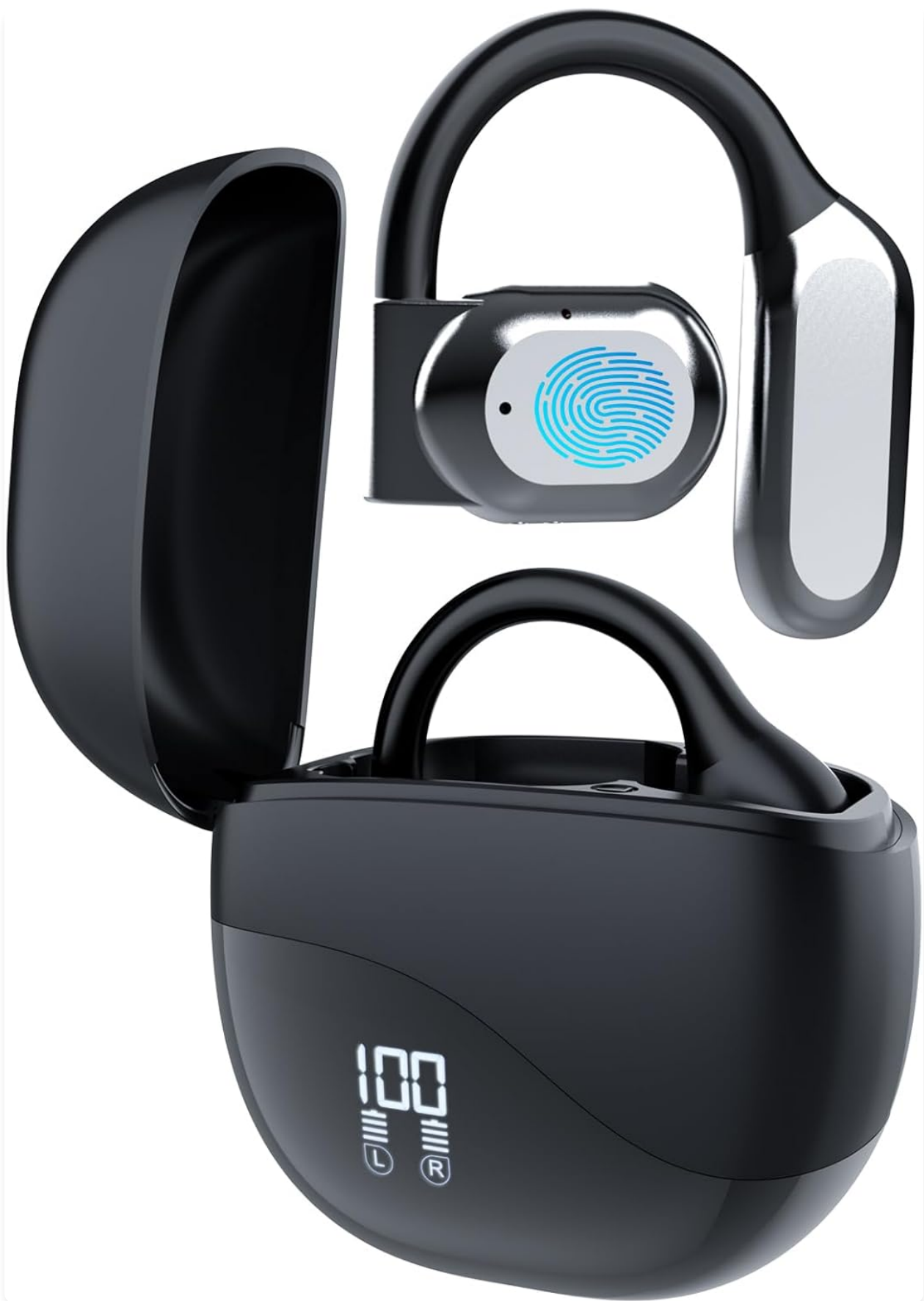
Image: The MONODEAL AI Translator Earbuds, showcasing the earbuds and their charging case. The case displays a digital battery percentage.