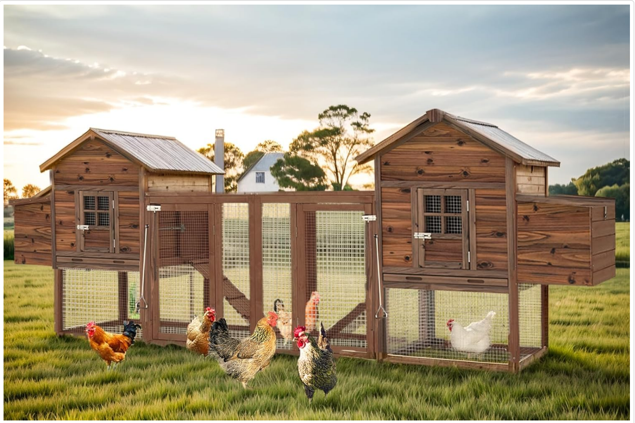
Image 1.1: The TANGJEAMER Large Wooden Chicken Coop, showcasing its dual housing units and integrated run, situated in an outdoor environment with several chickens.