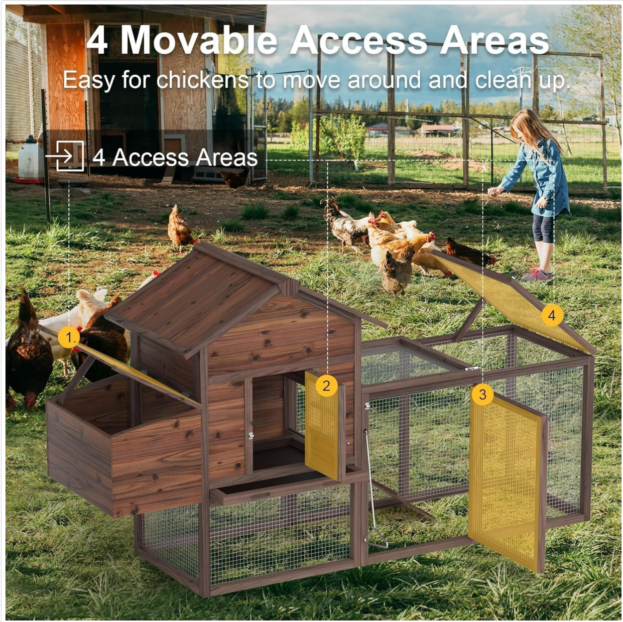
Image 4.2: Illustration of the four movable access areas, indicating points for animal entry/exit and cleaning access.