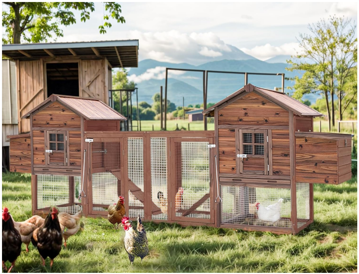
Image 5.2: Detailed view of the coop's features, including the lounge room, removable chassis for cleaning, anti-slip slopes on the ramp, and the nesting box.