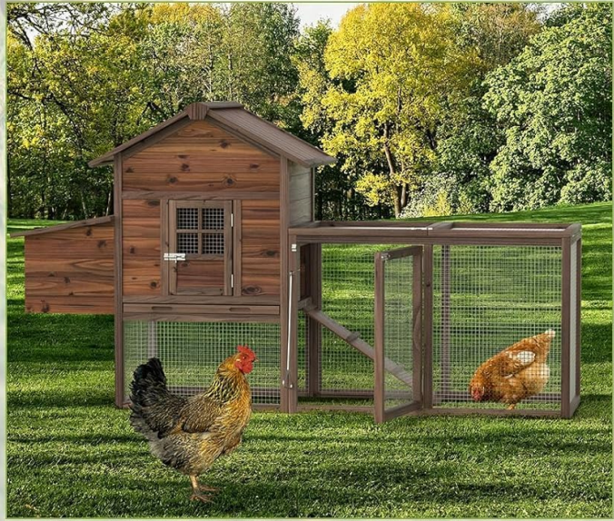
Image 4.1: Details of the coop's construction, highlighting the quality carbonized wood with waterproof coating, non-rusting wire mesh, and sturdy metal latches and door bolts.