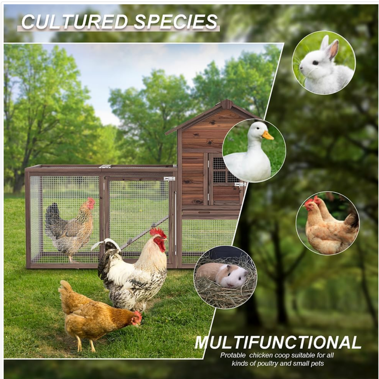
Image 1.2: The chicken coop demonstrating its suitability for various small animals, including chickens, ducks, rabbits, guinea pigs, hedgehogs, and squirrels.