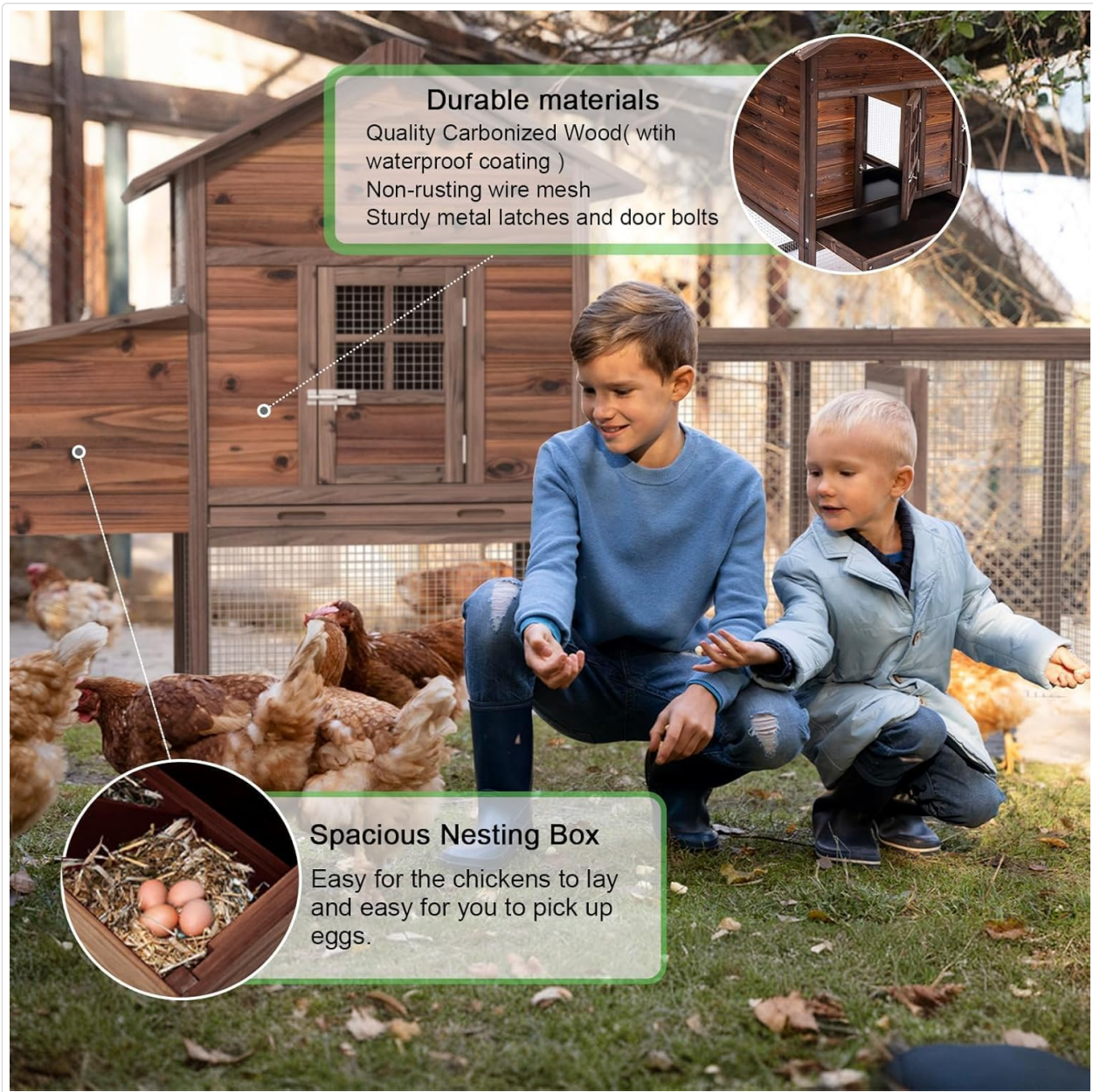
Image 5.1: The spacious nesting box, designed for easy egg collection, shown with eggs inside.