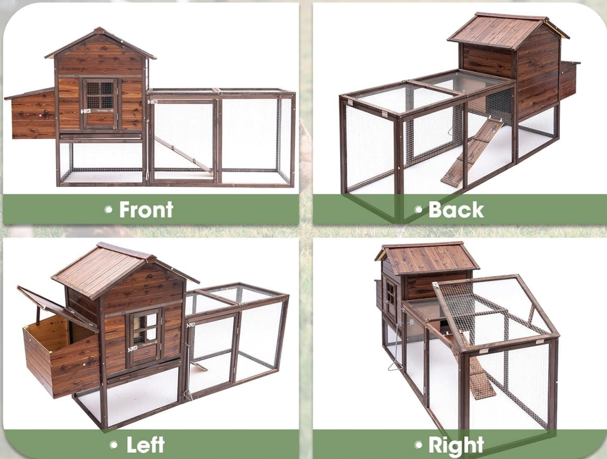
Image 4.3: Various views of the chicken coop (front, back, left, right) to aid in understanding its structure during assembly.