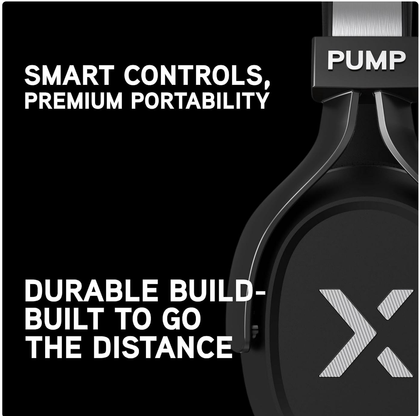
Image: A close-up view of the BlueAnt Pump X headphone ear cup, highlighting the power button, USB-C port, and the durable design, emphasizing smart controls and portability.