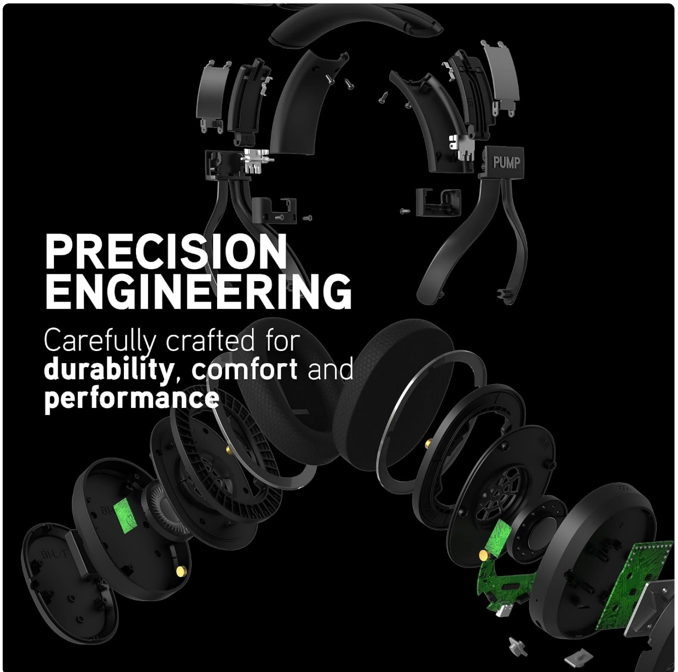
Image: An exploded view of the Pump X headphones, detailing the internal components, including drivers, circuit boards, and the overall build design, emphasizing precision engineering.