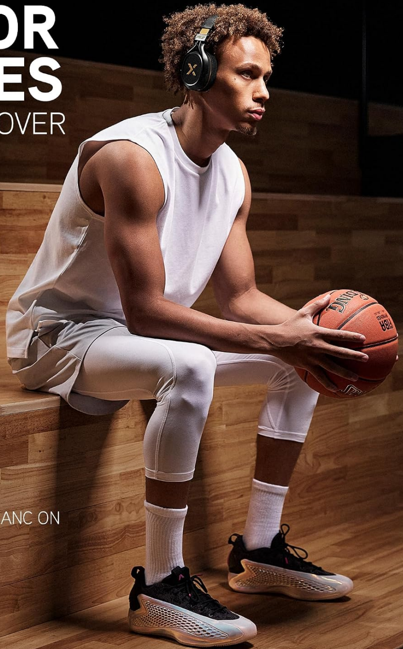
Image: BlueAnt Pump X headphones worn by an athlete, highlighting battery life (34 hours with ANC, 58 hours without ANC) and rapid charging capabilities (10 minutes for 4-6 hours playtime).