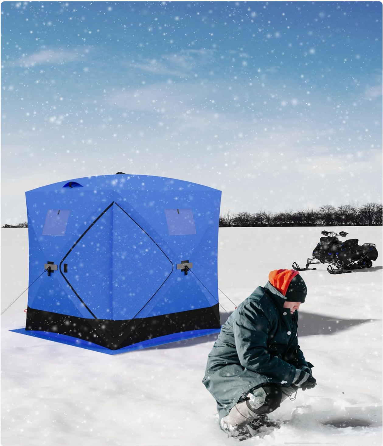
Image: An exploded view highlighting key features of the GarveeLife Ice Fishing Tent, such as windows, doors, air vents, and the warmth-retaining fabric.