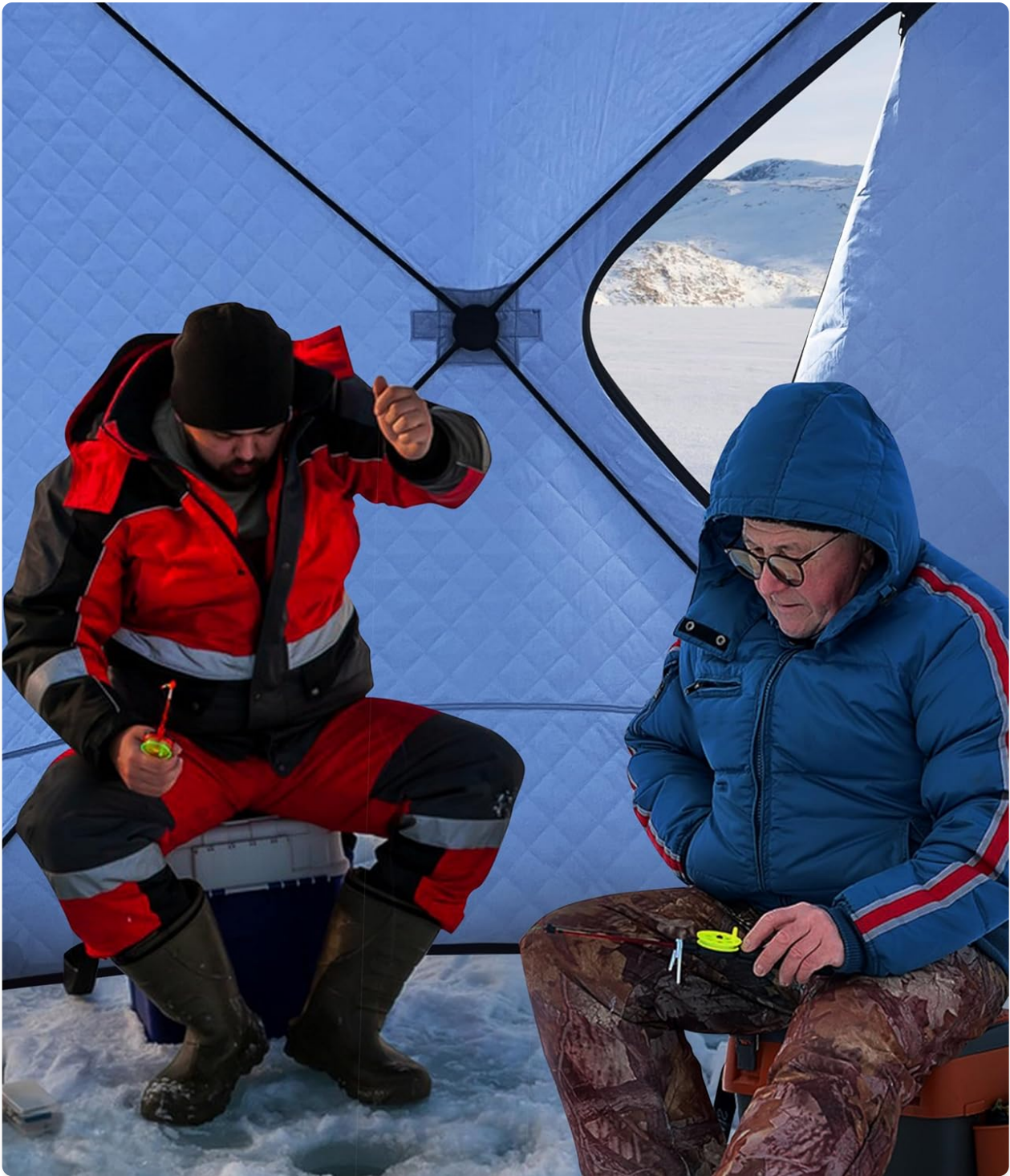
Image: Two individuals comfortably fishing inside the blue GarveeLife Ice Fishing Tent, with a view of the snowy outdoors through a tent window.