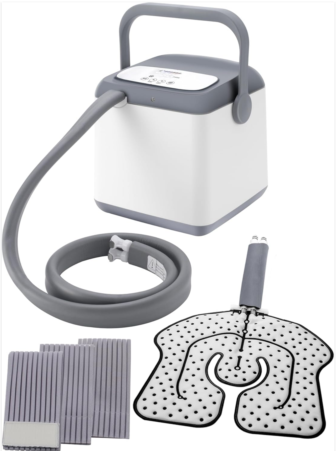
Image 1.1: The NEHOO Cold Therapy System, including the main unit, connecting hose, and universal cold therapy pad.