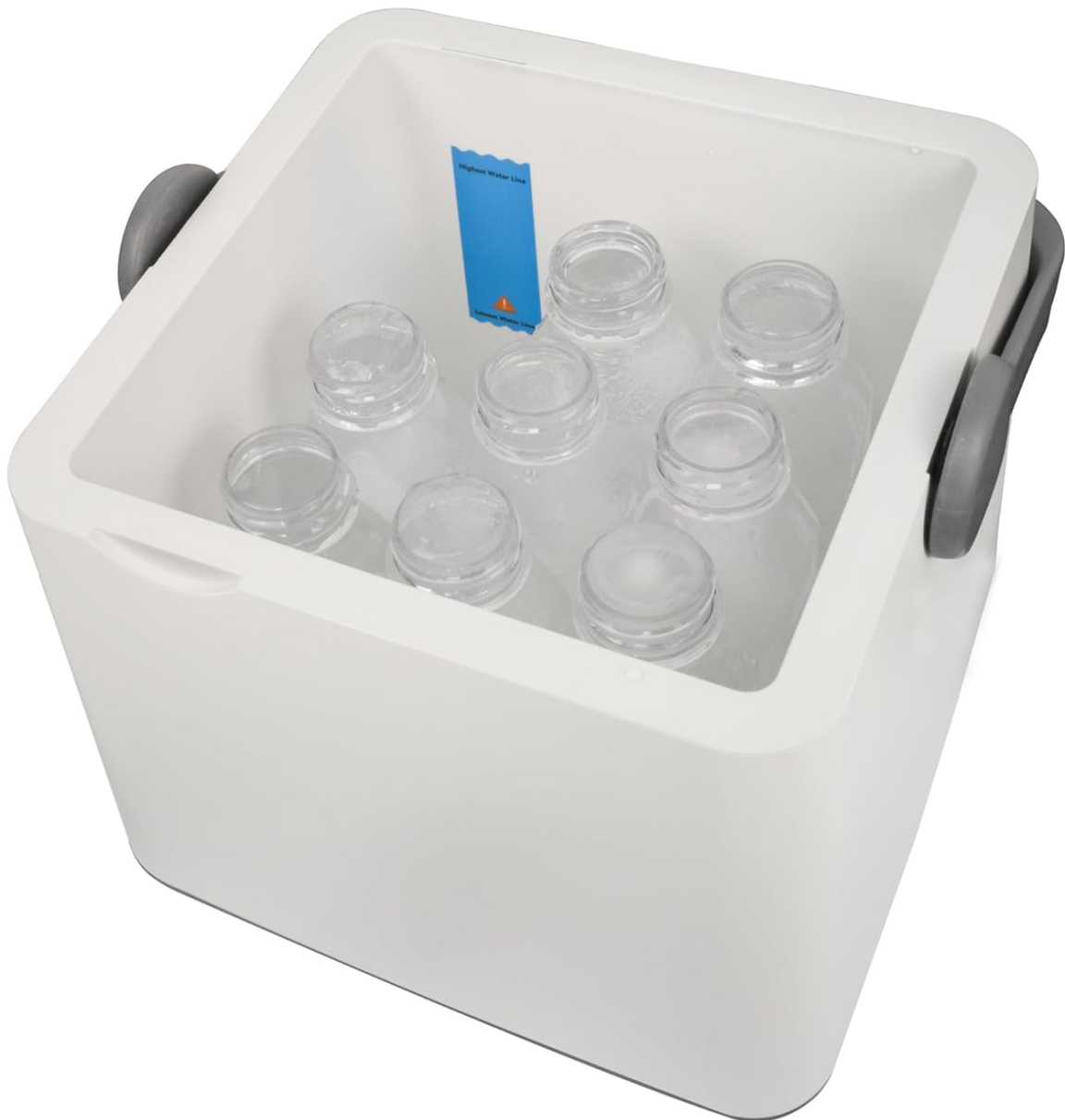
Image 4.1: The internal reservoir of the NEHOO Cold Therapy System, showing the recommended water level and space for adding ice or frozen bottles.