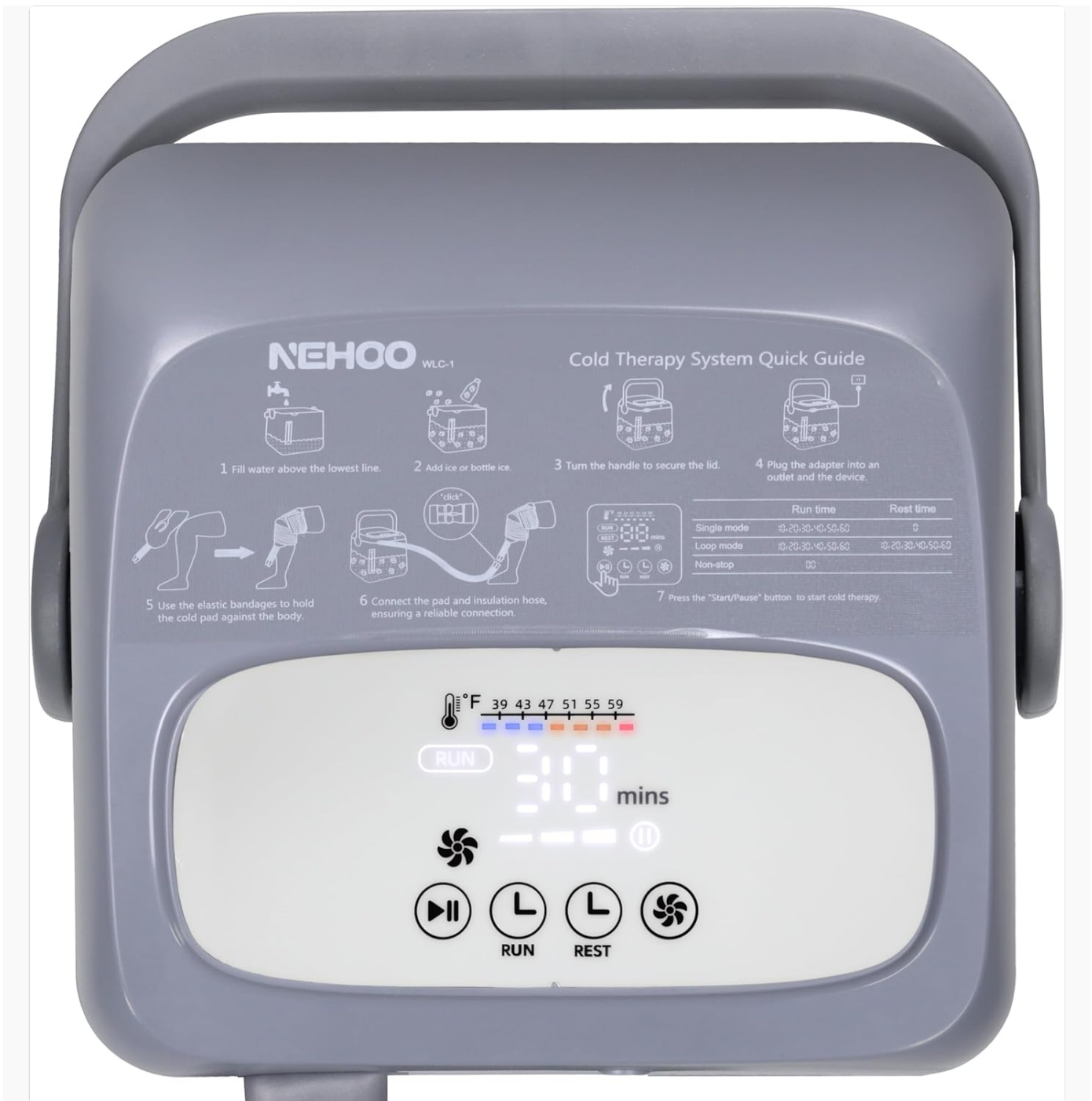
Image 5.1: The control panel of the NEHOO Cold Therapy System, displaying the quick guide for setup and operation.