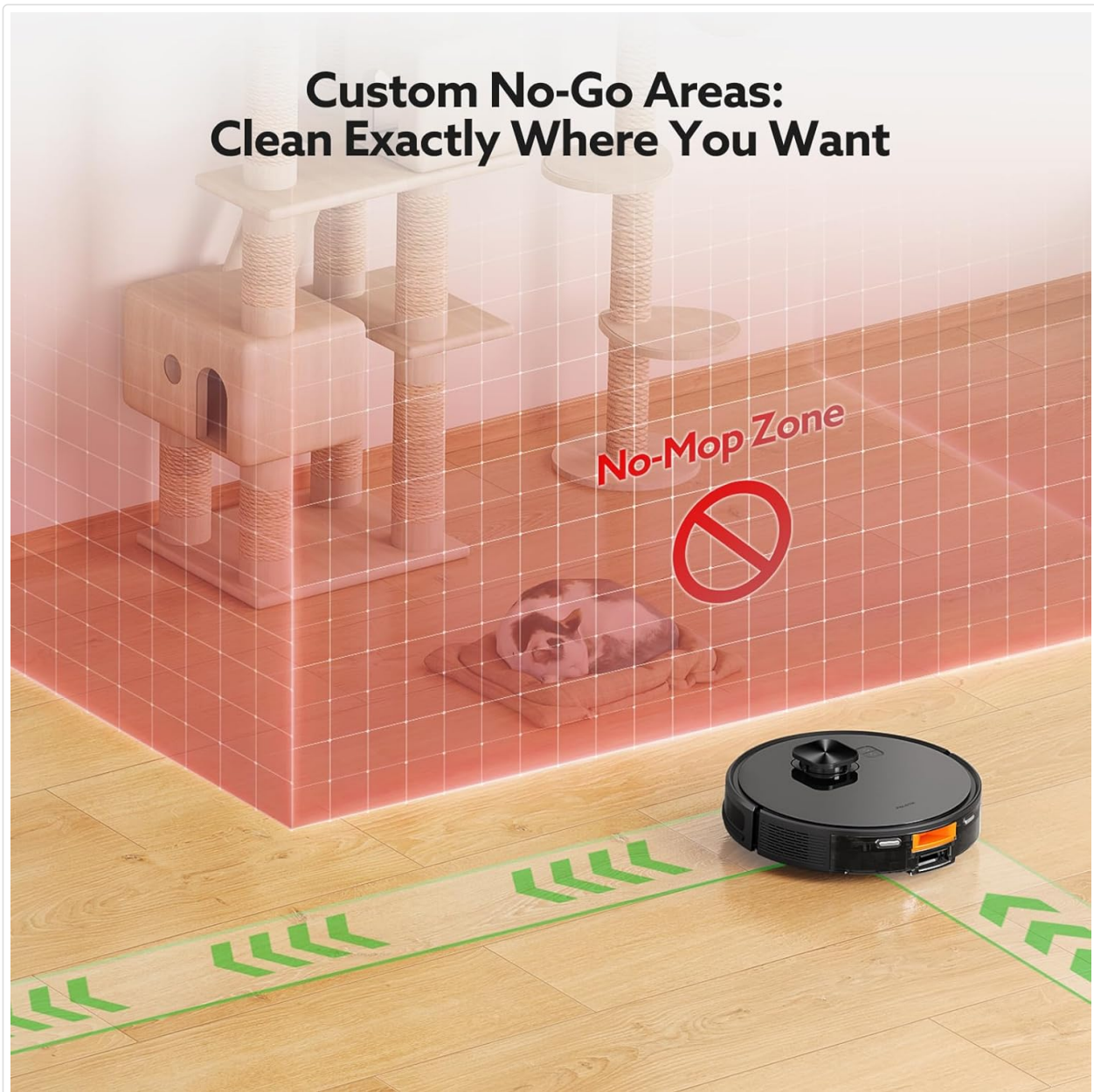
Image: The PALOTR X7 Robot Vacuum Cleaner navigating around a designated 'No-Mop Zone' on a floor, illustrating the custom no-go area feature.