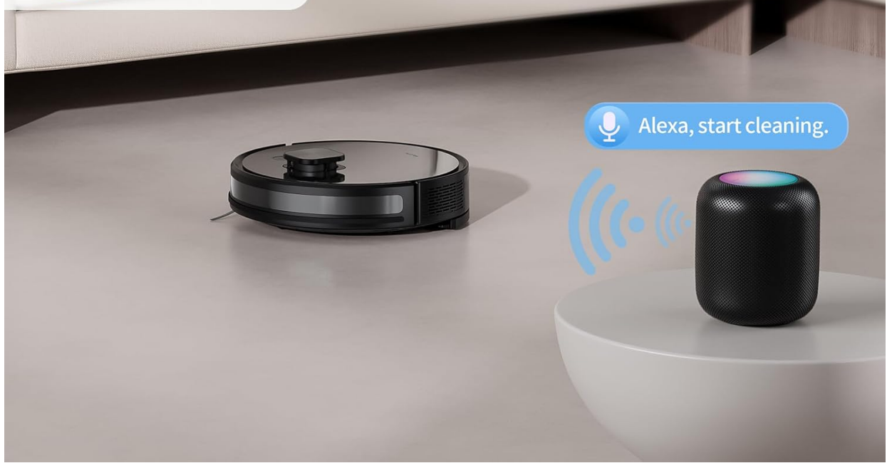
Image: The PALOTR X7 Robot Vacuum Cleaner shown with icons indicating compatibility with Google Assistant and Amazon Alexa, highlighting its app and voice control capabilities.