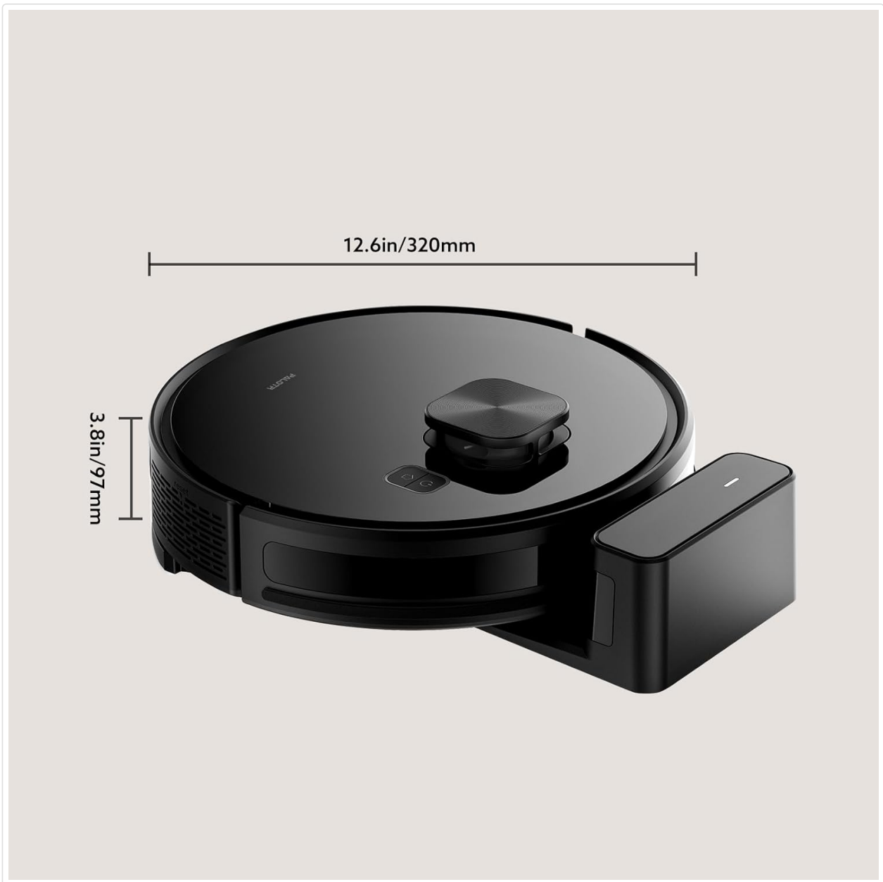
Image: A diagram illustrating the dimensions of the PALOTR X7 Robot Vacuum Cleaner, showing a diameter of 320mm (12.6in) and a height of 97mm (3.8in).