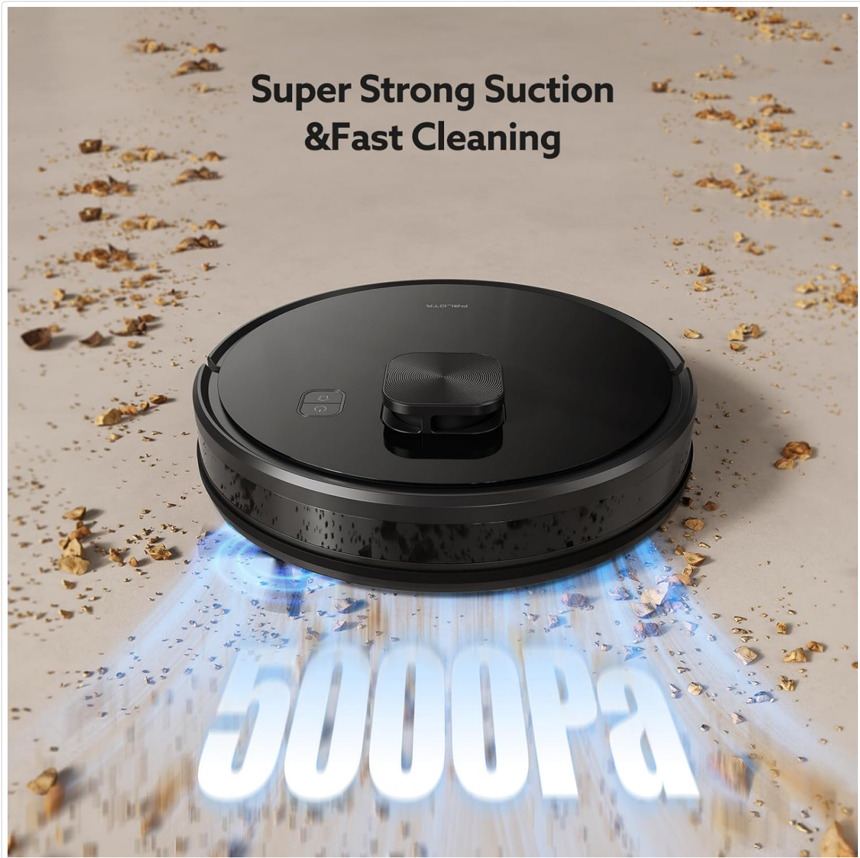
Image: The PALOTR X7 Robot Vacuum Cleaner with its included accessories, such as the charging dock, side brushes, and cleaning tools.