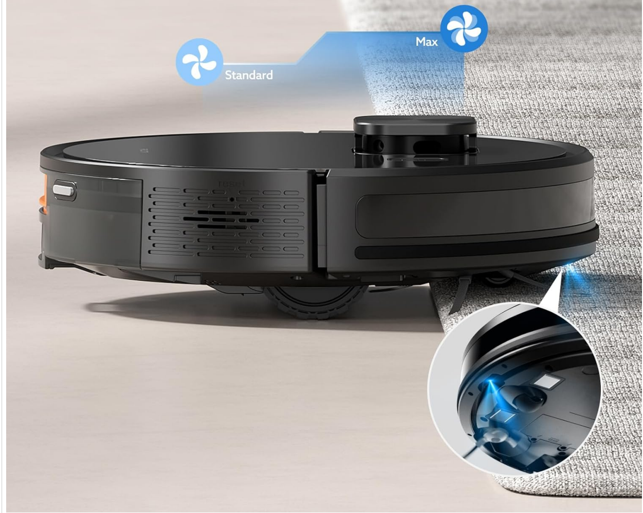
Image: The PALOTR X7 Robot Vacuum Cleaner demonstrating its intelligent recognition and powerful cleaning capabilities, with indicators for 'Standard' and 'Max' suction modes.