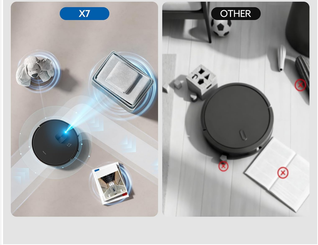
Image: A comparison showing the PALOTR X7 Robot Vacuum Cleaner's precision obstacle detection and avoidance capabilities versus other robots that may collide with objects.