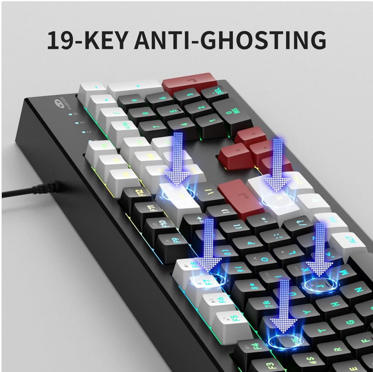
Image: Illustration of 19-key anti-ghosting functionality on the MageGee K2 Keyboard.