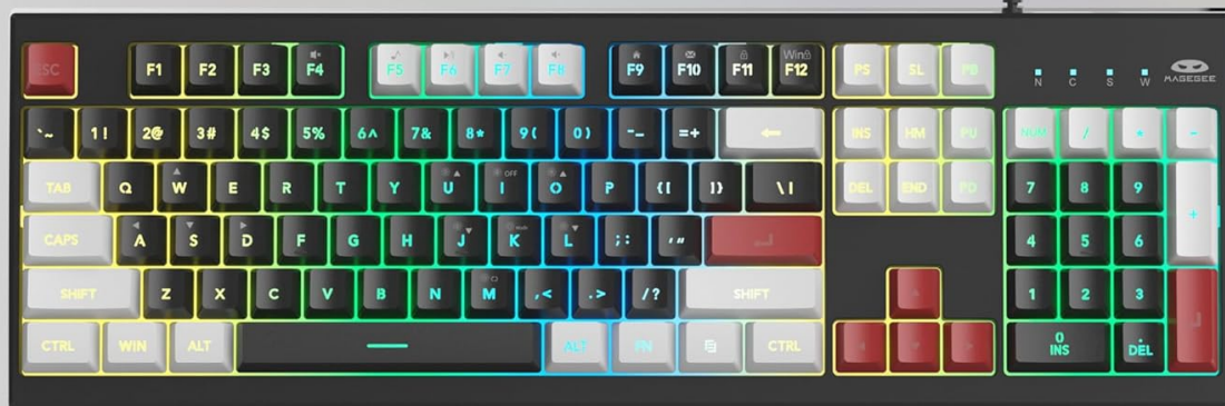
Image: Visual guide to RGB backlight control keys on the MageGee K2 Keyboard.