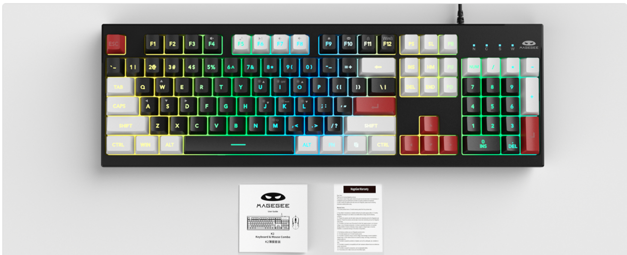
Image: MageGee K2 Keyboard shown with its accompanying user manual.