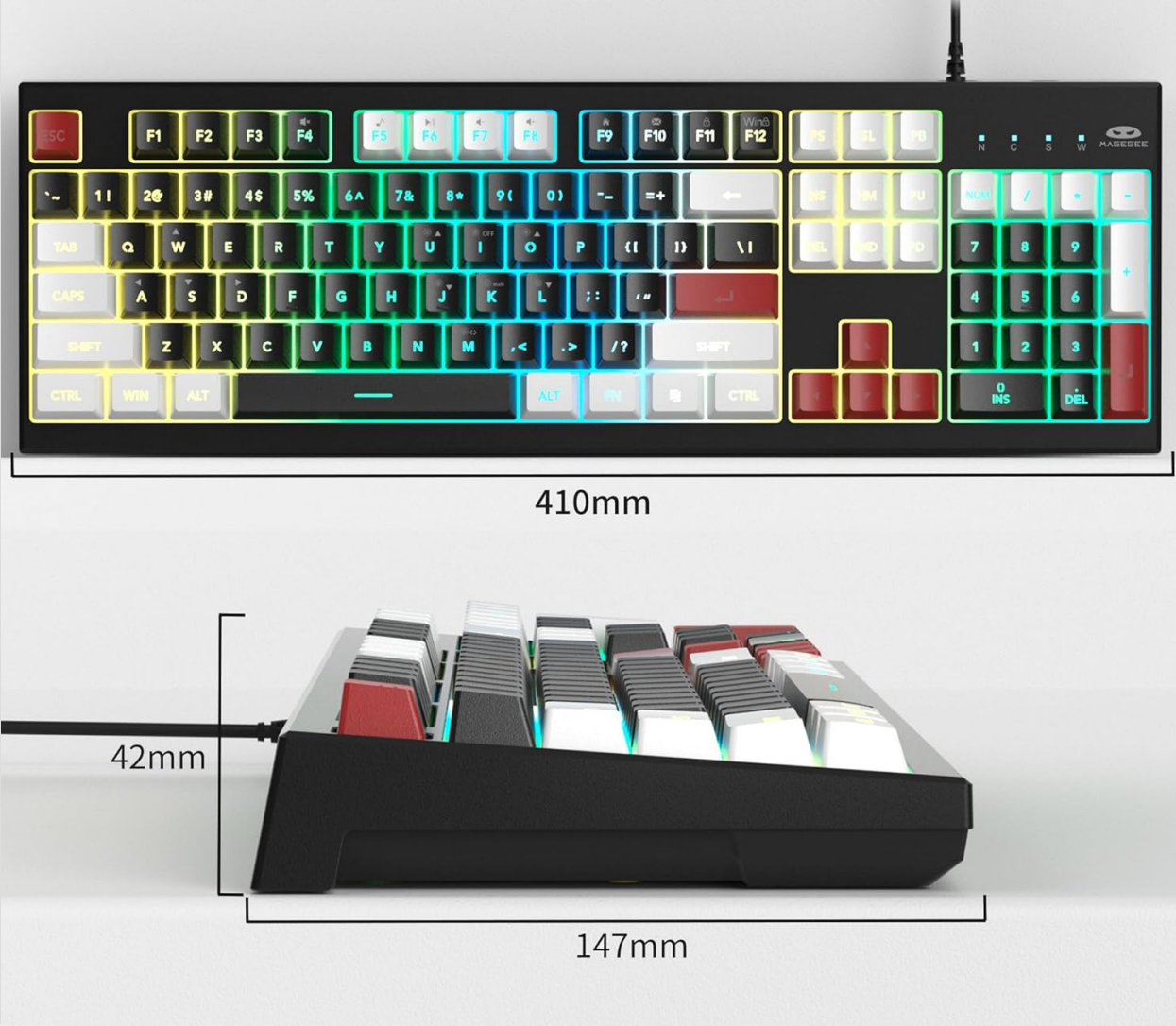
Image: Detailed dimensions of the MageGee K2 Keyboard.