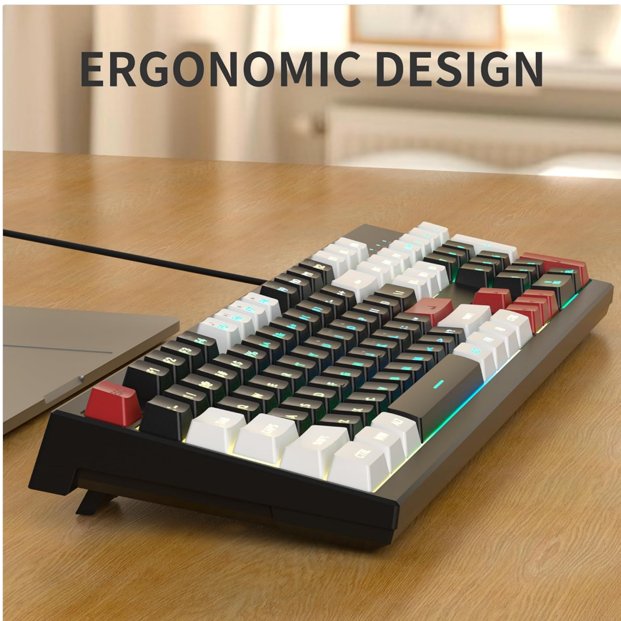
Image: The MageGee K2 Keyboard demonstrating its ergonomic design with adjustable feet.