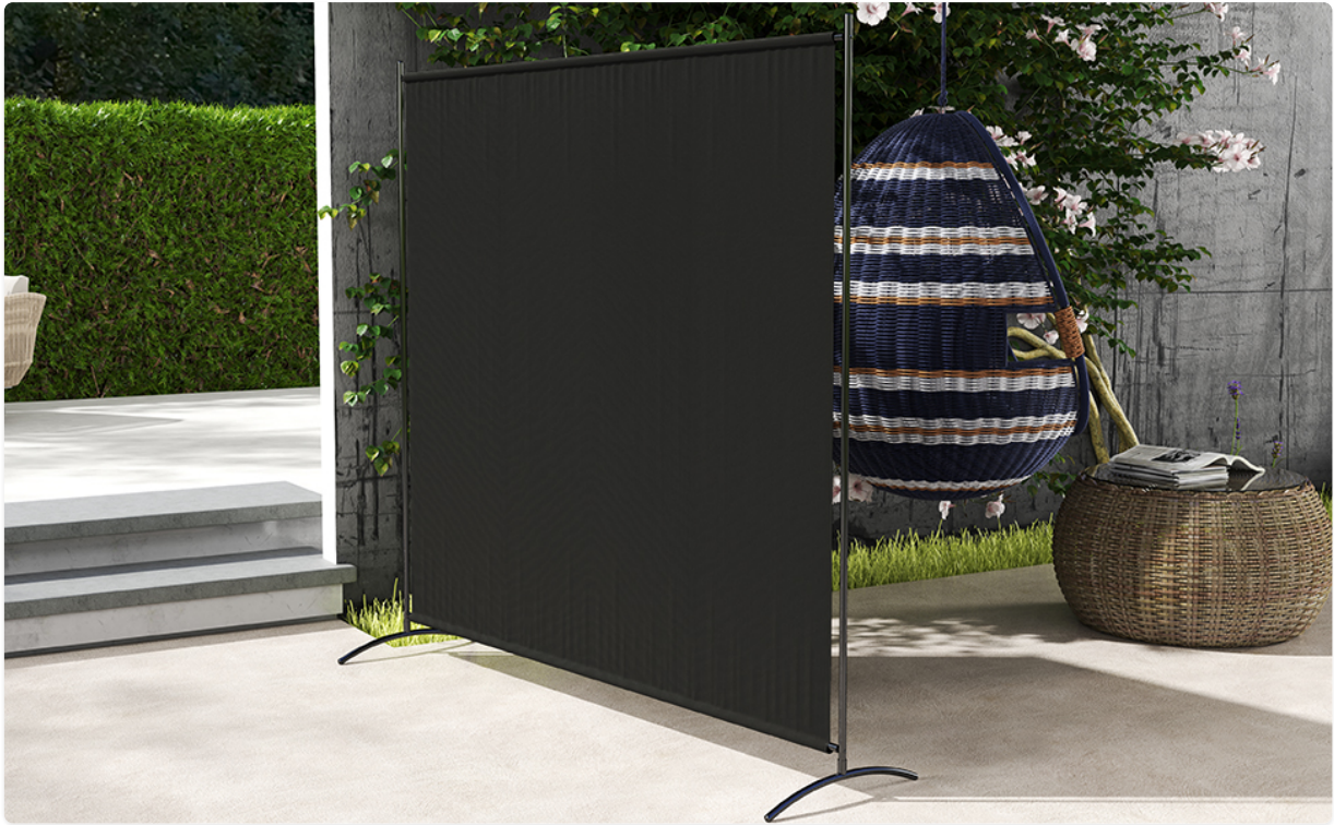
Figure 2: Key components of the privacy screen.