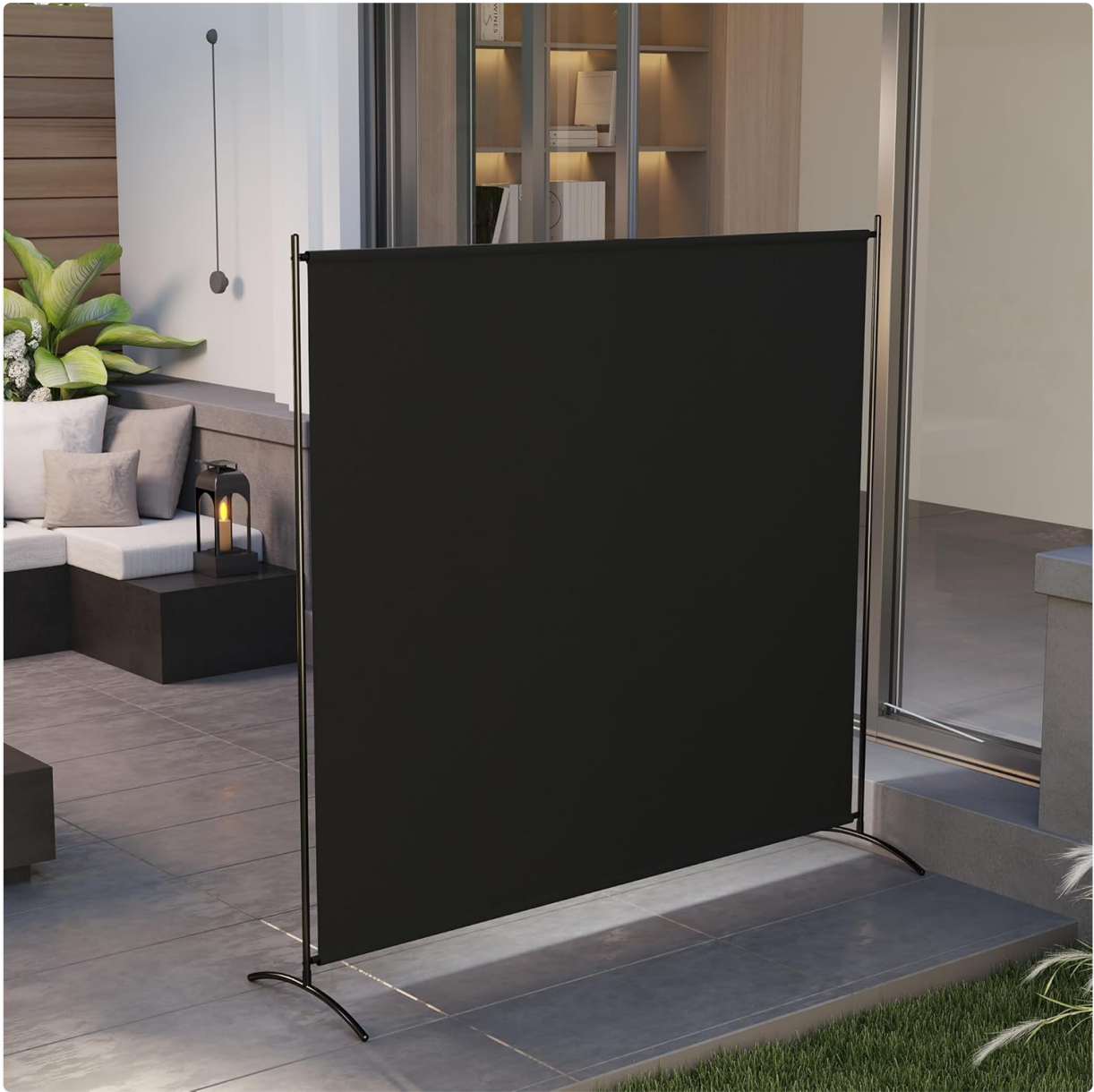
Figure 6: Privacy screen used in an indoor setting.