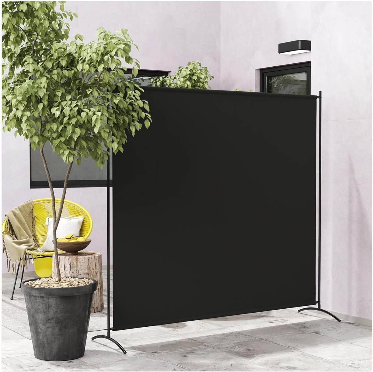
Figure 5: Privacy screen in an outdoor patio setting.