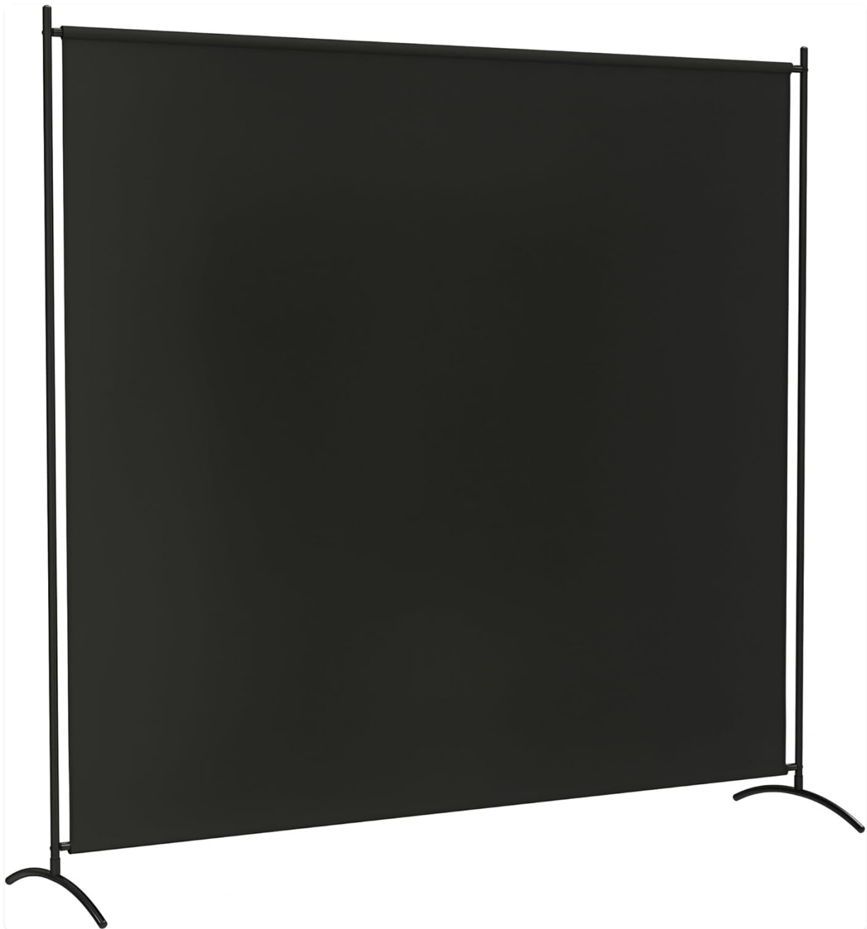
Figure 1: Outsunny Single Outdoor Privacy Screen, Black.