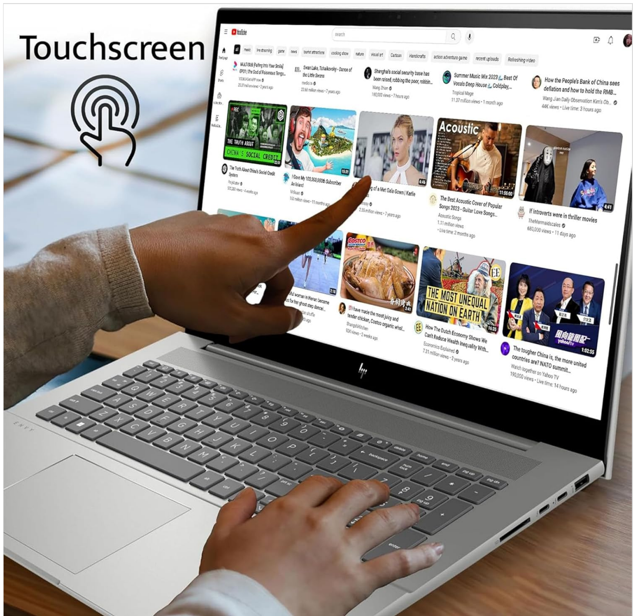
A hand interacting with the touchscreen display of the HP OmniBook laptop, demonstrating its touch capabilities.

applications. Use gestures such as tap, swipe, pinch-to-zoom, and two-finger scroll directly on the screen.