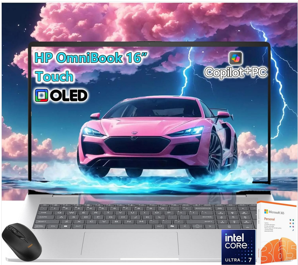
The HP OmniBook Touchscreen Laptop, featuring a 16-inch OLED display, Intel Core Ultra 7 processor, and Windows 11 Pro, shown with an external mouse and Microsoft Office 365 packaging.