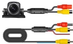
HD Rearview Camera* 1