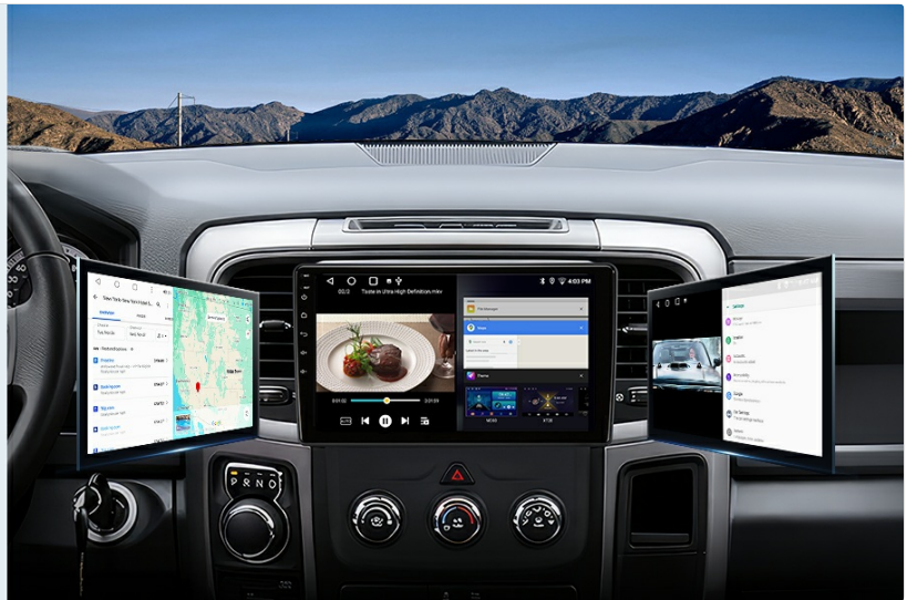
Image: The stereo's split-screen display, showing navigation on one side and media playback on the other, illustrating simultaneous application use.