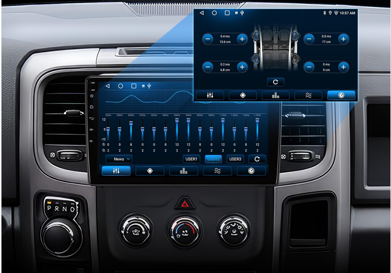
Image: The stereo's display showing the detailed 48-band equalizer and DSP settings for precise audio tuning.

Adjustable sound field, effects, surround sound and more, making the bass fuller, the treble smoother and the midrange richer.