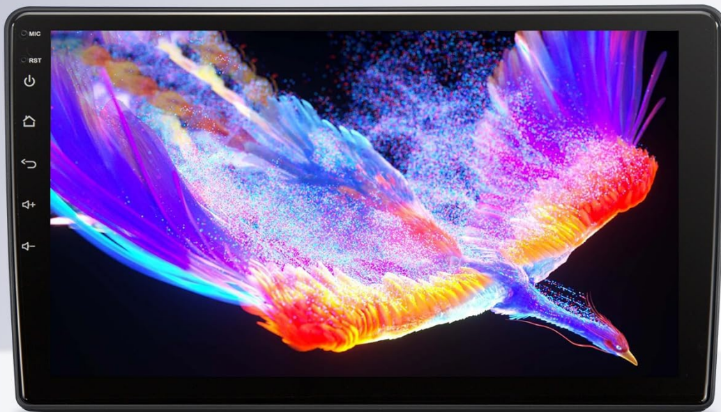
Image: The G+G In-Cell Touch Screen, showcasing its 1280x720 pixel resolution with enhanced color accuracy, brightness, and contrast.