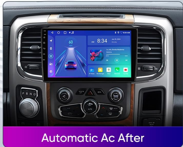
Image: Comparison of Dodge Ram dashboards before and after the installation of the AINAVITO stereo, demonstrating fitment for both manual and automatic climate control configurations.