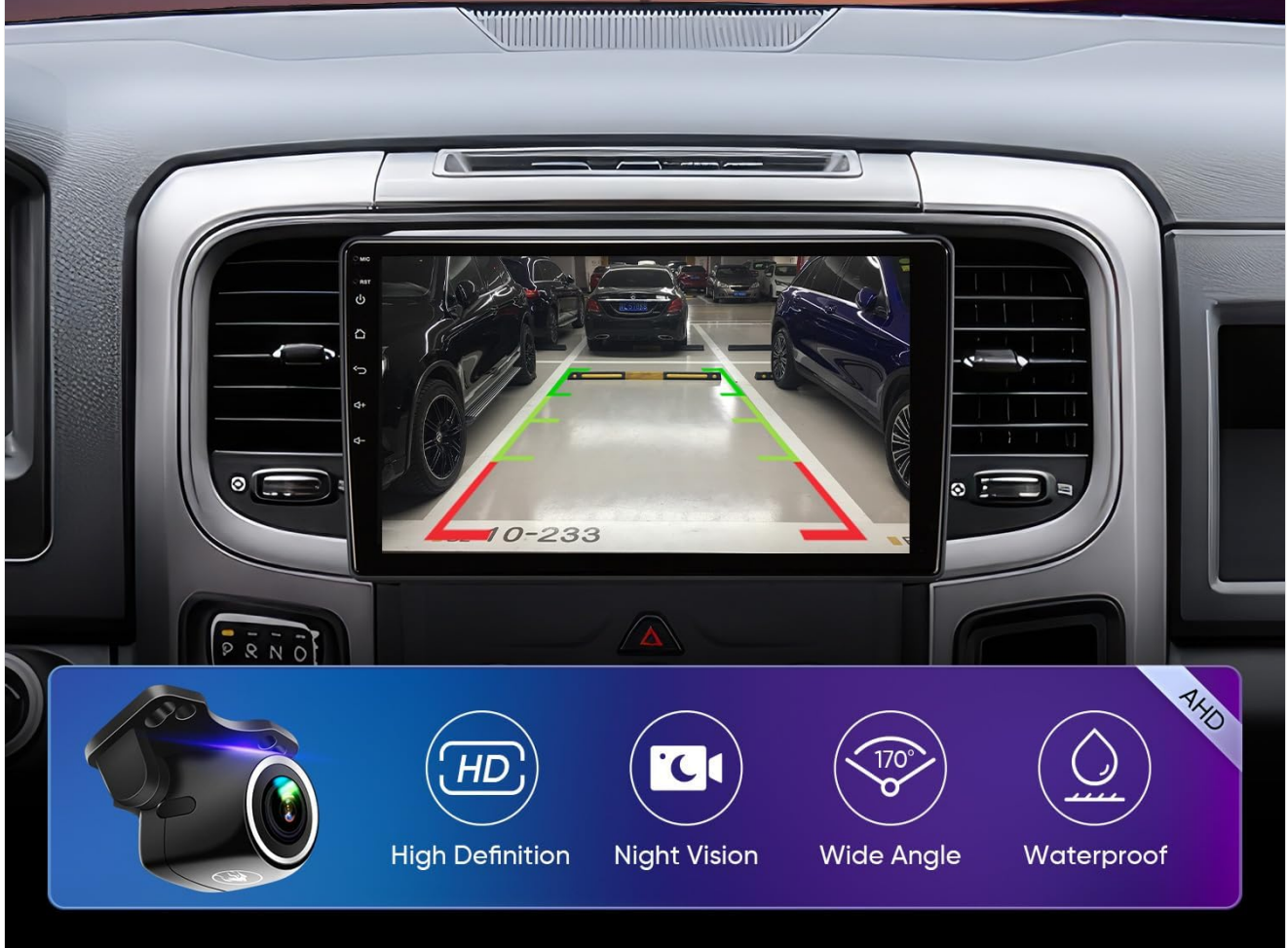
Image: The stereo displaying the high-definition 1080P view from the AHD backup camera, complete with parking assistance lines.

When the vehicle is in R gear, a real-time image of the rear of the vehicle is automatically displayed to assist in reversing.