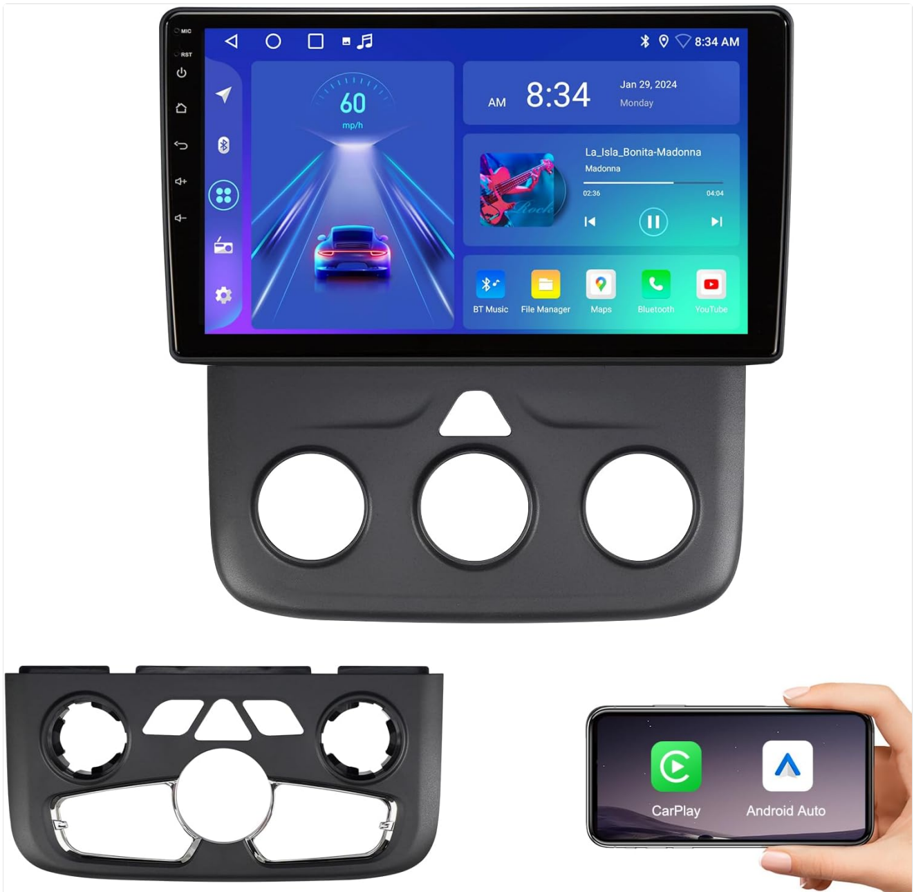
Image: The AINAVITO 10-inch car stereo head unit, shown with both manual and automatic climate control frames, and a smartphone illustrating Wireless CarPlay and Android Auto compatibility.