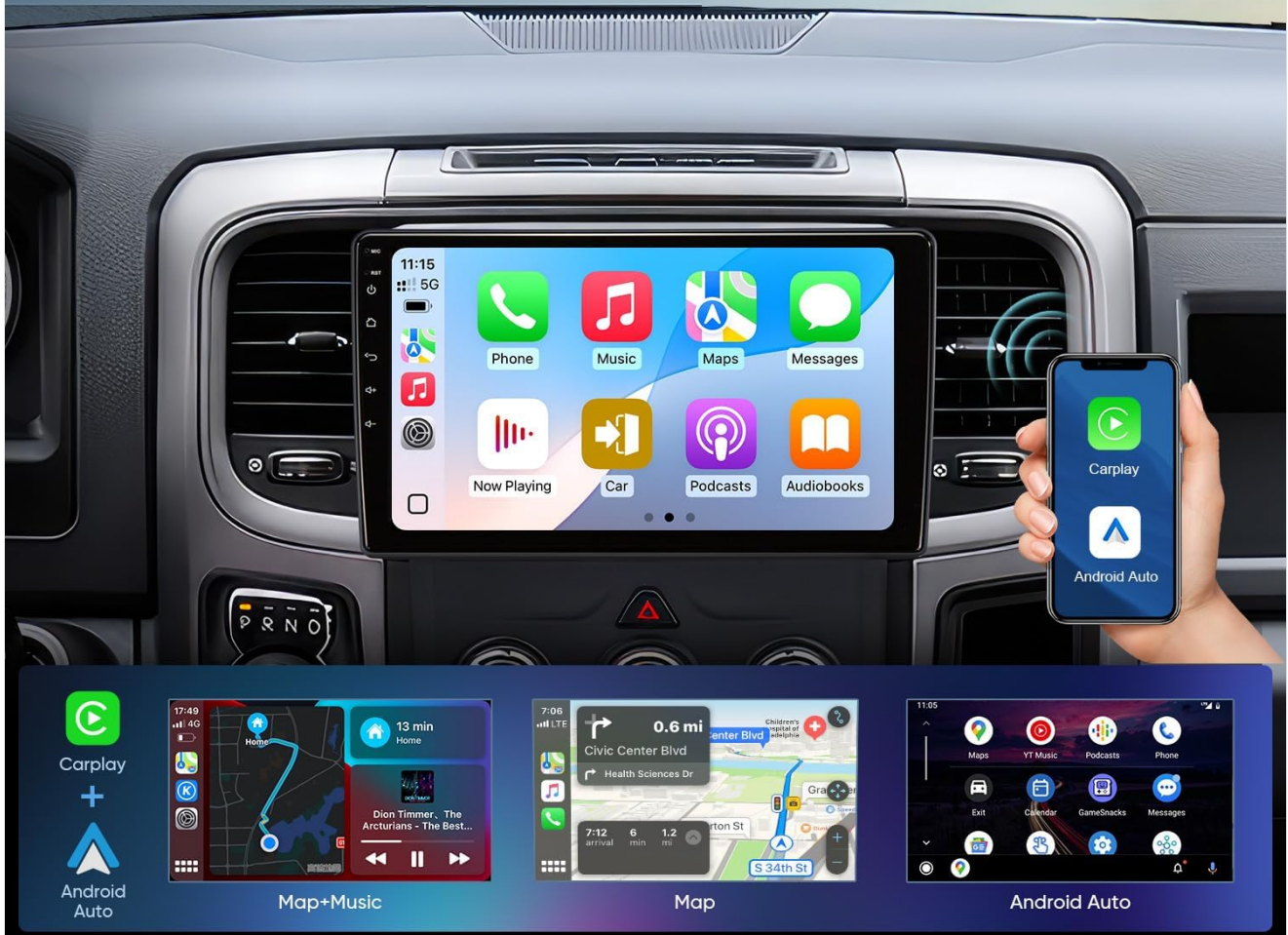
Image: The stereo displaying the CarPlay interface, demonstrating wireless connectivity for both Apple CarPlay and Android Auto.

For iPhone, you can use wired & wireless Carplay. For Android smart phone, you can use the wired Android Auto.