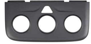
Manual air conditioning panel