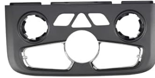
Automatic air conditioning panel