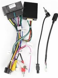
Power Cable & CANbus Decoder