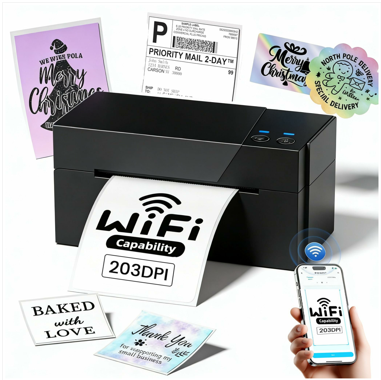
Image: Front view of the Omezizy 247 WiFi Thermal Label Printer.