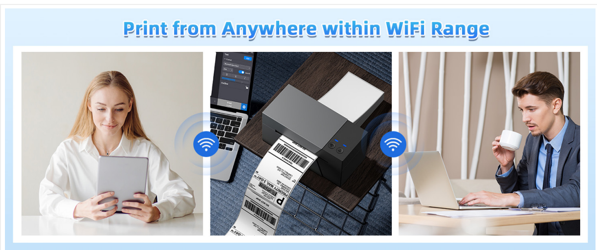
Image: Multiple devices (smartphone, laptop, tablet) wirelessly connected to the Omezify printer via Wi-Fi.

The Omezify 247WF printer supports stable 5GHz Wi-Fi for wireless printing from multiple devices.