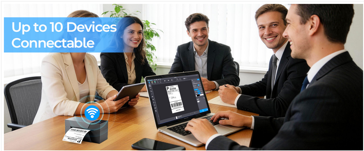
Image: The Omezzy mobile application interface, showcasing its multi-functional capabilities for label design and printing.

The Omezzy app provides a user-friendly interface for printing from your smartphone or tablet.