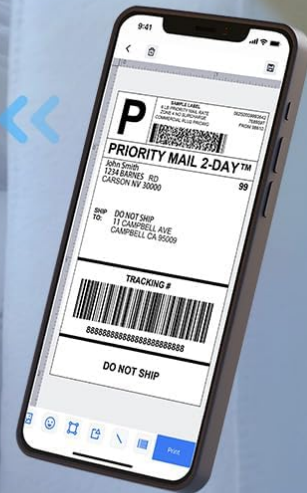
Image: Compatibility with various shipping and e-commerce platforms.