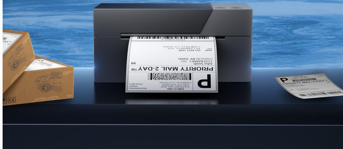
Image: The printer connected to a laptop via USB, demonstrating dual connectivity options.