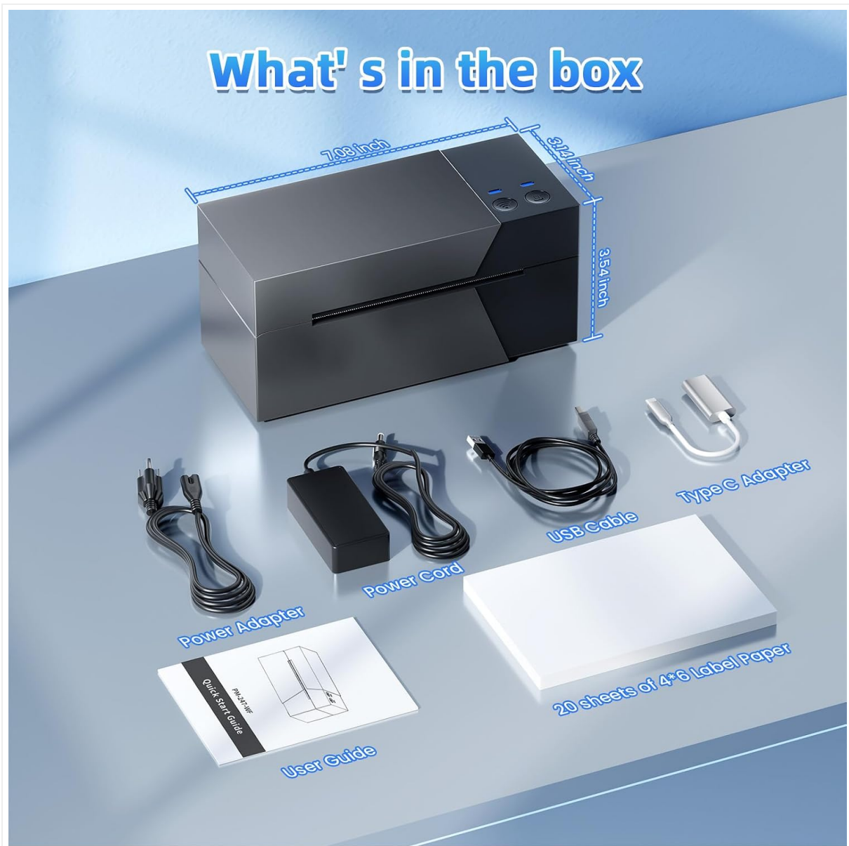
Image: The package contents, including the Omezzy 247 WiFi Thermal Label Printer, power adapter, power cord, USB cable, Type-C converter, user guide, and a starter pack of 4x6 label paper.