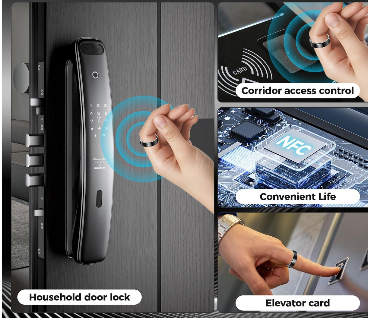
Image: Demonstrates the Hugrow Smart Ring R20's NFC capabilities for smart access control, including unlocking household door locks, gaining corridor access, and operating elevators.