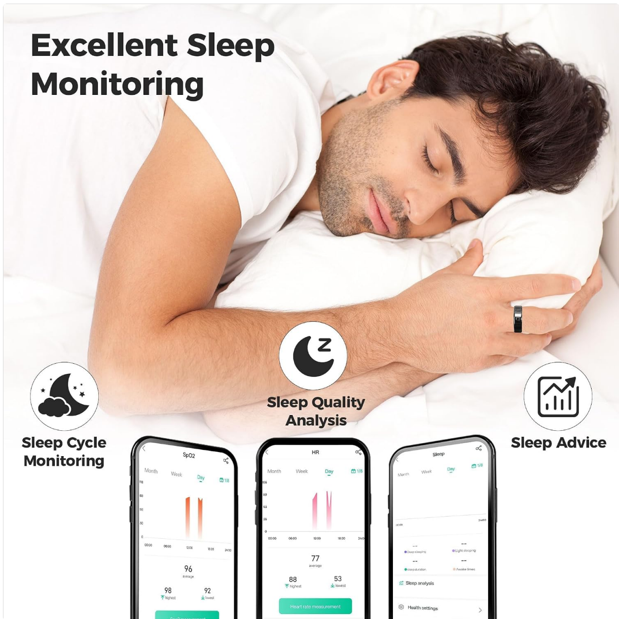
Image: A user sleeping while wearing the Hugrow Smart Ring R20, with accompanying app screenshots illustrating detailed sleep cycle monitoring, analysis, and personalized sleep advice.