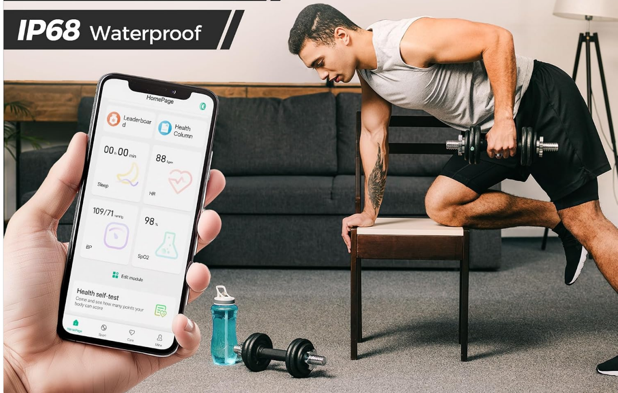
Image: Visual representation of the Hugrow Smart Ring R20's health tracking capabilities, IP68 waterproof rating, and extended battery life.