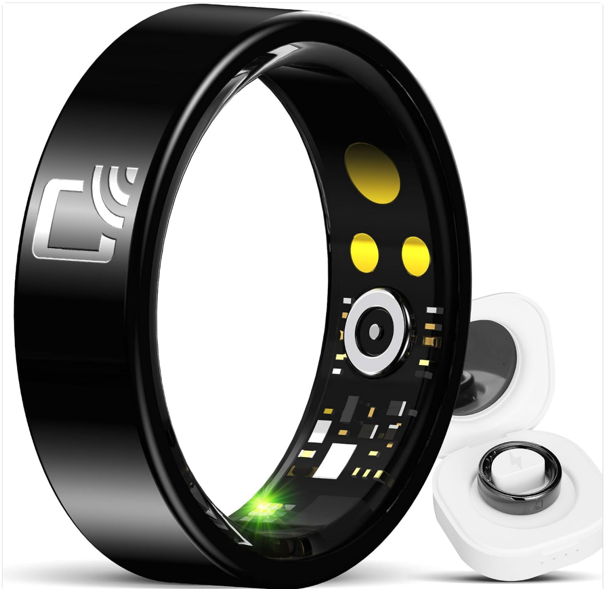
Image: The Hugrow Smart Ring R20, a black ring with internal sensors, shown alongside its white wireless charging case.