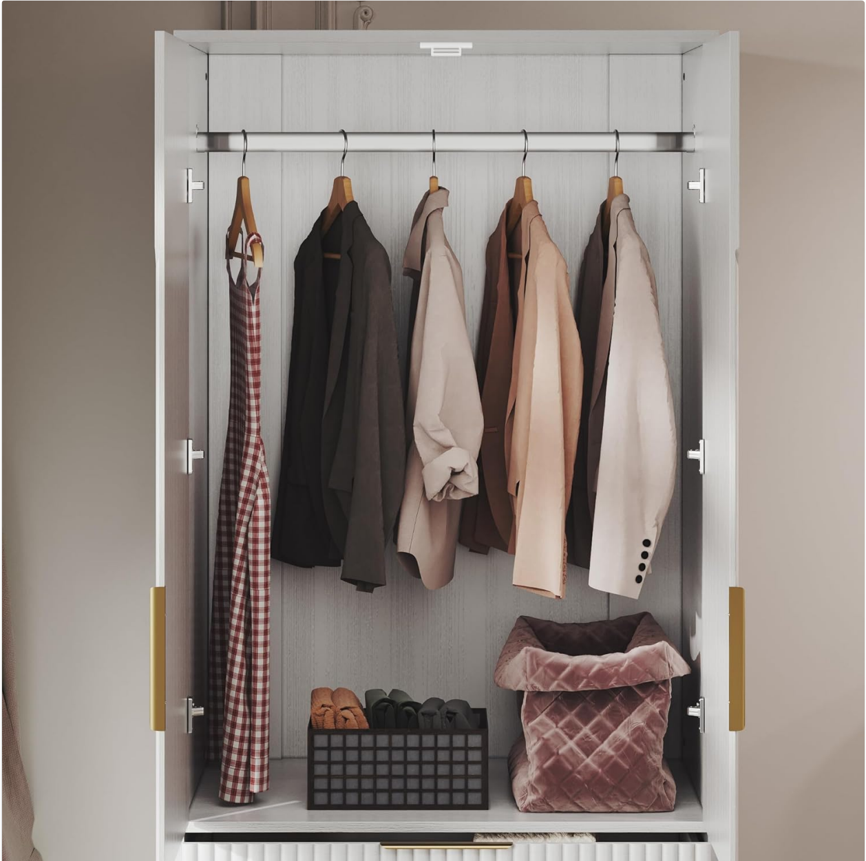
Image 5.1: Interior view showing the hanging rod with various clothing items.

Utilize the metal hanging rod for longer clothing items such as dresses, suits, and coats. Ensure clothes hangers are compatible with the rod diameter.