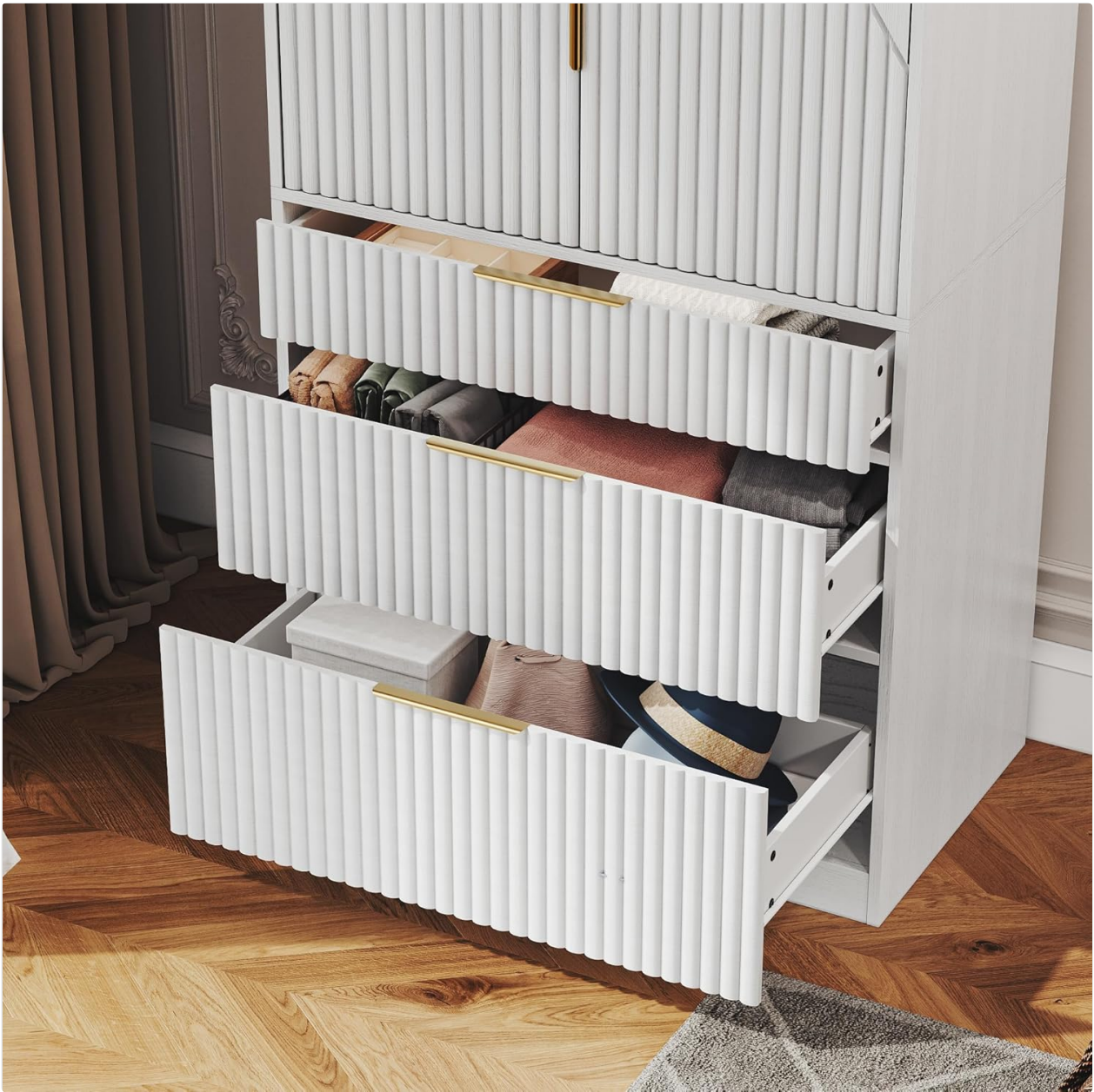
Image 5.2: Open drawers displaying storage capacity for various items.