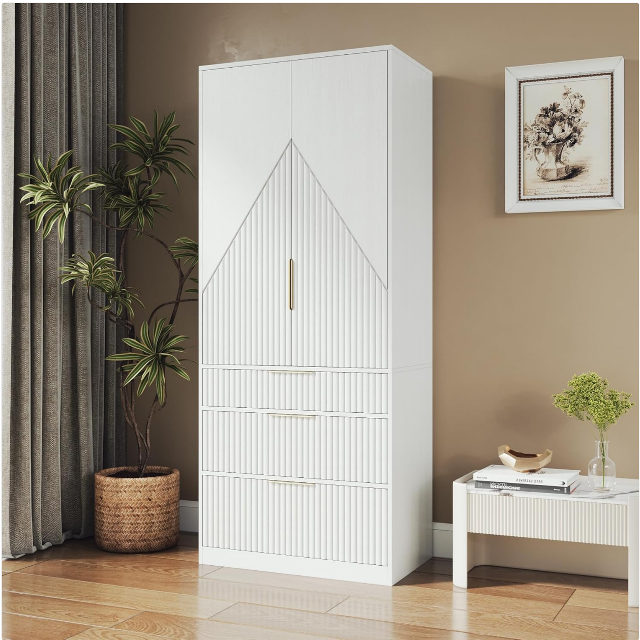
Image 1.1: Fully assembled TOKSOM 71.7 Inch White Wardrobe Armoire.