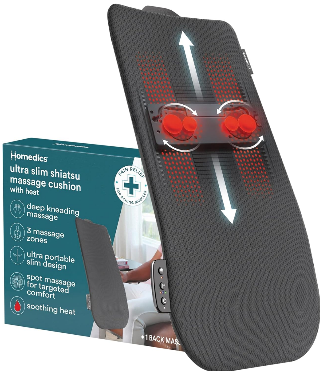
The HoMedics Ultra Slim Shiatsu Massage Cushion with Heat, shown with its retail packaging.