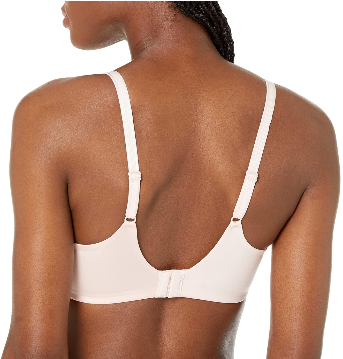
Rear view of the bra, highlighting the Comfort-U® back design which aids in back smoothing and keeps straps from slipping.