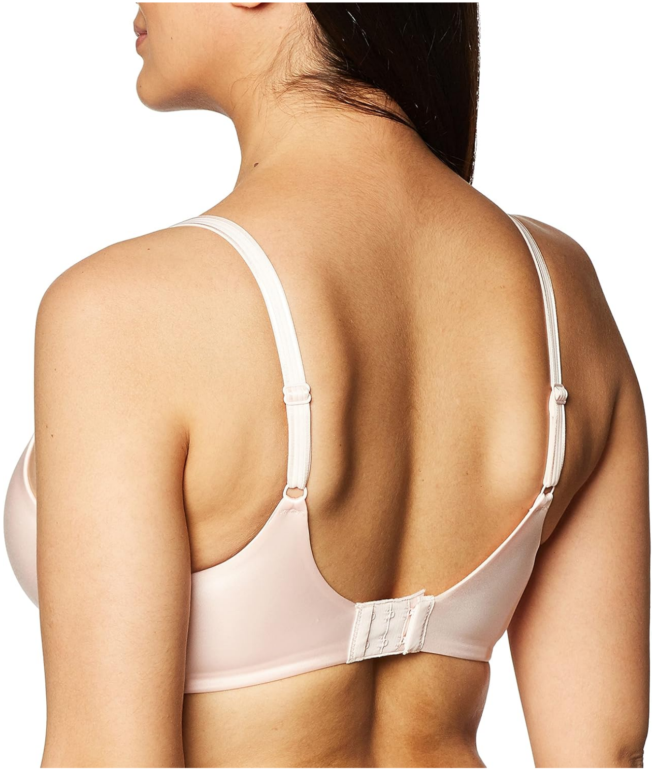
Side profile of the bra, demonstrating the full coverage and seamless cup design.