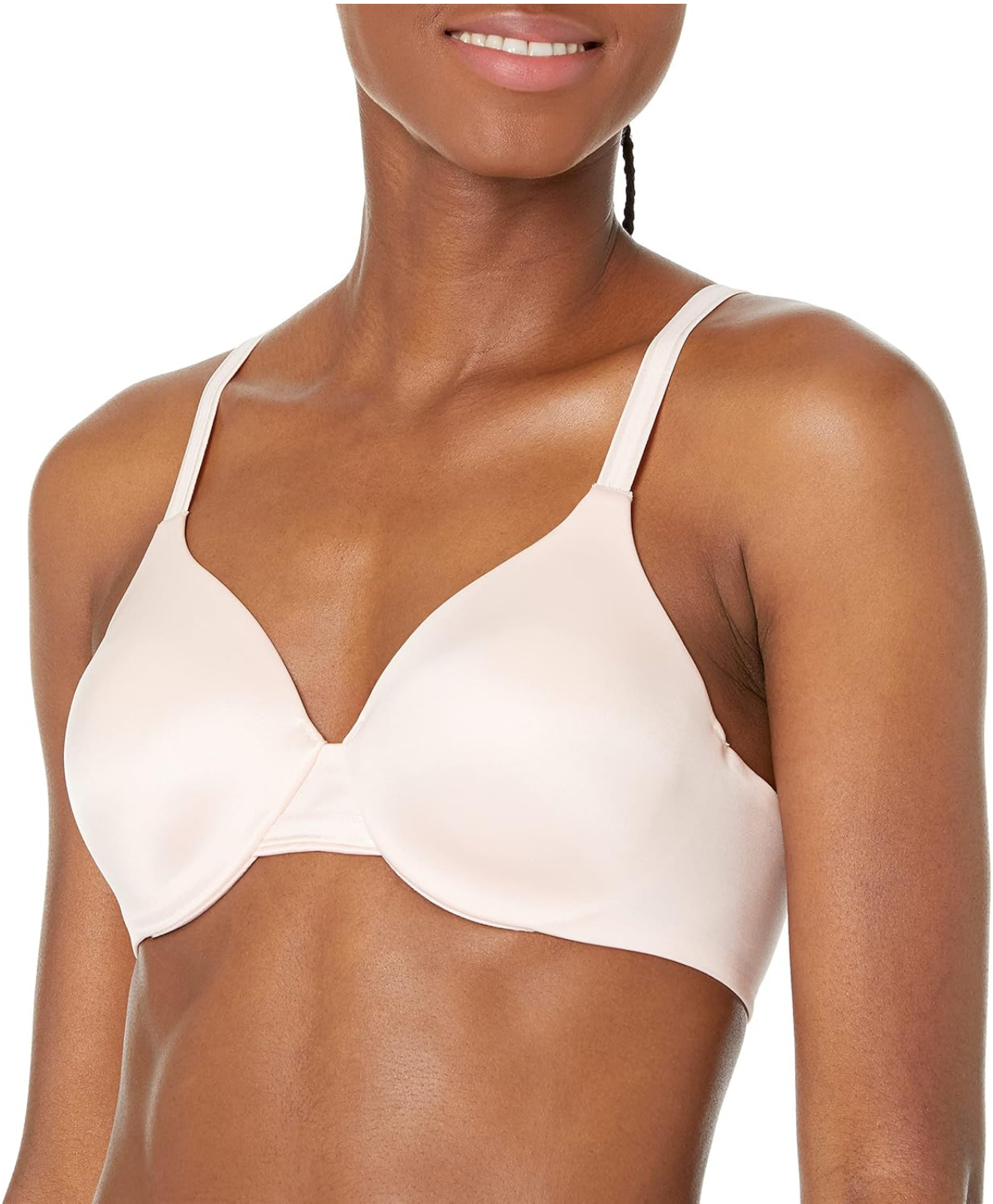
Front view of the Bali One Smooth U Underwire Bra, showcasing its smooth cups and flattering neckline.