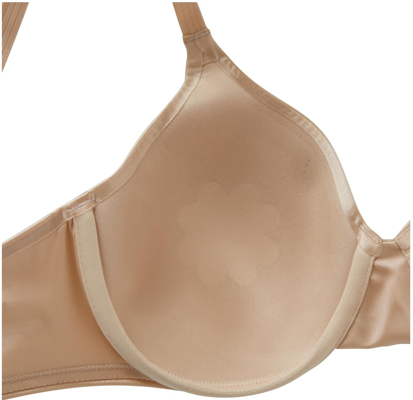
Detailed view of the inside of the bra cup, illustrating the patented concealing petals for modesty.